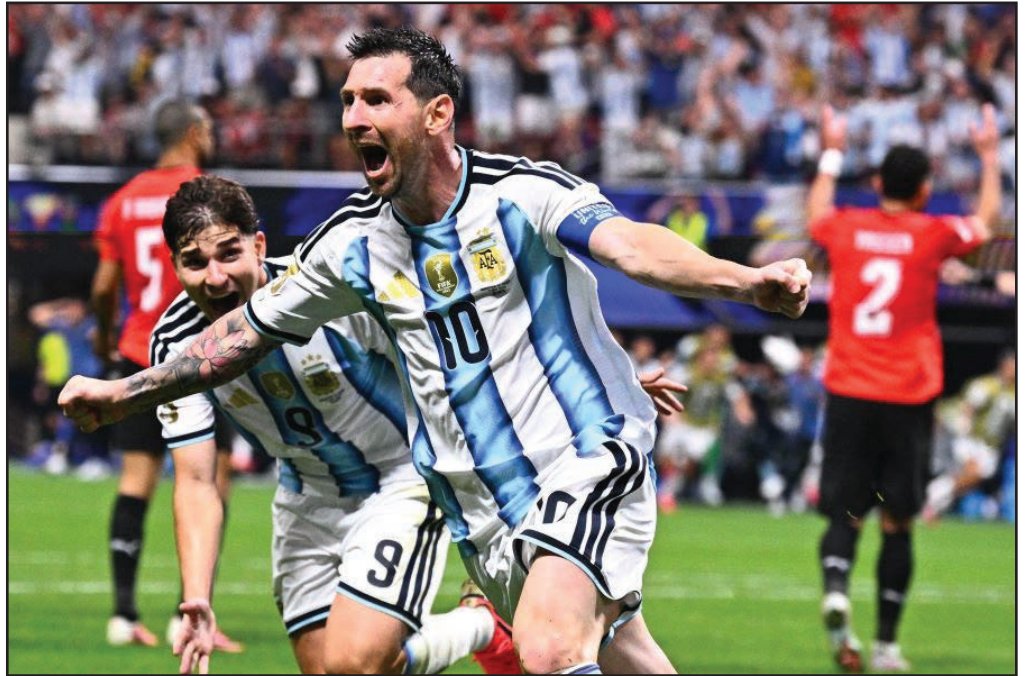
Argentina's Lionel Messi (10) celebrates scoring their second goal during the World Cup round of 16 soccer match between Argentina and Egypt in Atlanta, Tuesday, July 7, 2026.

Egypt felt they deserved a penalty before the breakaway and vociferously complained but to no avail.