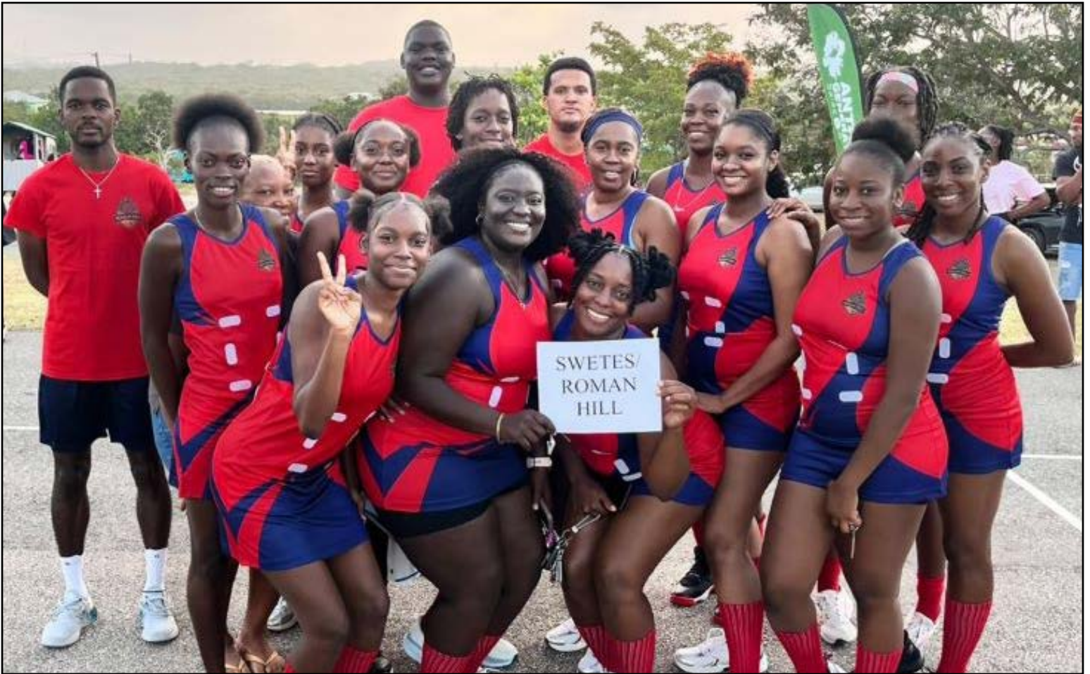
The Swetes Roman Hill female netball team

Swetes/Roman Hill extended their unbeaten run in the Antigua and Barbuda Netball Association's (ABNA) Antigua Generators and Cool and Smooth Village League on Sunday evening.