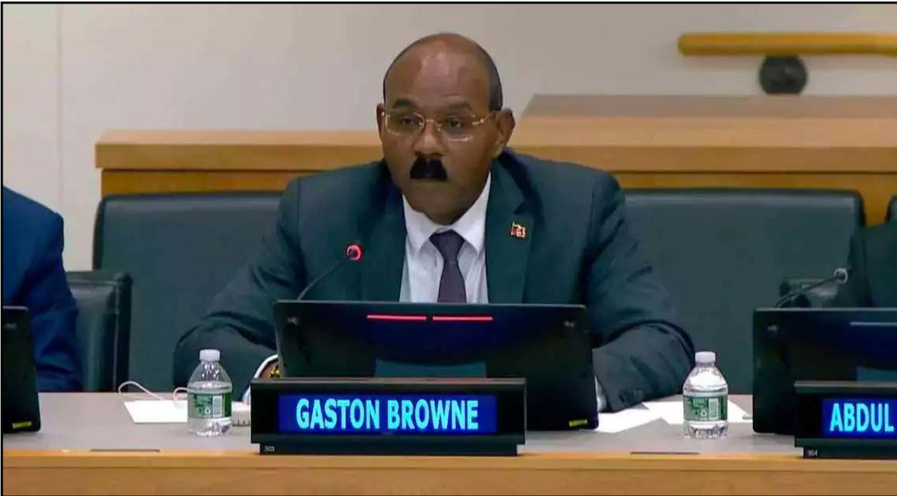
Prime Minister Gaston Browne

Delivering some of his strongest remarks on the current threats facing island nations around the globe, Antigua and Barbuda Prime Minister the Hon. Gaston Browne has made an impassioned plea for the immediate operationalization of the Multidimensional Vulnerability Index (MVI).