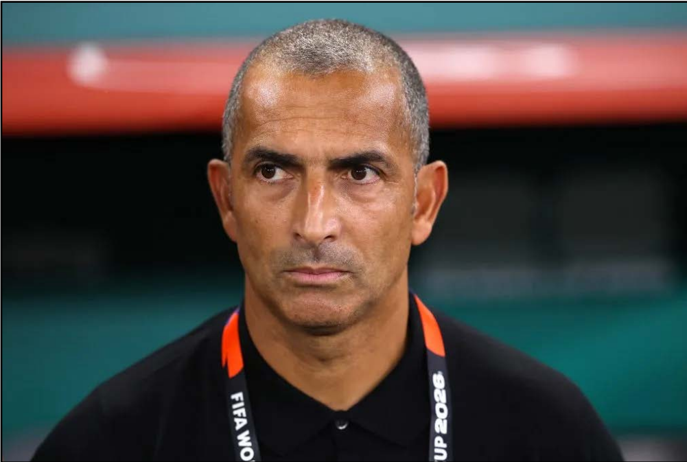
Sabri Lamouchi, Head Coach of Tunisia, looks on before the FIFA World Cup 2026 Group F match between Sweden and Tunisia at Monterrey Stadium in Monterrey, Mexico, on Sunday, June 14, 2026.

MEXICO -- Sabri Lamouchi has been sacked by Tunisia after just one game of World Cup 2026.