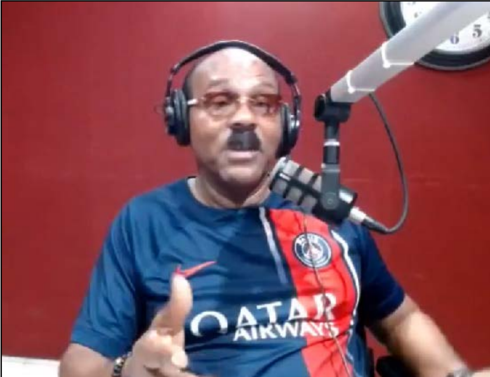
Prime Minister Gaston Browne speaking on the Browne and Browne show

Prime Minister Gaston Browne is taking the unusual step of publishing a letter sent to the US Government since last August detailing a number of concerns that Antigua and Barbuda had regarding the acceptance of refugees that were being expelled from the United States to third party countries.