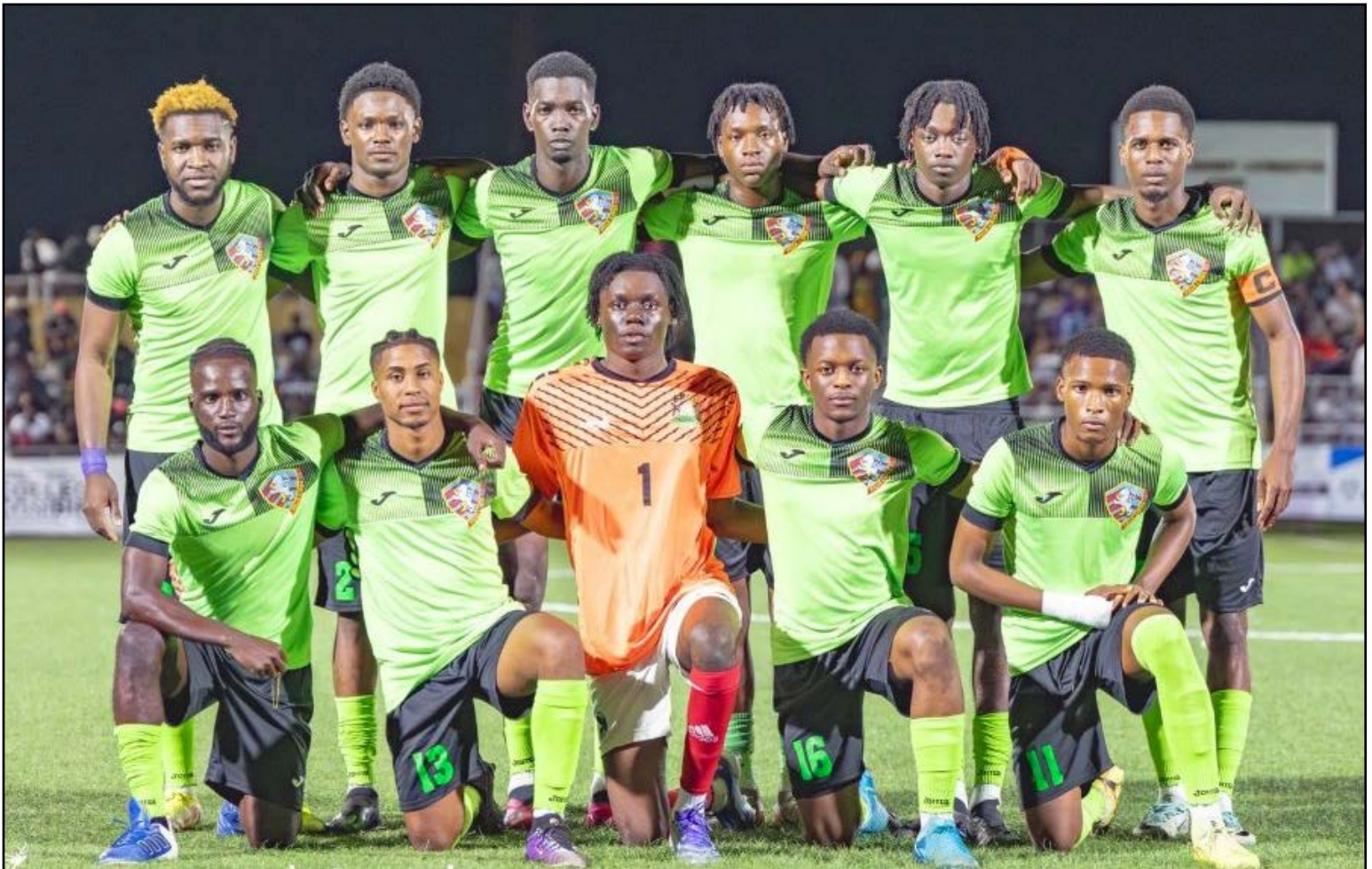
A starting XI of the Villa Lions football team

The Aston Villa Lions consolidated their third-place position in the Antigua and Barbuda Football Association's (ABFA) Premier Division League on Saturday.