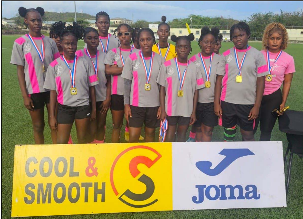
The Princess Margaret School football team with their medals after winning the 2024 Under-20 Girls Division League title by beating Antigua Girls High School 3-0 in the final at the ABFA Technical Center on Wednesday, April 9, 2024.

Princess Margaret School (PMS), the Antigua Grammar School (AGS), and the Harrison Center Antigua and Barbuda School of Continuing Education (HCABSCE) have advanced to the finals in their respective divisions in the Ministry of Sports, Cool and Smooth, and Joma Patrick C. Whyte Cup Secondary Schools' Football Competition.