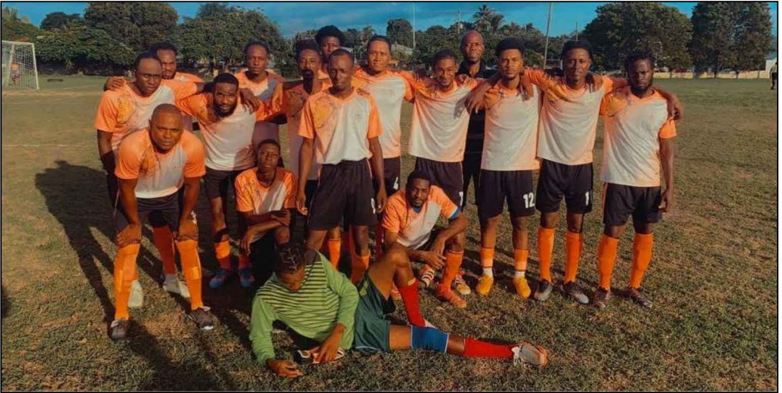
Players of the Golden Grove football team

The Golden Grove FC dropped points for the fourth time to remain in second place and two points adrift of unbeaten leaders, the Freemans Village Scorpions, during the latest round of matches in the Antigua and Barbuda Football Association's (ABFA) First Division League.