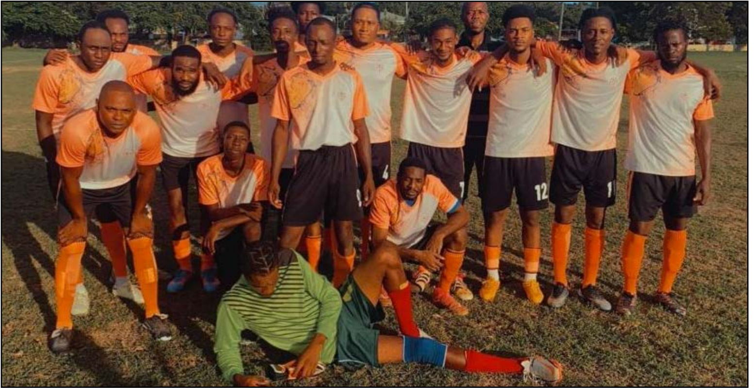
Players of the Golden Grove football team

The Golden Grove FC dropped points for the second time but opened up a four-point gap over the Greenbay Hoppers at the top of the Antigua and Barbuda Football Association's (ABFA) First Division League.