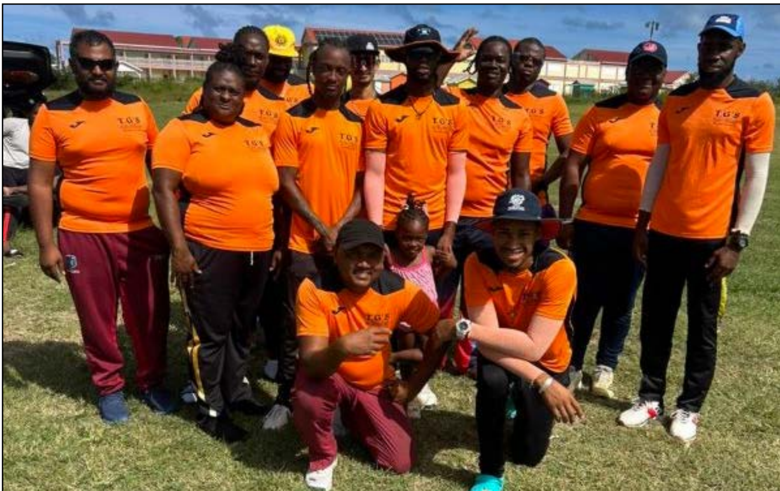
TG Welding softball team

Defending champions TG Welding and Buck and Sons Landscaping Services recorded wins in the latest round of matches, which were affected by rain, in the Mandy Premier League (MPL), Cool and Smooth, Poolside Villa Glendon and Arlene Air BNB, and Sherma Jackson Business Softball Cricket League.