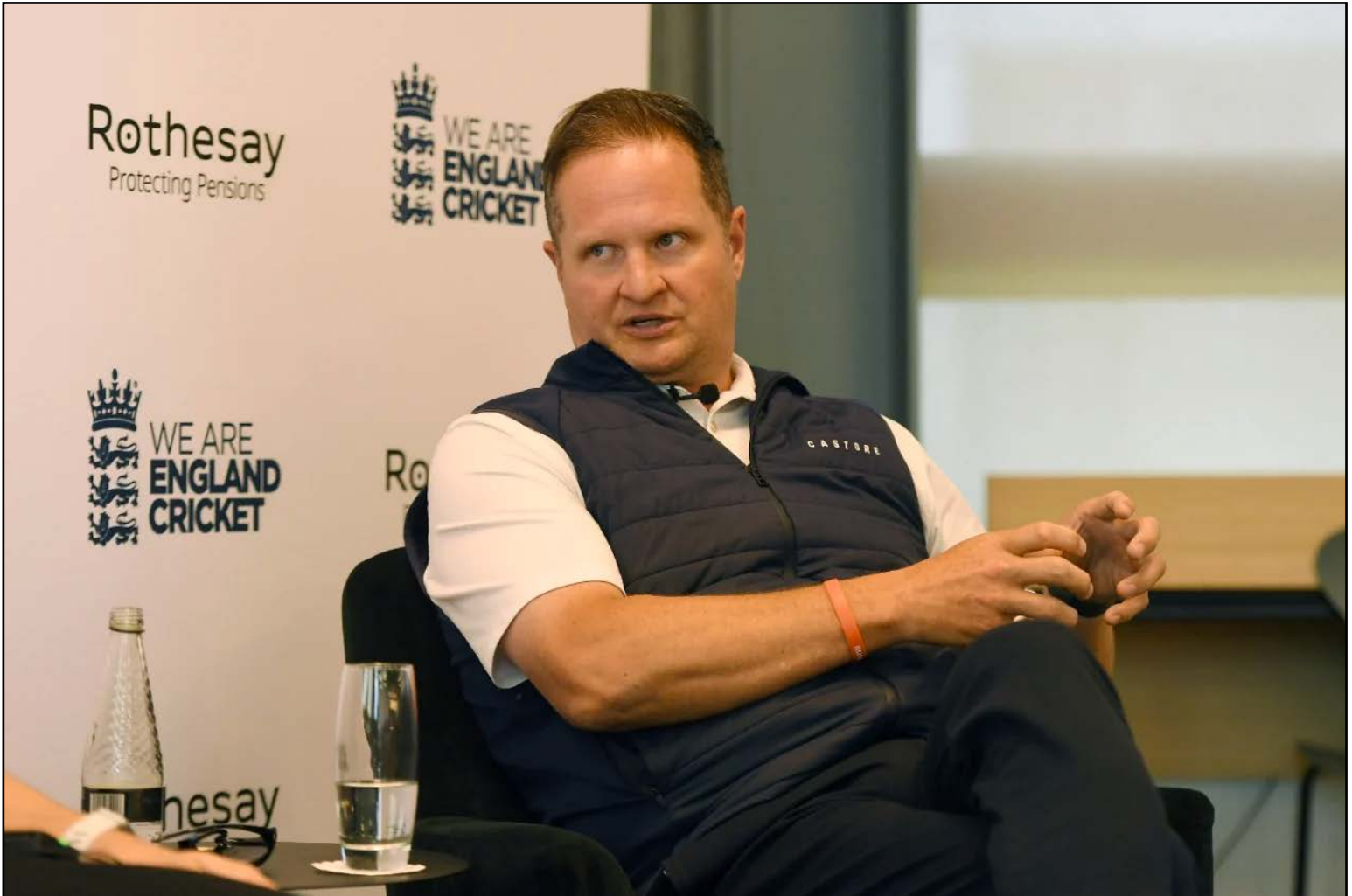
England team director Rob Key

MELBOURNE (Reuters) - England team director Rob Key said they would look into reports that players drank excessively during a break between the second and third Ashes Tests this month.