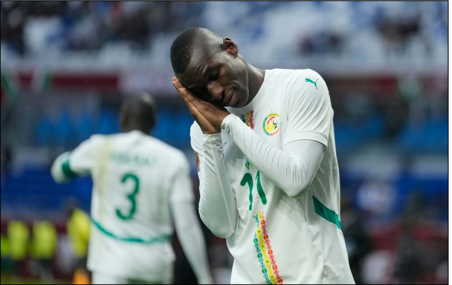
Senegal's Nicolas Jackson celebrates after scoring during the Africa Cup of Nations group D soccer match between Senegal and Botswana in Tangier, Morocco, Tuesday, Dec. 23, 2025.

TANGIER, Morocco (Reuters) - Striker Nicolas Jackson scored twice as Senegal got their 2025 Africa Cup of Nations campaign off to a winning start with a comfortable 3-0 Group D victory over Botswana in Tangier on Tuesday.