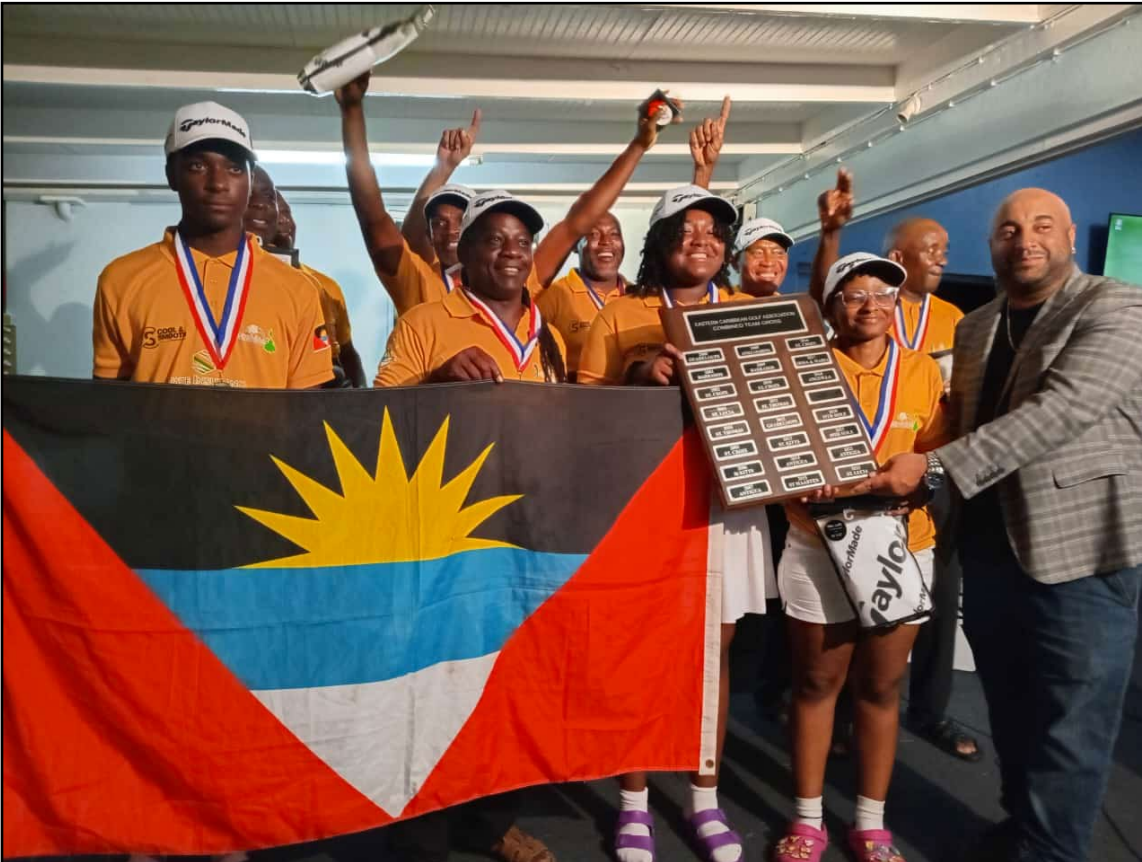
The Antigua and Barbuda team celebrates after winning the 2024 Eastern Caribbean Golf Championships at the Cedar Valley Golf Course in Antigua on October 6, 2024. (File photo)

The Antigua and Barbuda Golf Association (ABGA) has chosen a 12-member squad in its quest to retain the Eastern Caribbean Golf Championship (ECGC) in St. Kitts this weekend.