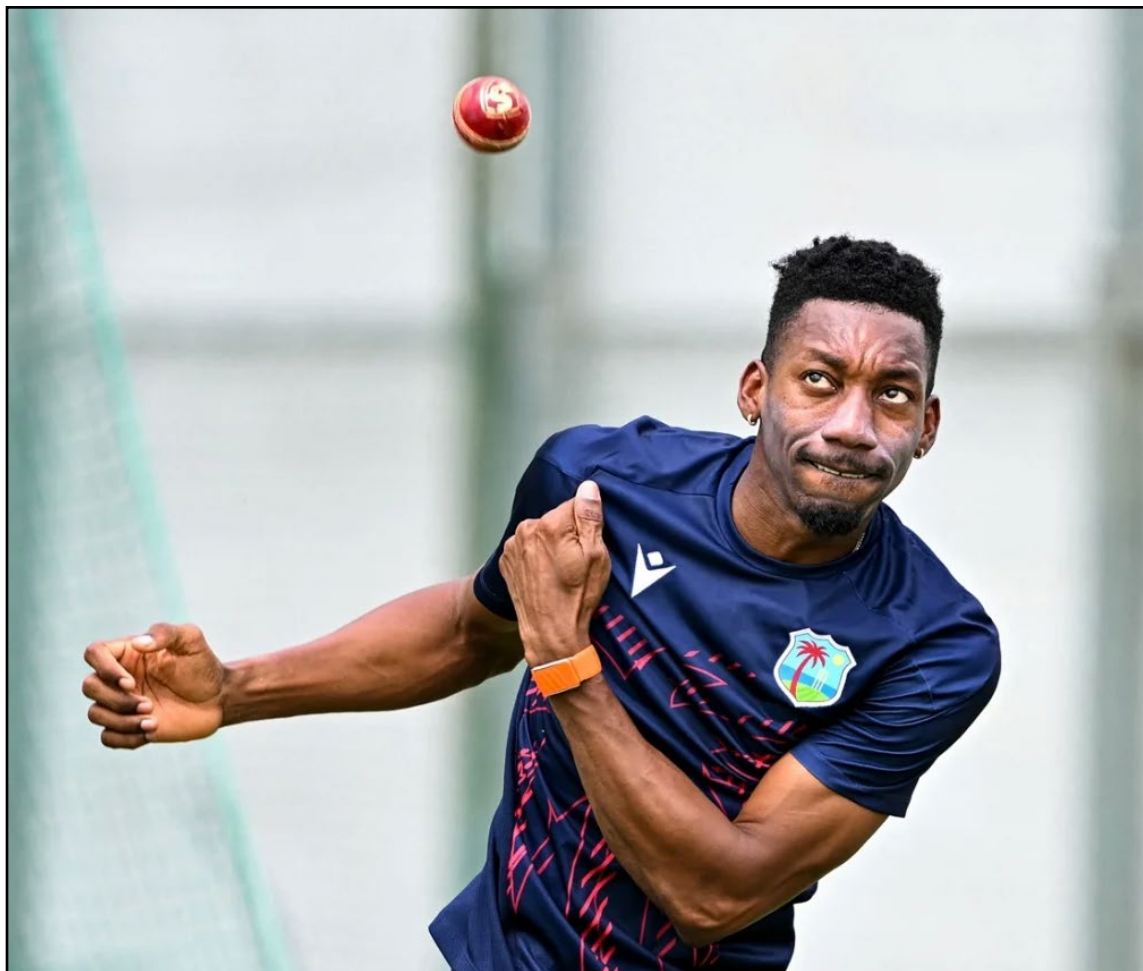
West Indies left-arm spinner Khary Pierre readies himself for a potential Test debut in the first Test against India in Ahmedabad, India, on Wednesday, October 1, 2025.

The tourists are already without injured fast bowlers Shamar Joseph and Al-