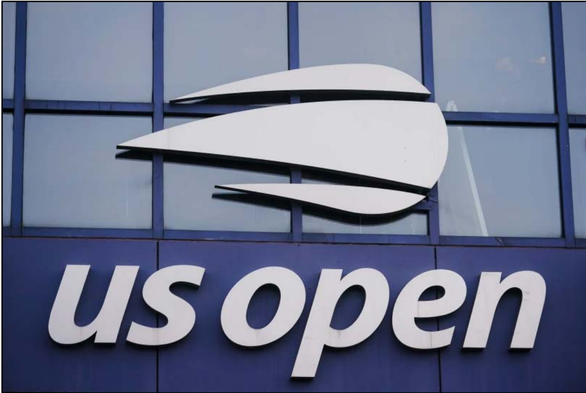
The US Open logo is shown on the Arthur Ashe Stadium, Thursday, Aug. 27, 2020, in New York.

Prize money at the US Open will rise to nearly US$85 million across all competitions this year, including a record US$5 million each to the women's and men's singles champions, and total player compensation is jumping 20 percent to US$90 million, the most in tennis history.