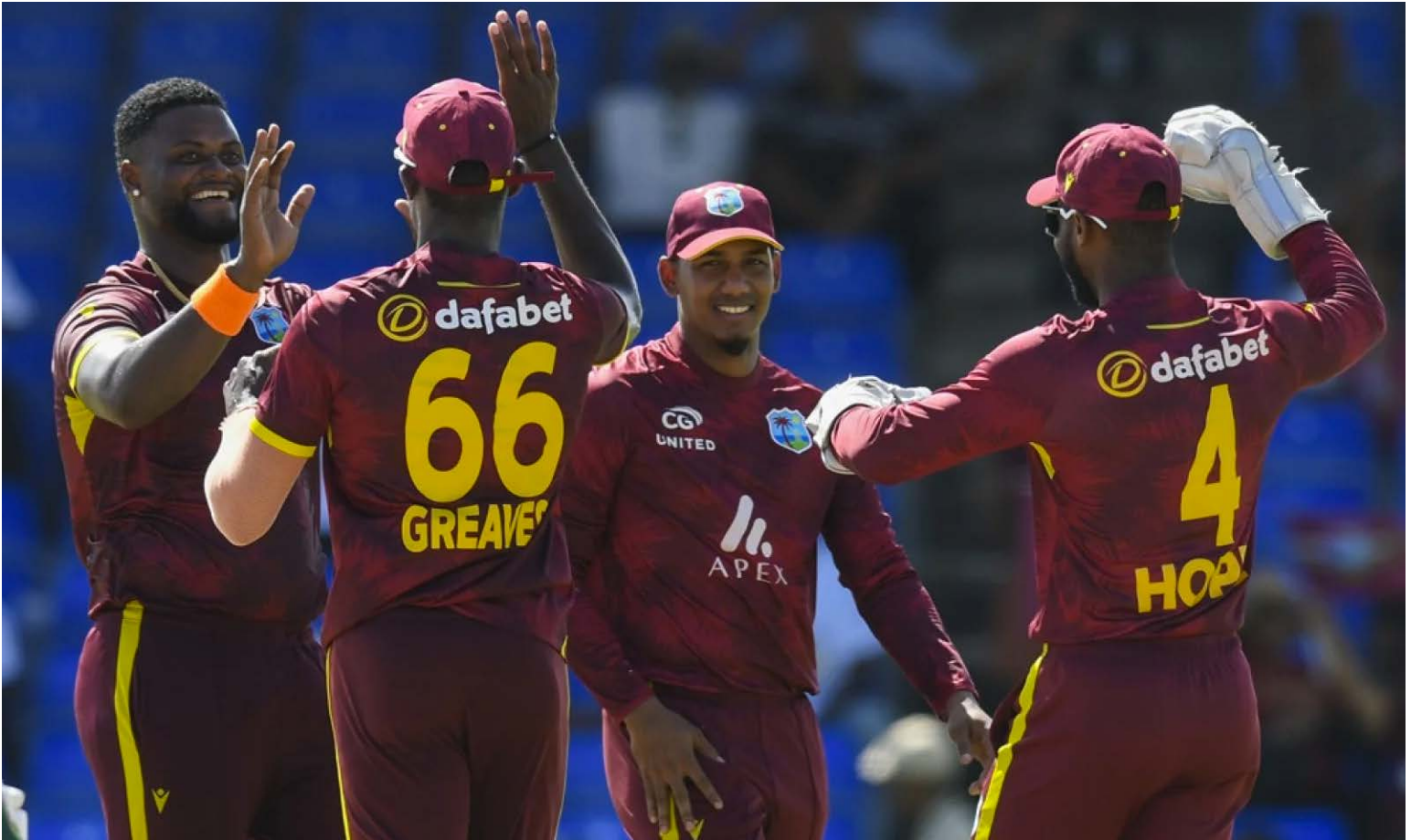
Players of the West Indies senior men's cricket team

Cricket West Indies (CWI) has announced the 15-member squad for the 50-over leg of the white ball home series against Pakistan, set to take place at the iconic Brian Lara Cricket Academy in Tarouba, Trinidad.