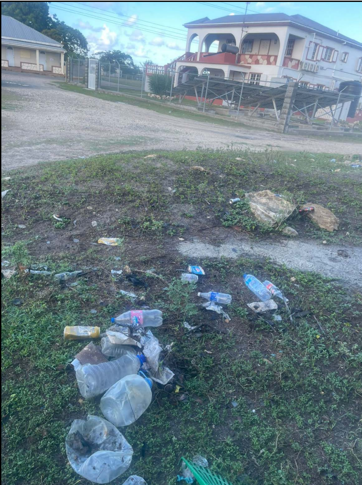
Littering in Barbuda