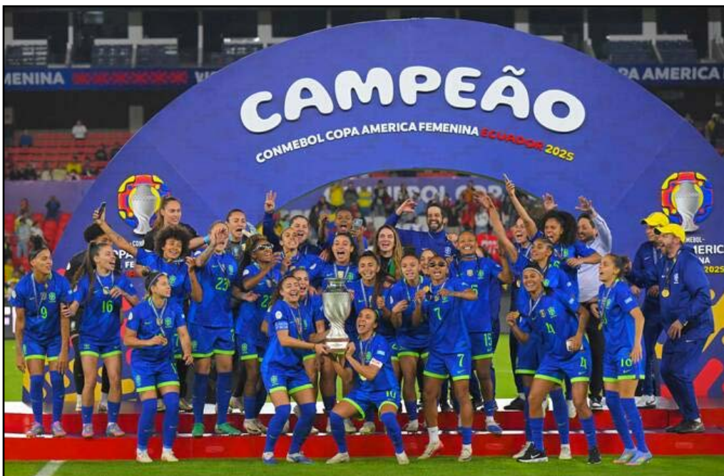
Brazilian players celebrate with the trophy after winning the Women's Copa America final football match between Colombia and Brazil at the Rodrigo Paz Delgado Stadium in Quito, Ecuador, on Saturday, August 2, 2025.

QUITO (Reuters) - The Women's Copa America in Ecuador ended with a thrilling final as Brazil edged Colombia in an eight-goal spectacle to win their ninth title but logistical challenges and half-empty stadiums showed the hurdles that face South American women's football.