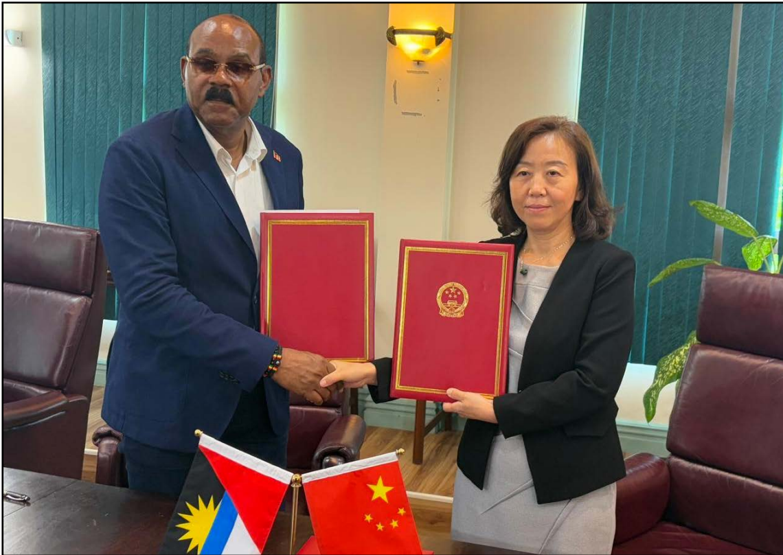
Ambassador Zhang Yanling with Prime Minister Gaston Browne

In Wednesday's edition of Point Express the wrong photo was carried with the article but captioned Ambassador Madame Zhang Yamling for which we profusely apologize. We have therefore reprinted the article with the correct photo of Ambassador Zhang