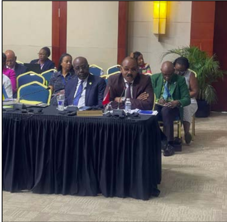
Prime Minister of Antigua and Barbuda, the Hon. Gaston Browne

The CSME, which facilitates the free movement of goods, skills, labour, and services across the region, has recently come under scrutiny. In addition to Prime Minister Browne, both St. Vincent and the Grenadines Prime Minister Dr. Ralph Gonsalves and St. Lucia’s Opposition Leader