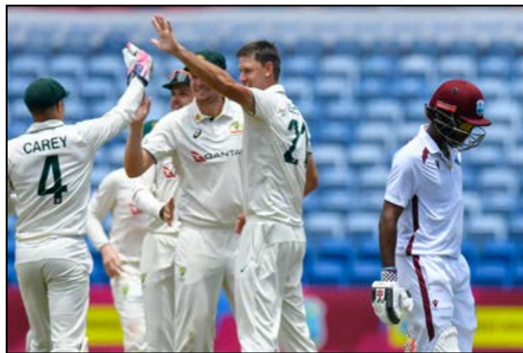
The Australians celebrate the dismissal of West Indies opening batsman Kraigg Brathwaite on the fourth day of the second Test at the National Cricket Stadium in St. George's, Grenada, on Sunday, July 6, 2025.

Mitchell Starc struck a brisk 13 not out from 22 balls, including one boundary, while Josh Hazlewood added four before Alzarri