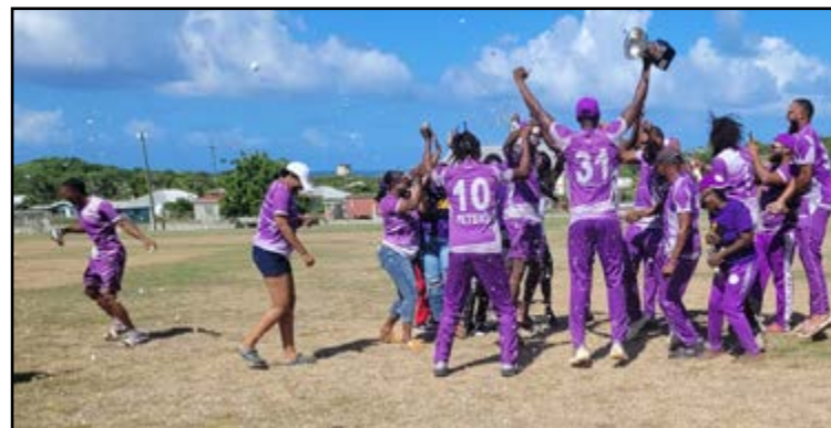
Players of the New Winthorpes Lions celebrate after winning the ABCA Super40 Cup at the New Winthorpes playing field on Sunday, July 6, 2025.

CMW New Winthorpes Lions won their maiden Antigua and Barbuda Cricket Association's (ABCA) Super40 Cup on Sunday.