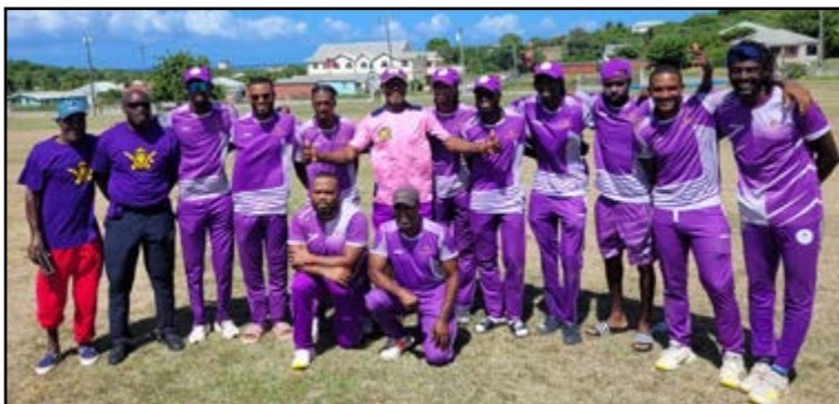
The New Winthorpes Lions team, the new ABCA Super40 Cup Champions.