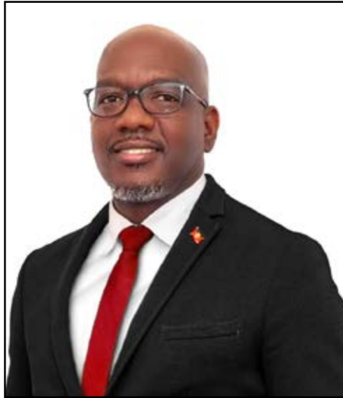
Minister of Creative Industries, Daryll Matthew

"We cannot afford to have broken bottles anywhere on the playing area of the ARG including the pitch area as well as the outfield. Just imagine what would happen if during a practice game, a cricketer is hurt from a