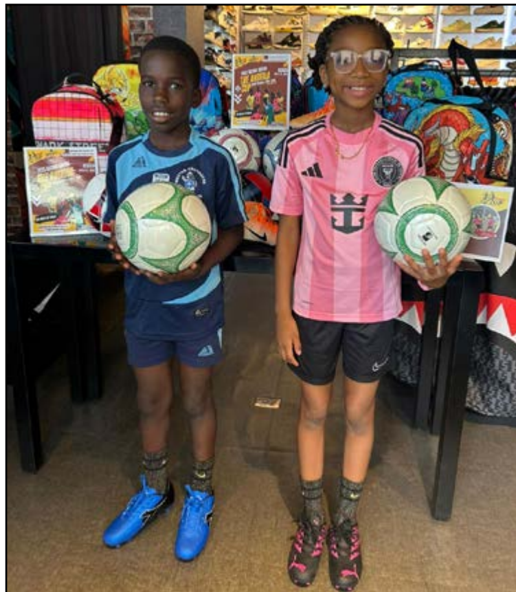
Two Young Warriors players' show-off what's in store for the Antigua Cup participants.

"We recognize that each age group deserves to be celebrated for their effort and dedication. Prizes will be awarded to players in each of the 4 age groups.