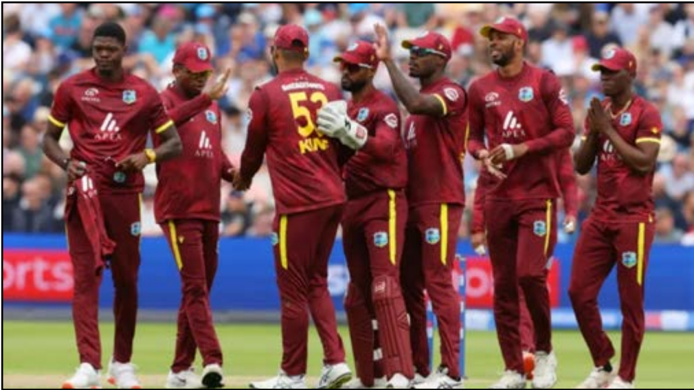
Players of the West Indies ODI team in England in June 2025.

The West Indies have suffered a significant setback on the international stage, falling out of the automatic qualification zone for the 2027 ICC Men's Cricket World Cup in the latest One-Day International (ODI) team rankings released this week.