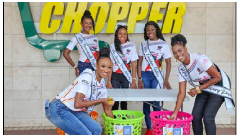
QOC at Price Choppers

The Queen of Carnival 2025 delegates, fondly known as the Celestial Five, embarked on a heartfelt mission last Friday, hosting a community food drive to benefit The Salvation Army Sunshine Home for Girls.