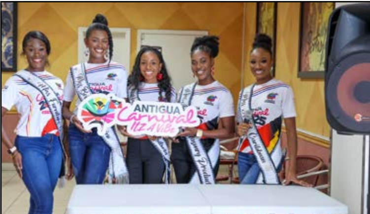
QOC at First Choice