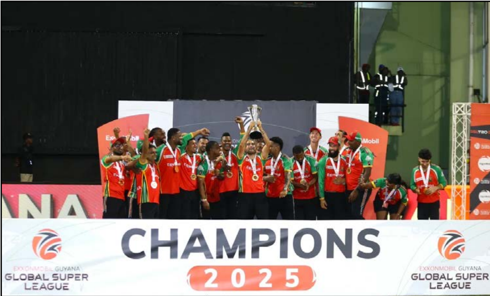
Captain of the Guyana Amazon Warriors Imran Tahir holds the trophy aloft after winning the Guyana Super League T20 title at the National Stadium in Providence, Guyana, on Friday, July 18, 2025.

The Guyana Cricket Board (GCB) has responded strongly to recent remarks made by APNU Presidential Candidate Aubrey Norton regarding the possible scrapping of the Global Super League (GSL) T20 tournament if his party assumes office following the upcoming elections.