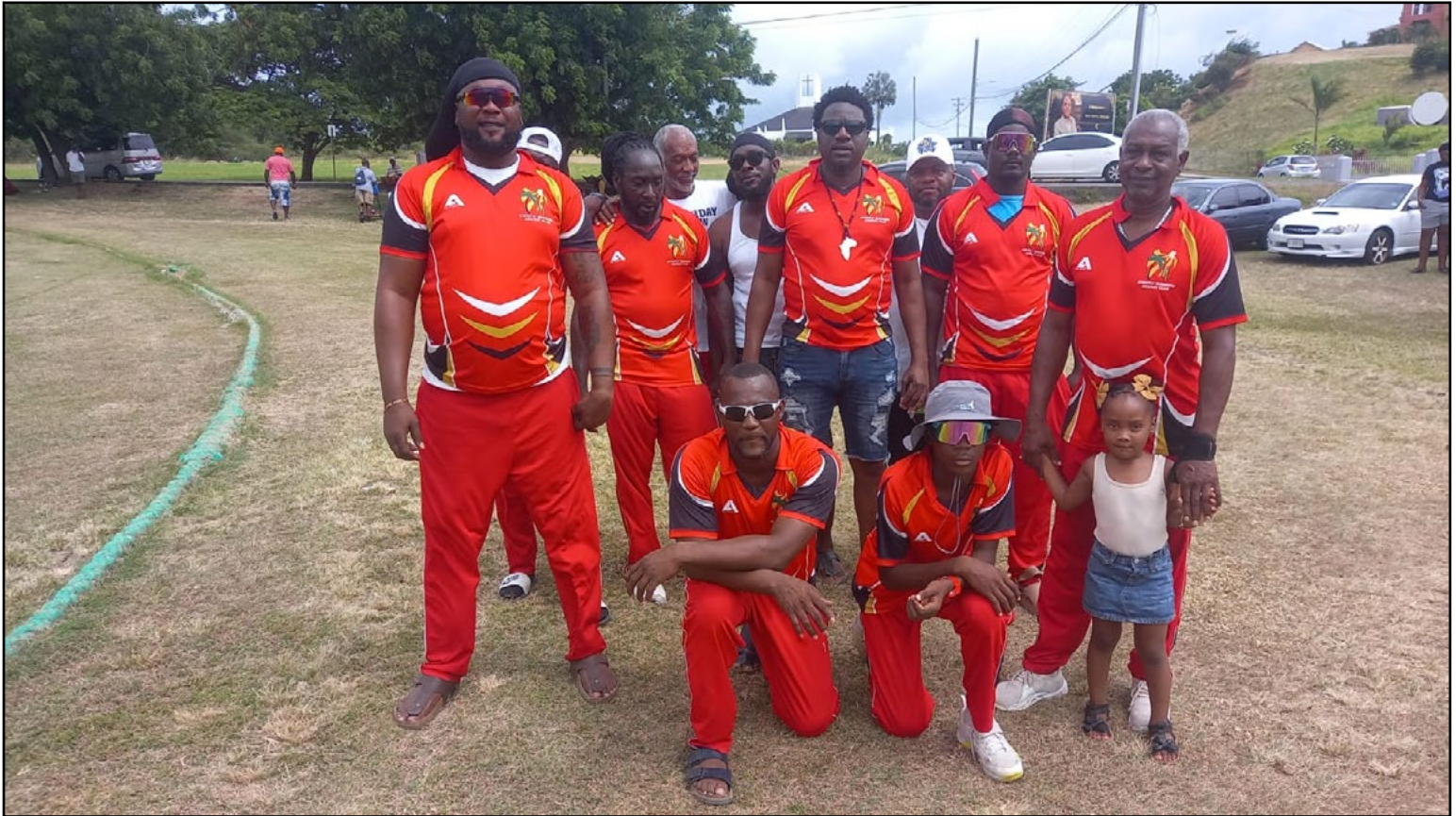
The Rackaman Construction Strictly Business men's softball cricket team.

Rackaman Construction Strictly Business have continued to enjoy success in the Antigua and Barbuda Softball Cricket Association's (ABSCA) Men's T20 Competition.