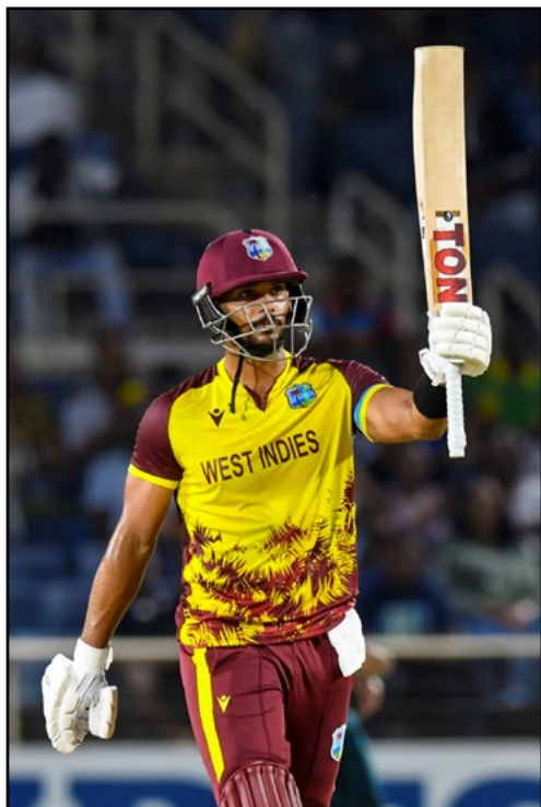
West Indies opener Brandon King celebrates his fifty against Australia during the second T20 International at Sabina Park in Jamaica on Tuesday, July 22, 2025.

Australia's Cameron Green and Josh Inglis plundered unbeaten half-centuries as Andre Russell's farewell match ended in defeat for West Indies at Sabina Park in Jamaica on Tuesday night.