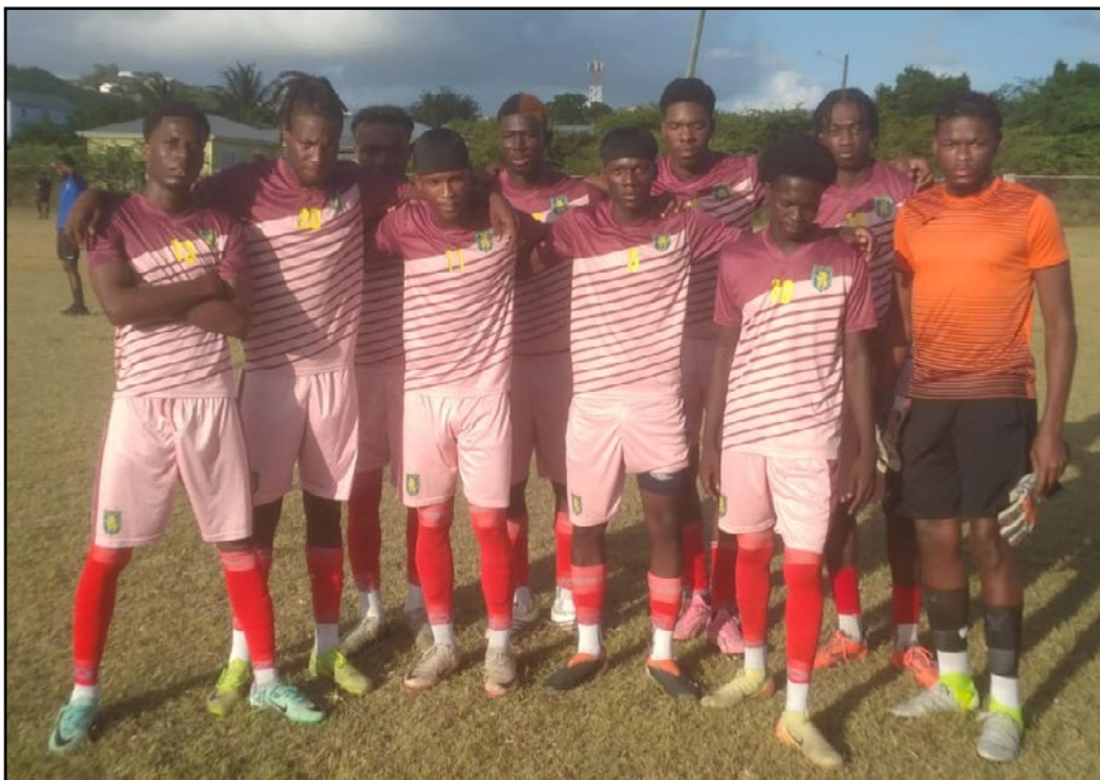
Players of the Villa Lions football team.

The Villa Lions extended their unbeaten run to advance to the final of the Fort Road Community Football League on Tuesday.