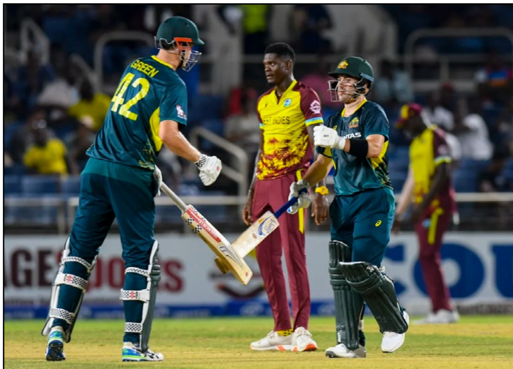
Australia's Cameron Green, left and Josh Inglis put up a big stand against the West Indies during the second T20 International at Sabina Park in Jamaica on Tuesday, July 22, 2025.

West Indies had put on a respectable 172 for eight across their innings of 20 overs.