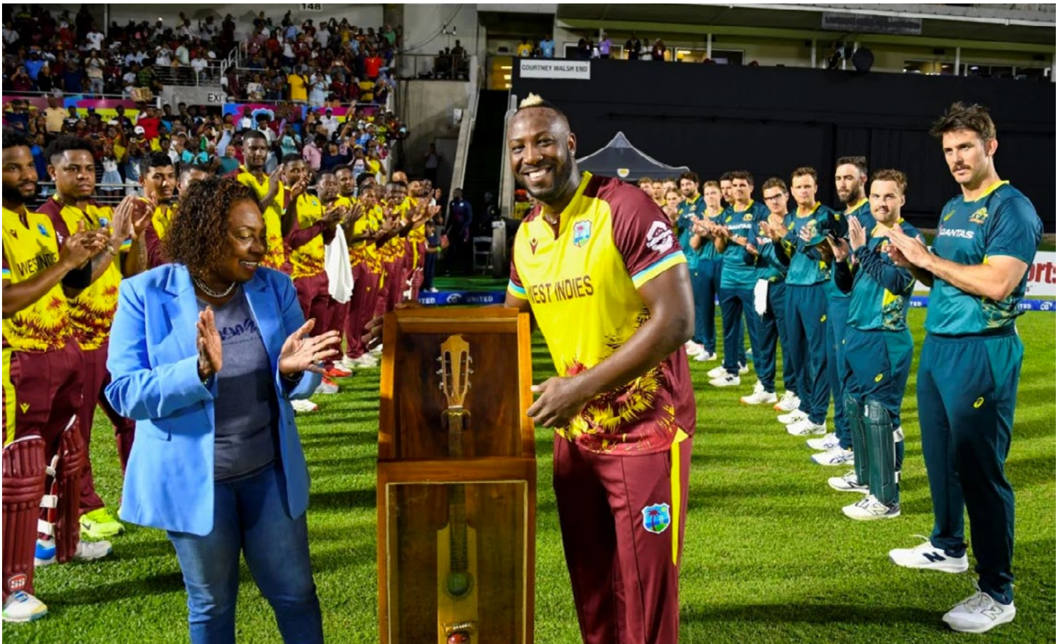
Andre Russell receives a special present in his final game for the West Indies during the second T20I against Australia at Sabina Park in Jamaica on Tuesday, July 22, 2025.

There was no fairy-tale ending for Andre Russell, but there was love — and plenty of it — as the West Indies all-rounder brought the curtain down on a glittering international career at Sabina Park on Tuesday night.