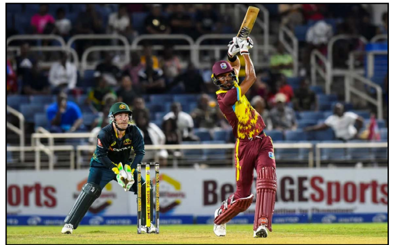
West Indies Roston Chase launches down the ground during the first T20 International against Australia at Sabina Park in Jamaica on Sunday, July 21, 2025.

er's first scoring shot was a six straight down the ground against Andre Russell in a contest between a player on international debut against a veteran playing his next-to-last game. He also clouted the last ball of that over for six.