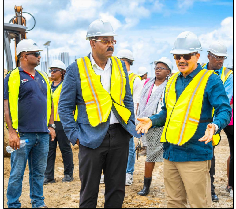
Antigua Cruise Port – Tourism Minister Fernandez expresses delight with Upland Development

Antigua Cruise Port (ACP) provided a high-level government delegation including Prime Minister the Hon. Gaston Browne and Minister of Tourism the Hon. Charles Fernandez, to the Upland Development site where construction is underway at Lower Newgate Street.