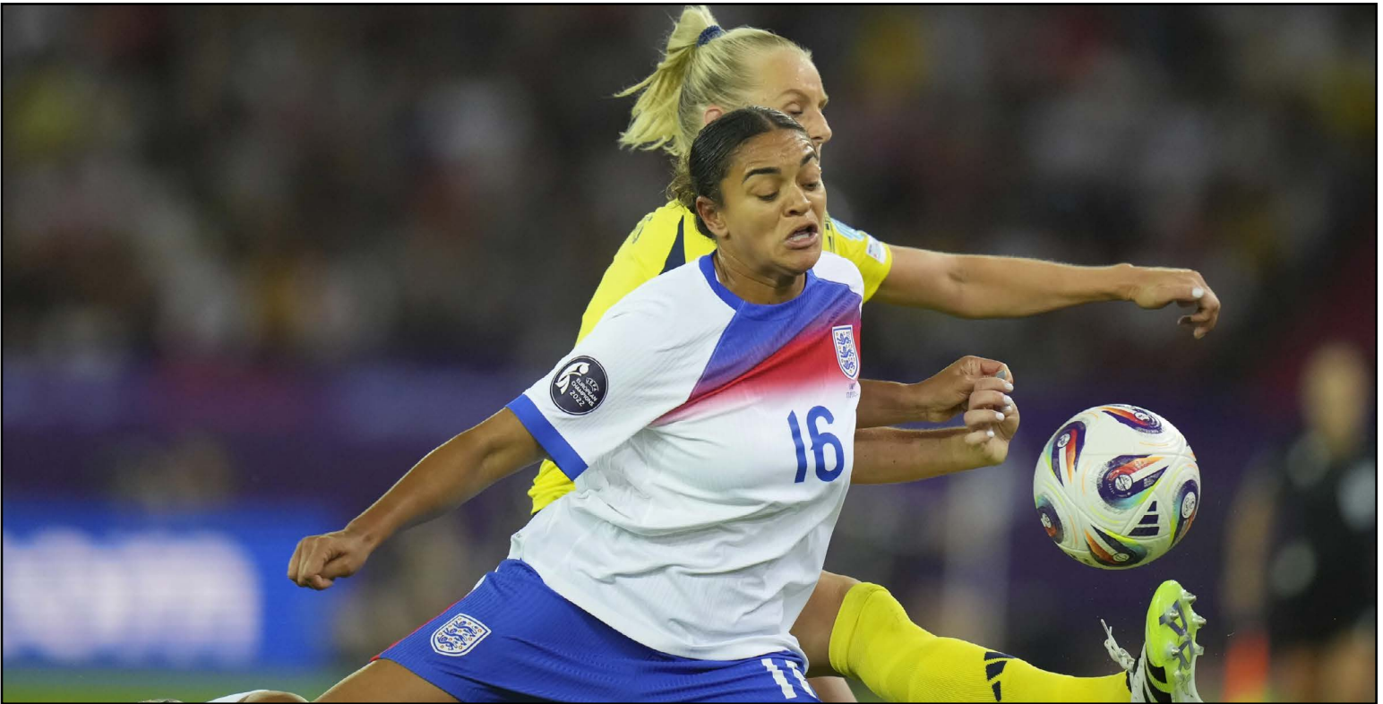
England's Jess Carter vies for the ball with Sweden's Stina Blackstenius, background, during the Women's Euro 2025 quarterfinals soccer match between Sweden and England at Stadion Letzigrund in Zurich, Switzerland, Thursday, July 17, 2025.

ZURICH (Reuters) - FIFA President Gianni Infantino offered the governing body's support to England defender Jess Carter after she revealed she has been the target of racist abuse during Euro 2025.