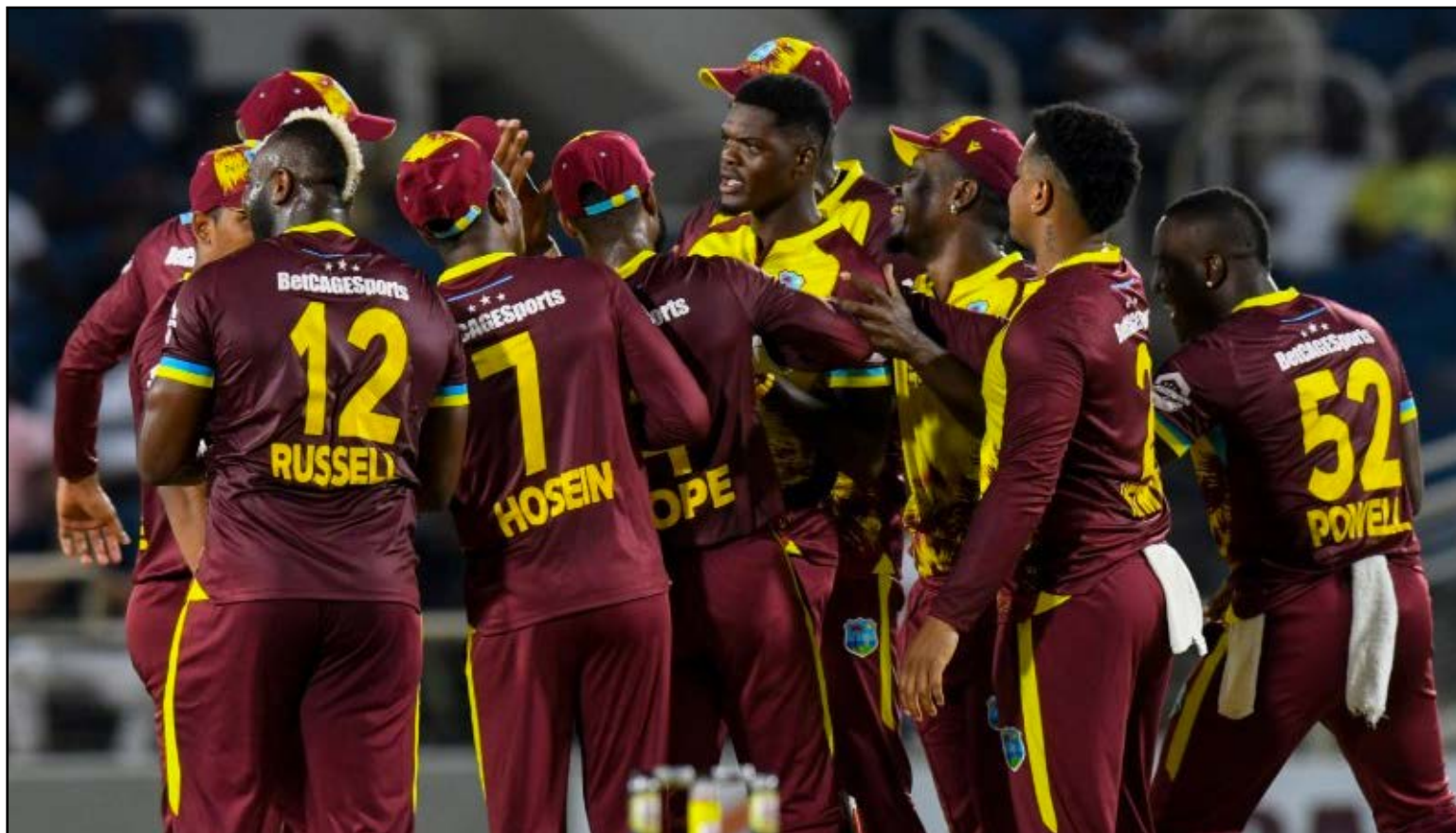
Players of the West Indies team celebrate after a dismissal during the first T20 International against Australia at Sabina Park in Jamaica on Sunday, July 20, 2025.

Cricket West Indies (CWI) is urging all fans attending Tuesday's second T20 International (T20I) between West Indies and Australia at Sabina Park to arrive early to avoid delays and ensure a smooth entry experience.