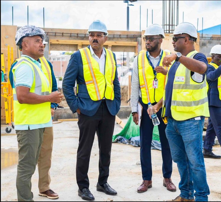
Antigua Cruise Port – Prime Minister Gaston Browne, on-site briefing as new terminal takes shape