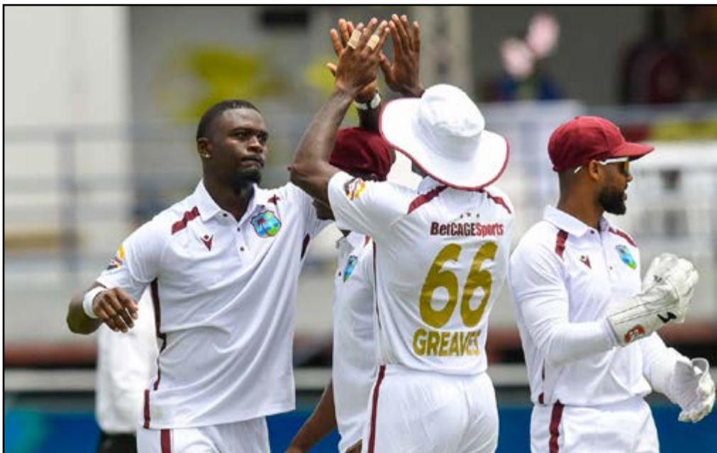
West Indies fast bowler Jayden Seales, left, celebrates with his teammate after capturing a wicket against Australia on the opening day of the first cricket Test at the Kensington Oval in Bridgetown, Barbados, on Wednesday, June 25, 2025.