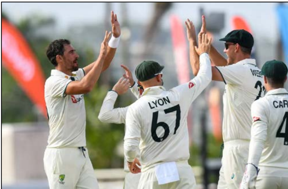
Fast bowler Mitchell Starc, left, celebrates with teammate after capturing a wicket against Australia on the opening day of the first cricket Test at the Kensington Oval in Bridgetown, Barbados, on Wednesday, June 25, 2025.

West Indies fast bowler Shamar Joseph continued where he left off at the Gabba last year before Australia's pace cartel launched a late fightback on day one for the Frank Worrell Trophy Test-series opener in Barbados on Wednesday.