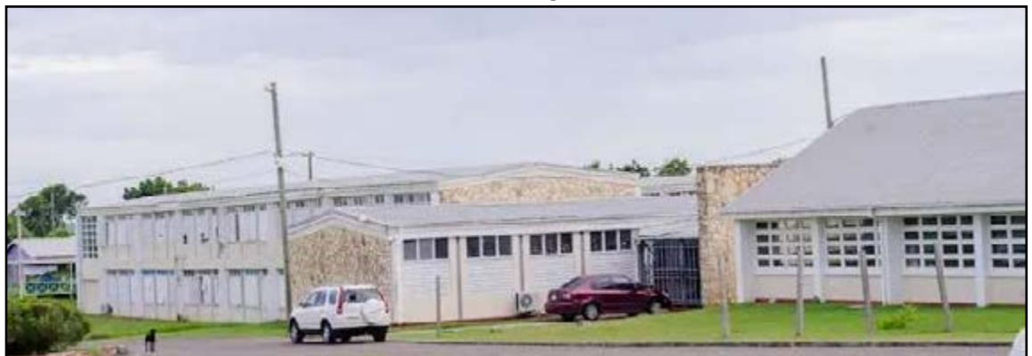
Pares Secondary School (PSS),

The schools, which are only 2.5 miles apart, share similar curricula and serve overlapping communities (feeder schools are the same).