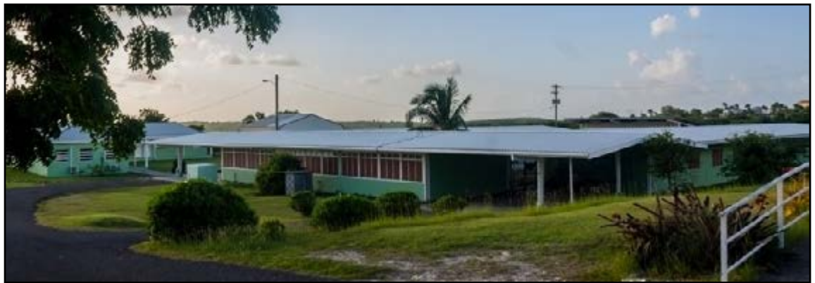
Glanvilles Secondary School (GSS)

Should the recommendation be accepted by the Cabinet of Antigua and Barbuda,