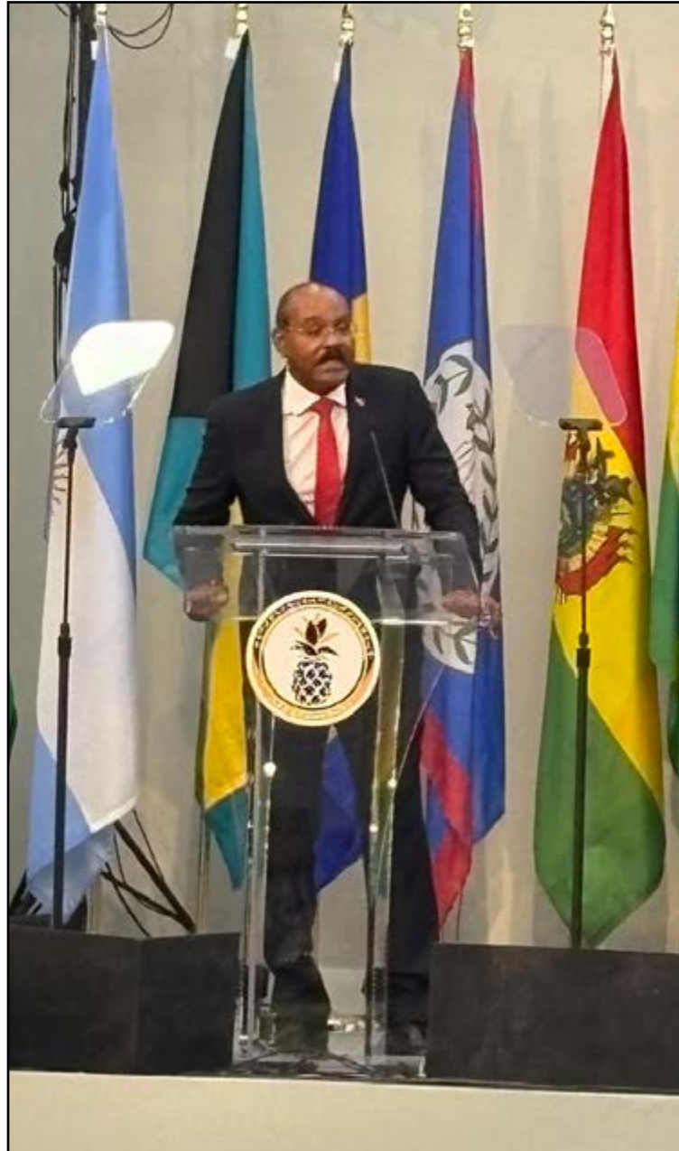
Prime Minister Gaston Browne of Antigua and Barbuda

With rising tensions in the global order, Prime Minister Browne stressed the importance of international cooperation, not rivalry. He urged large economies to work in partnership with Latin America and the Caribbean to drive inclusive trade, technology transfer, and infrastructure development—rejecting zero-sum approaches that treat the hemisphere as a battle-