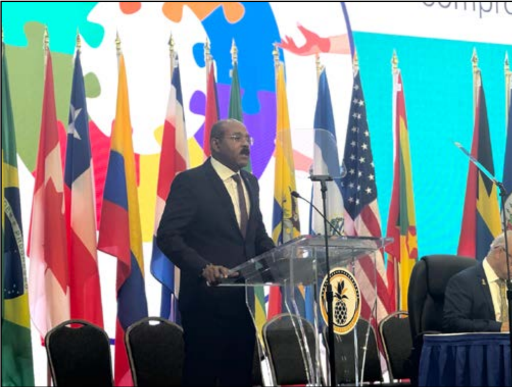
Honourable Gaston Browne Prime Minister of Antigua and Barbuda

In a bold and deeply personal address at the side event “Uniting the Americas for Mental Health: From Commitment to Action” , Prime Minister the Honourable Gaston Browne of Antigua and Barbuda issued a compelling call to leaders across the Western Hemisphere to treat mental health as a top development and public health priority.