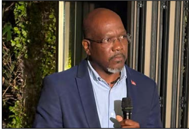
Education Minister Daryll Mathew

Currently, both schools serve a total population of 341 students, a figure significantly below their combined capacity, yet will still be considered a small school. The Glanvilles Secondary School has a population of 163 (total capacity 250) and the Pares Secondary School has a population of 178 (total capacity 550).