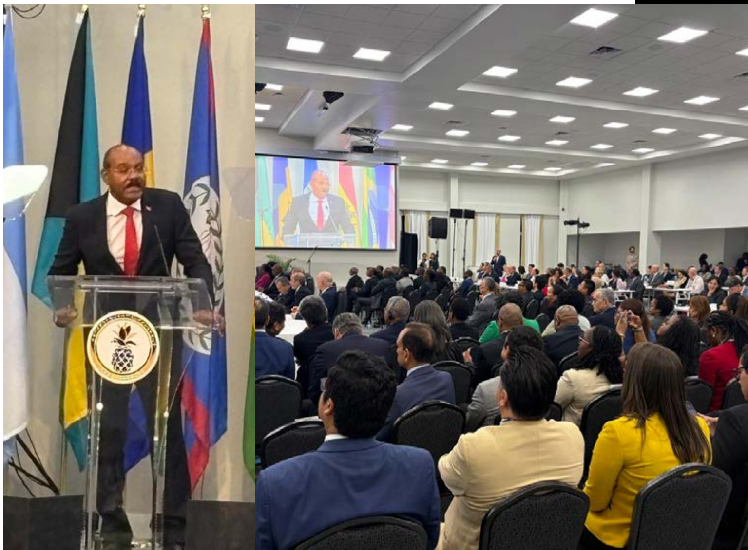
Prime Minister Gaston Browne delivering the feature address at the formal opening ceremony for the 55th Regular Session of the OAS at the AUA Conference Centre on Wednesday night to an attentive audience.