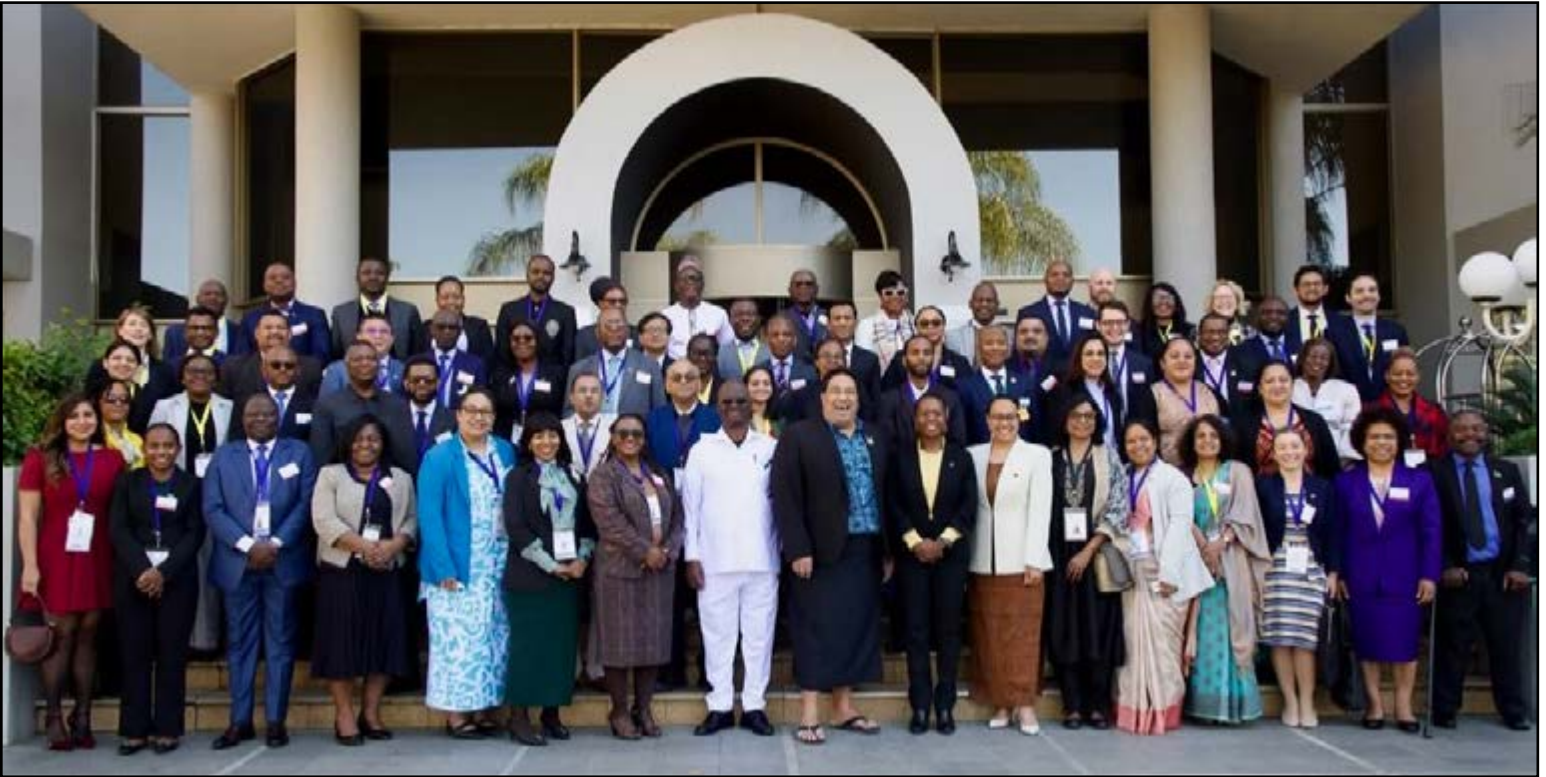
Delegates at CTMM in Namibia pose for group photo

Antigua and Barbuda was among country which participated in the Second Commonwealth Senior Trade Officials Meeting (STOM II) and the Commonwealth Trade Ministers Meeting (CTMM), which took place from June 16th to 20th, 2025, in Windhoek, Namibia.