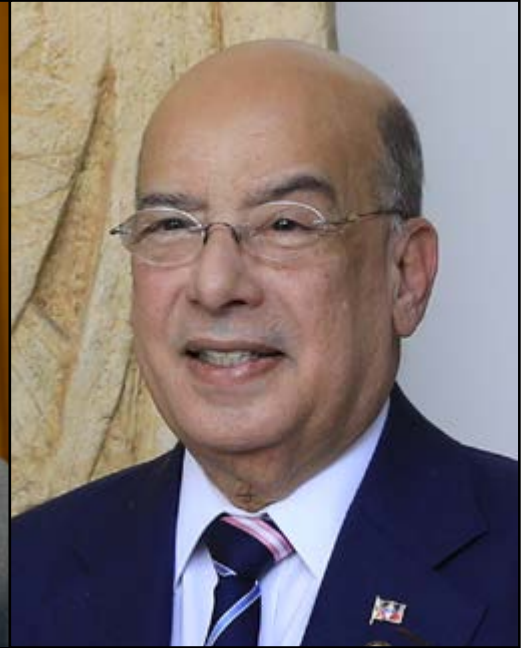
Prime Minister Gaston Browne, OAS, Albert Ramdin and Ambassador to the OAS, Sir Ronald Sanders

All systems are go for Antigua and Barbuda to create history by becoming the smallest country to host the regular session of the Organisation of American States (OAS) General Assembly. It's the 55 th Session of the GA and while other Caribbean states have served as host in the past, Antigua and Barbuda is the smallest to do so.