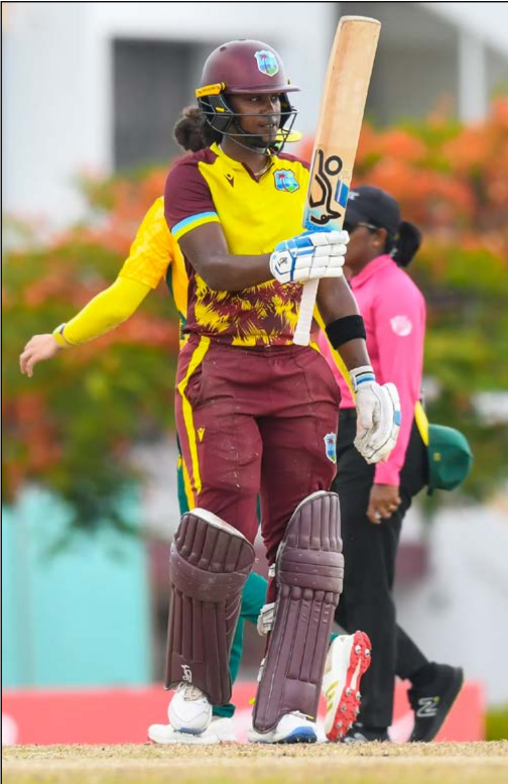
West Indies women's captain Hayley Matthews

The West Indies Women have made notable gains in the latest ICC Women's Rankings following their recent T20I and ODI series against South Africa, while South Africa opener