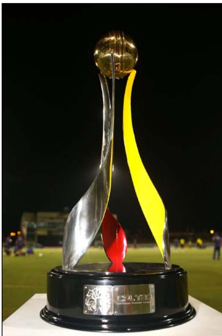
The Caribbean Premier League trophy

Fans can follow the tour in real-time on social media using the hashtags #CPL25 and #CPLTro-