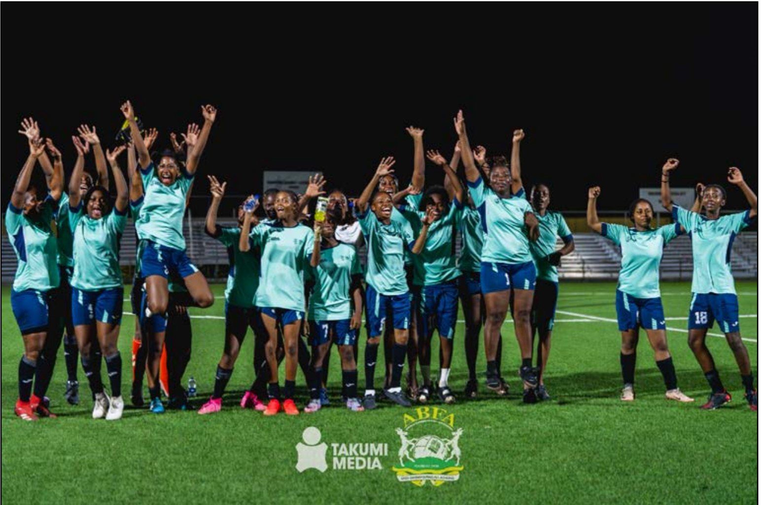
Players of the Empire Trendsetters celebrate after winning the first ABFA's Women's Knockout Classic at the ABFA Technical Center at Paynters on Sunday, June 22, 2025.

Empire Trendsetters won the first in a series of three women's knockout classic competitions, which are organized by the Antigua and Barbuda Football Association (ABFA), on Sunday evening.