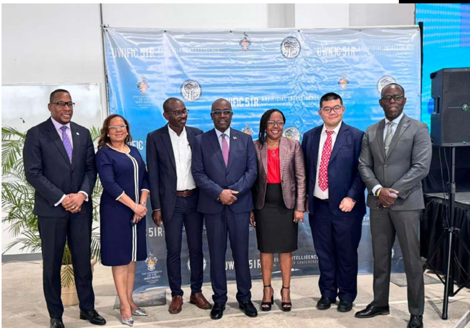
Representatives from government, UWI FIC, the ECCB, CARICOM, CAF and academia attended the opening of the 2nd AI conference