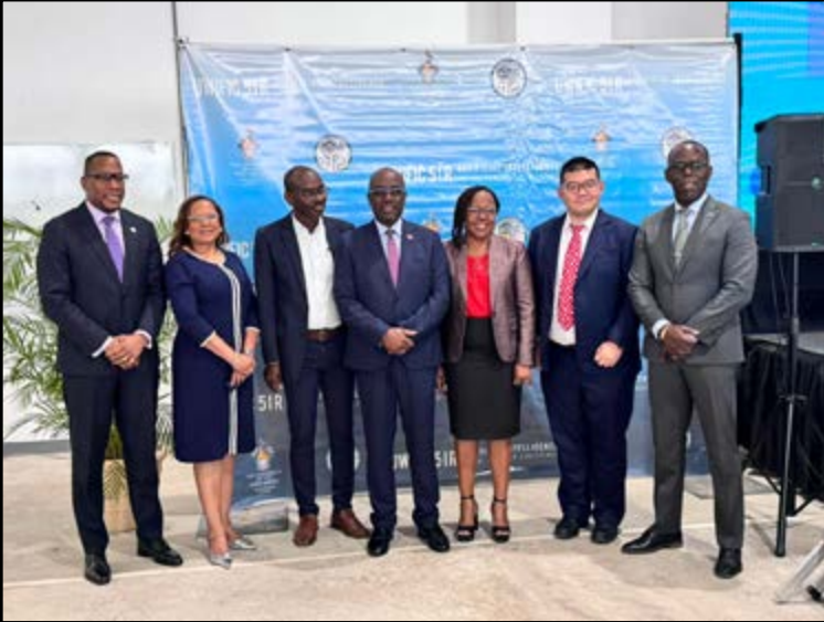
Representatives from government, UWI FIC, the ECCB, CARICOM, CAF and academia attended the opening of the 2nd AI conference