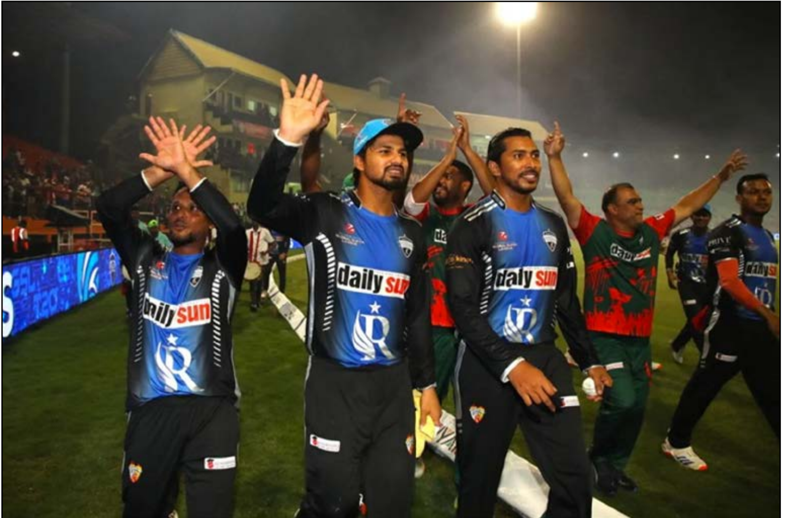
Players of the Rangpur Riders

The defending champions, Rangpur Riders, have confirmed a powerful 16-man squad for the 2025 Exxon-Mobil Guyana Global Super League (GSL), which will be staged at the Guyana National Stadium in Providence from July 10 to 18.