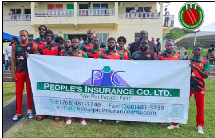
2024 ABCA Super40 Cup champions PIC Insurance Liberta Blackhawks

In reply, the Pigotts Crushers were dismissed for 201 in 35.4 overs. Amahl Nathaniel cracked 53 off 58 balls, including four fours and a six. Jewel Andrew hit 52 off 27 balls, including six fours and three sixes, and Joshua Grant scored 39 off 55 balls.