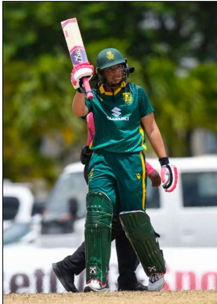
South Africa's Sune Luus celebrates after reaching a half century against the West Indies women during the second ODI at the 3Ws Oval in Cave Hill, Barbados on Saturday, June 14, 2025.

The West Indies then made a decent effort of the chase but lost wickets at crucial