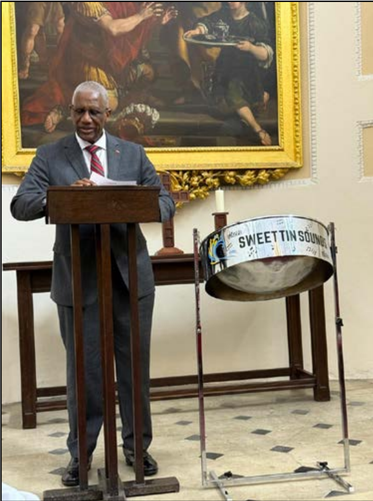
His Excellency Sir Rodney Williams reads the message from His Majesty King Charles III during the Thanksgiving Service held at All Hallows-on-the-Wall.

Governor General, Sir Rodney Williams, played a role in creation history when he participated in a first-of-its-kind event making the official recognition of the vital contributions of Caribbean servicemen and women to the British Armed Forces.