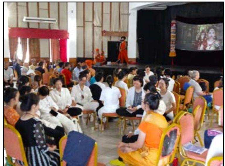
Section of the UAIEN meeting taking place at the MultiPurpose Cultural Centre in St. John's

nificance, not only for you personally but for the wider community of faith leaders and peacebuilders who gathered for the special occasion.