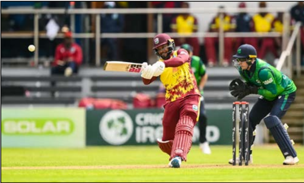
West Indies captain Shai Hope bats against Ireland during the third T20 International in Bready, Ireland, on Sunday, June 15, 2025.

Evin Lewis turned back the clock with a blistering 91 off 44 balls to lead the West Indies to a resounding 62-run win over Ireland in the third and final T20 International at Bready Cricket Club on Sunday, clinching the three-match series 1-0 after the first two games were abandoned due to rain.