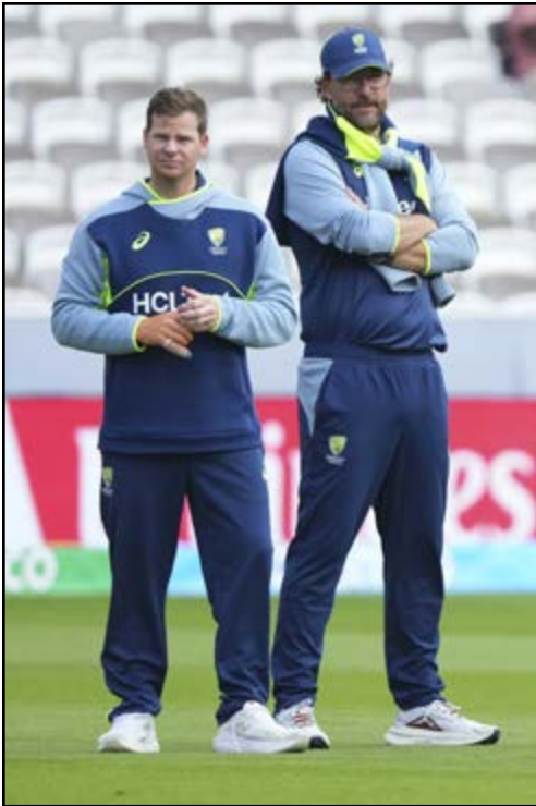
Australia's Steve Smith, left, and bowling coach Daniel Vettori watch players warm up before the start of play on day four of the World Test Championship final between South Africa and Australia at Lord's cricket ground in London, Saturday, June 14, 2025.

LONDON — Star batter Steve Smith and his dislocated finger are going with Australia to the Caribbean.