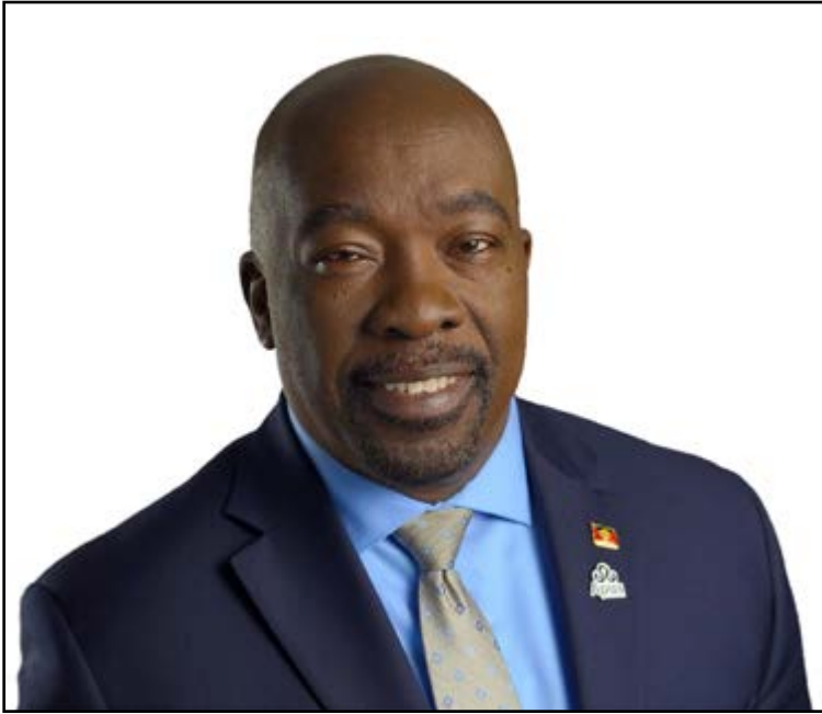
Utilities Minister Melford Nicholas,

The milestone achievement of reaching a daily output of 9 million imperial gallons of water by APUA was not an accident.