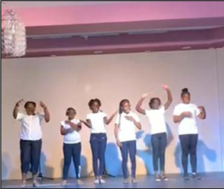
Students showing off their talents in Victory School's Talent Show.

The Victory Center, a school for children with different needs, came alive on Thursday, June 12, as students, families, and staff gathered for the school's annual Talent Show. The event, held at People's Place, showcased the students' remarkable creativity and confidence and was a vibrant celebration of the end of the school year.