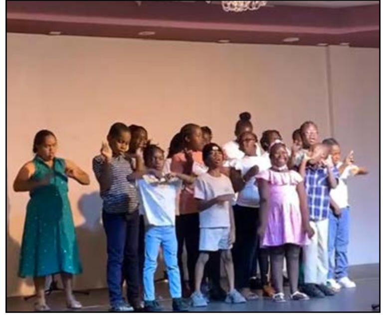
Fun for all at Victory School's Talent Show

The performances were met with enthusiastic applause and cheers, reflecting the supportive spirit of the Victory Center community. The event closed with a special presentation of end-of-year