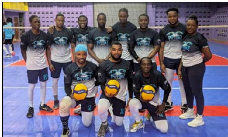
2025 Men's Division 1 champions Pytonz

Both men's and women's Division 1 competitions of the Antigua and Barbuda Amateur Volleyball Association's (ABAVA) Local Club League came to an end at the indoor stadium at the YMCA Sports Complex on Saturday evening.