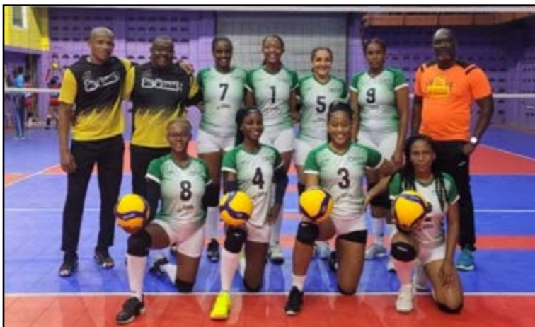
2025 Women's Division 1 champions Da Squad