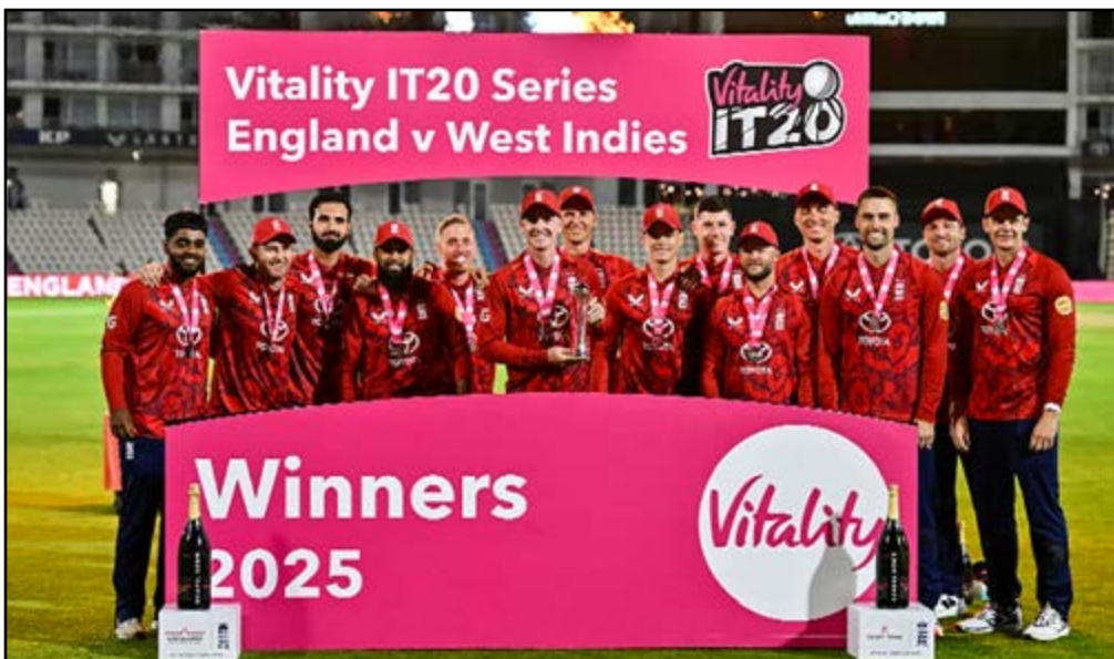
England celebrate with the trophy after sweeping the West Indies during their third T20 International at the Rose Bowl in Southampton, England, on Tuesday, June 10, 2025.

The West Indies showed fight with the bat but it ultimately wasn't enough as England secured a 3-0 T20 International series sweep with a 37-run win in the third match at The Rose Bowl in Southampton on Tuesday.