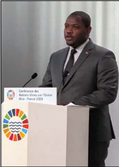
Minister of Agriculture, Fisheries, Lands and the Blue Economy Anthony Smith

Minister of Agriculture, Fisheries, Lands and the Blue Economy Anthony Smith Jr. delivered a compelling national statement at the UN Ocean Conference 2025, emphasizing the urgent need for collective action to safeguard the world's oceans, especially for Small Island Developing States (SIDS).