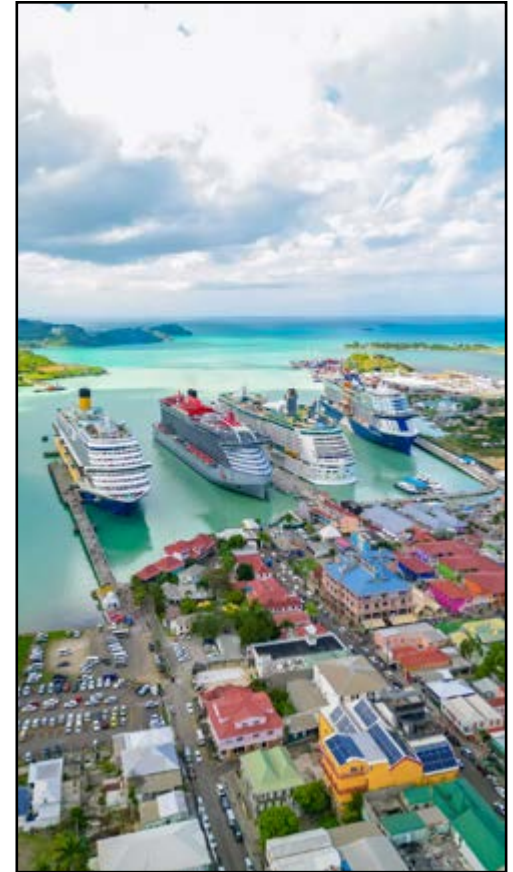
Antigua Cruise Port - St John's Drone View

According to ACP these measures are designed to maintain Antigua and Barbuda's reputation as a premier cruise destination, ensuring a safe, comfortable and welcoming atmosphere for everyone.