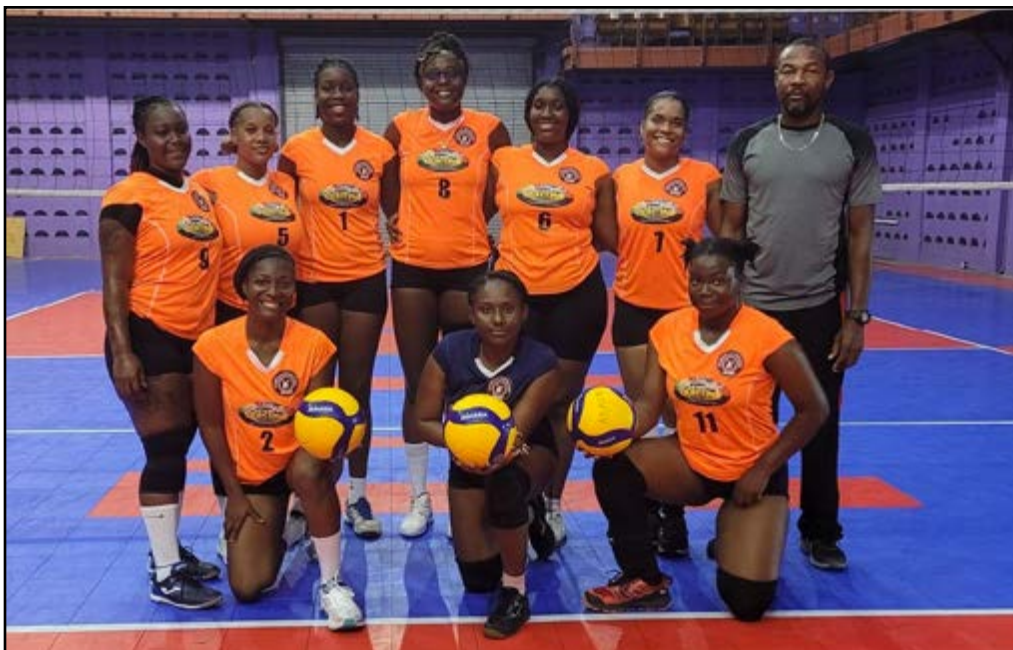
Theatric Lighting and Stage Effects and JOMA Caribbean Stoneville women's volleyball team.

Theatric Lighting and Stage Effects and JOMA Caribbean Stoneville clinched third place in the Women's Division 1 competition of the Antigua and Barbuda Amateur Volleyball Association's (ABAVA) Local Club League on Tuesday evening.