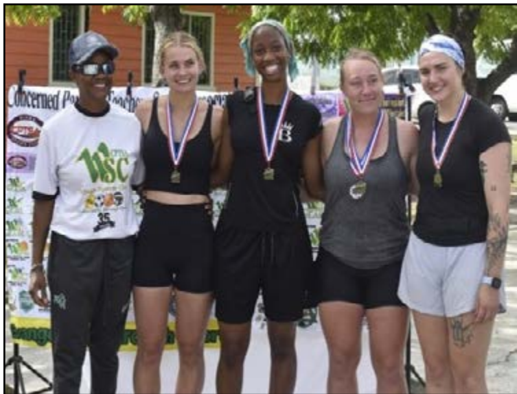
Sea Dawgs relay team

Members of the Hurricane Power Athletic Club dominated the 31st Annual CPTSA Wings Whit Monday 4x1.5 Miles Road Relay and 10K & Fitness Walk on June 9.