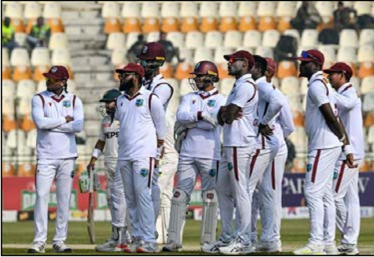
Players of the West Indies team.