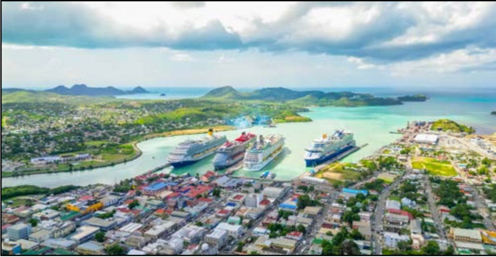
Antigua Cruise Port - St John's Drone View

Antigua Cruise Port (ACP) has signaled its intention to enforce parking, vending and solicitation operations in key parts of the City of St. John's, especially on days when cruise ships are in port.