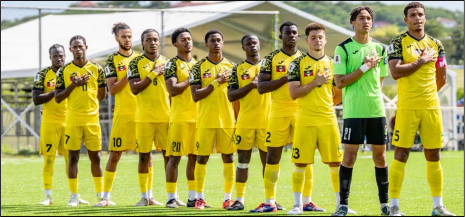
The Antigua Benna Boys starting team during their 2026 FIFA World Cup CONCACAF Group A Qualifier against Cuba at the ABFA Technical Center on Friday, June 6, 2025.

Antigua and Barbuda will be playing for pride in their final outing in the CONCACAF (Confederation of North, Central America, and Caribbean Association Football) Region of their campaign in the second round of qualifying matches for the 2026 FIFA World Cup Finals.