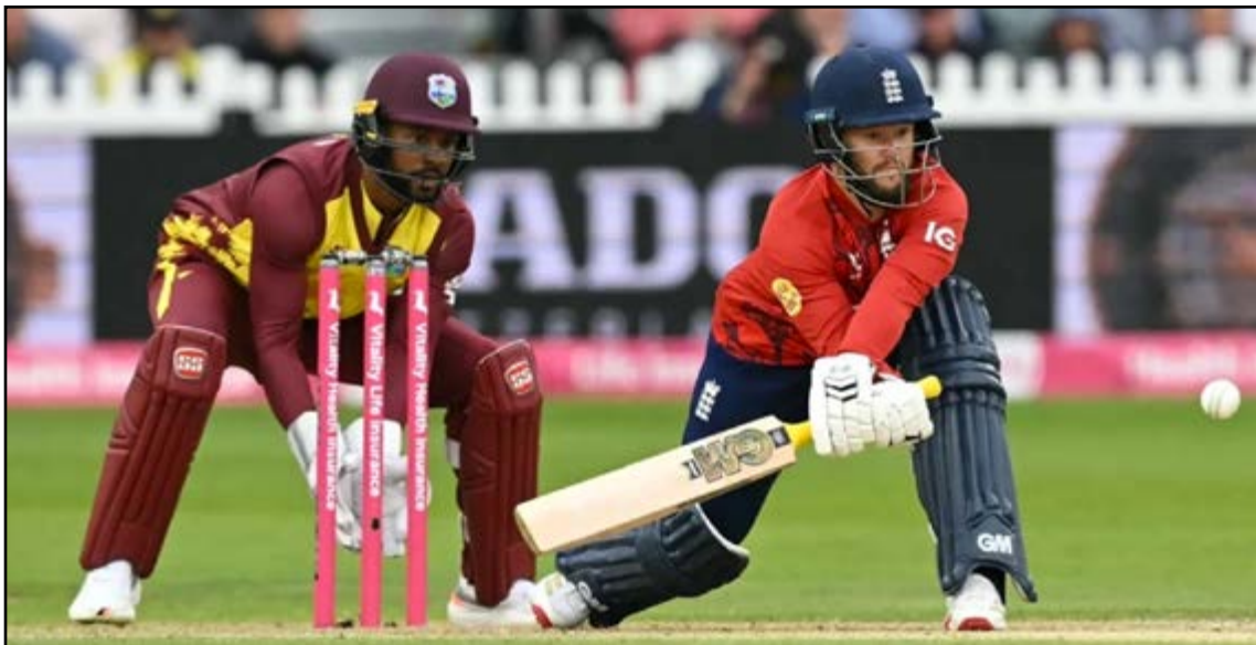
England's Ben Duckett, right, plays a reverse sweep during the second T20I against the West Indies in Durham, England, on Sunday, June 8, 2025.

England weathered a brutal late assault from the West Indies to clinch a four-wicket win in the second T20 International in Durham on Sunday, securing an unassailable 2-0 lead in the three-match series.