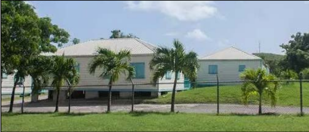
St. Andrews Primary school,