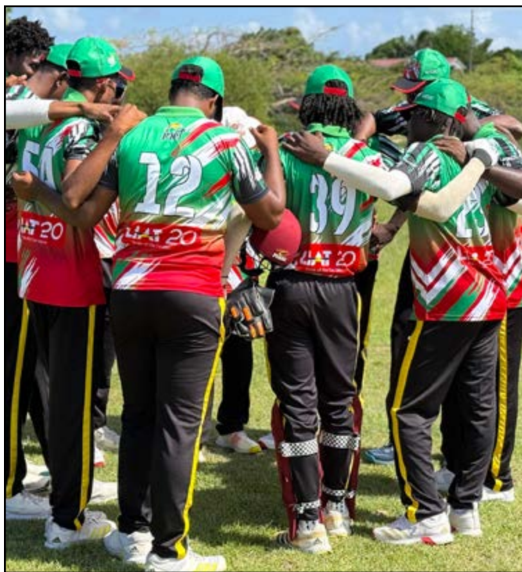
Players of the Nevis team in a huddle before taking the field during their match against Combined Islands in the LICB T20 Festival at Pigotts in Antigua on Tuesday, June 3, 2025.

The Combined Islands pulled off a four-wicket victory against bottom team St. Kitts at the Sir Vivian Richards Stadium.