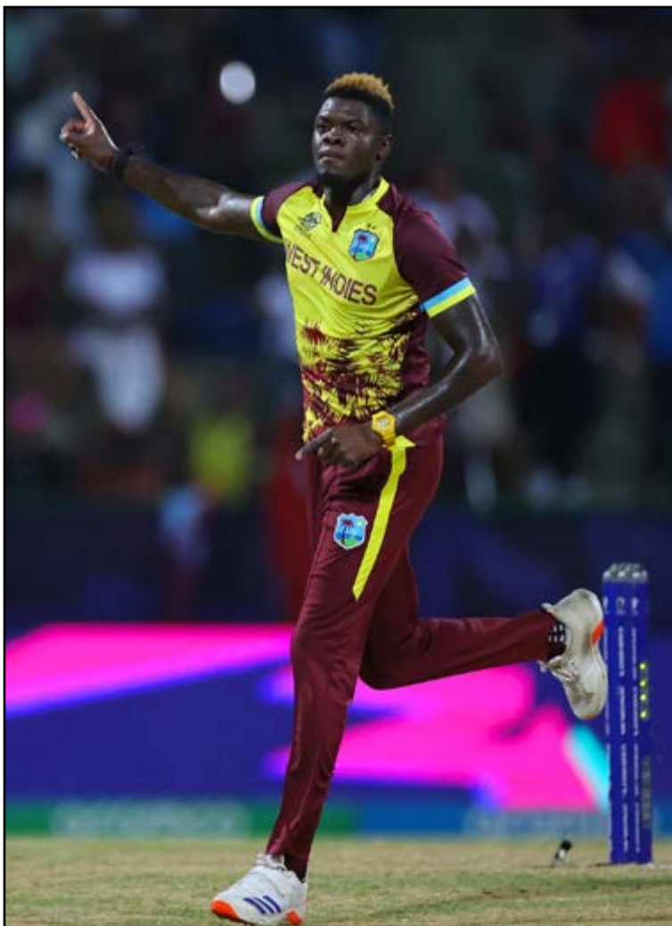
Antiguan fast bowler Alzarri Joseph

West Indies women's captain Hayley Matthews and seamer Alzarri Joseph feature prominently on the shortlists as Cricket West Indies (CWI) and the West Indies Players' Association (WIPA) revealed nominees for the eighth CWI/WIPA Awards Gala, scheduled for June 22, at the Wyndham Grand Barbados Sam Lord's Castle.