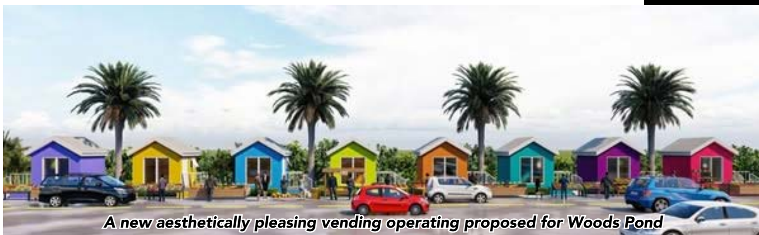
A new aesthetically pleasing vending operating proposed for Woods Pond