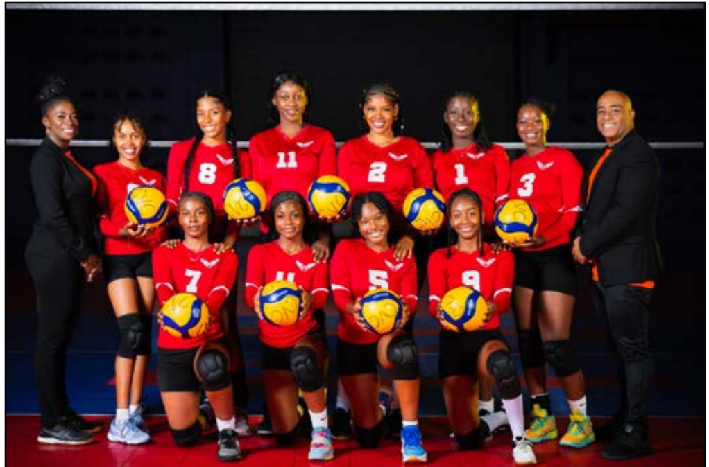
The City South Municipal Foundation Inc., Townhouse Furnishings, CIU, and MKUU Tours, Chargers Eagles 1 women's volleyball team.

It means Royal Cruisers 2 remain second from the bottom of the standings after suffering their sixth loss in seven encounters.