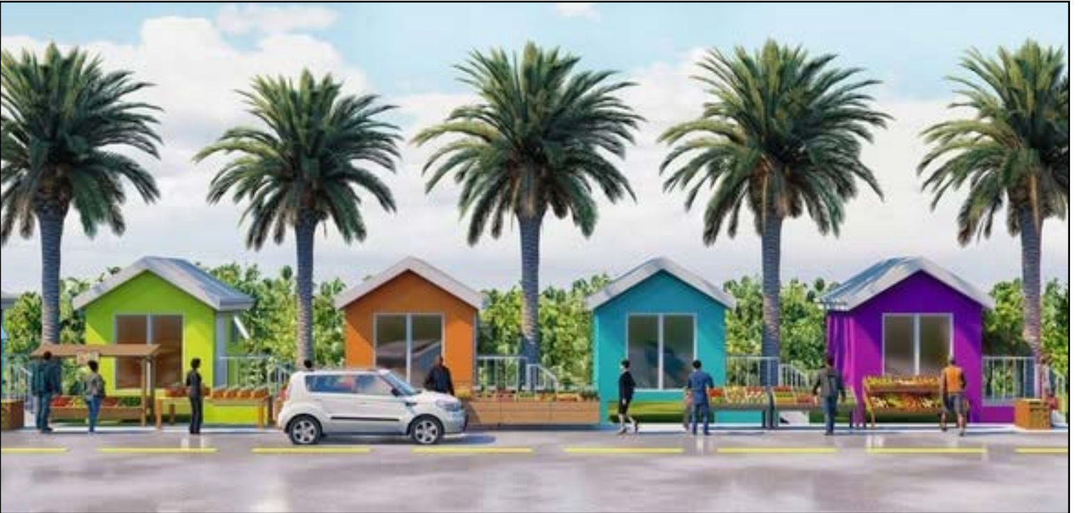
Artist drawing for new vending huts at Woods Pond

The Government is moving forward with a Vendors Intervention Project designed to upgrade the area where several hardworking fruit and vegetable vendors make their daily living at Woods Pond.