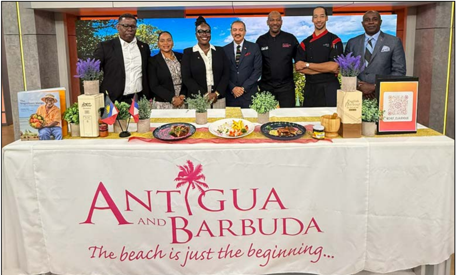
Antigua and Barbuda delegation at CTO's Caribbean Tourism Week in New York City

Antigua and Barbuda was spotlighted this week at the Caribbean Tourism Organization's (CTO) Caribbean Week in New York which runs from June 1 - 6. The Antigua and Barbuda Tourism Authority (ABTA) joined representatives from dozens of other Caribbean countries at The Westin New York at Times Square and played a leading role in showcasing the future of Caribbean tourism.