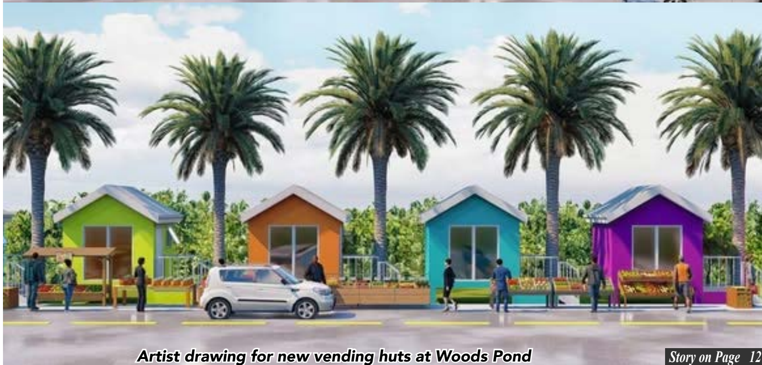
Artist drawing for new vending huts at Woods Pond