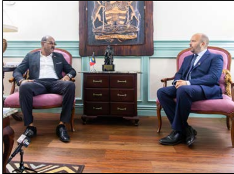
Prime Minister the Hon. Gaston Browne and British High Commissioner to Barbados and the Eastern Caribbean, His Excellency Simon Mustard

“We continue to do all we can to strengthen not only the bilateral relationship between Antigua and Barbuda and the UK, but also the regional and sub-regional relationships between CARICOM, OECS, and the United Kingdom,” said Prime Minister Browne. He highlighted the UK-funded CIF facility, which contributed £14 million to rehabilitate two critical roadways, and praised the UK's contributions to