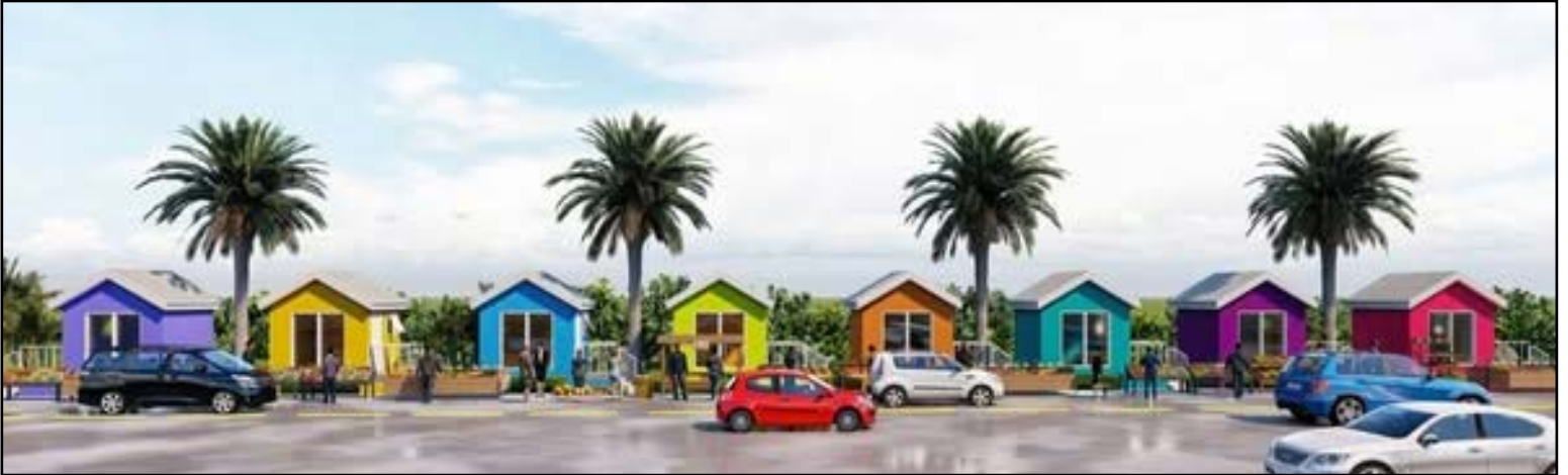
A new aesthetically pleasing vending operating proposed for Woods Pond