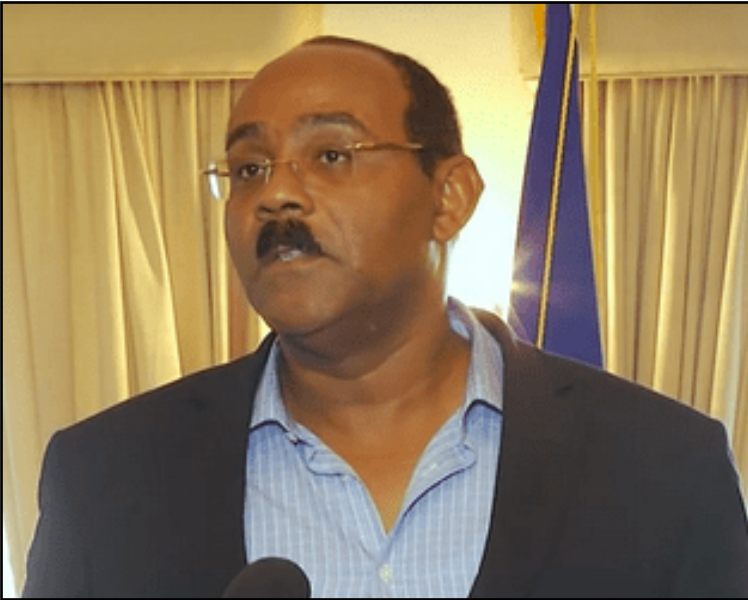
Prime Minister Gaston Brown

Prime Minister Gaston Browne is expressing high hopes for next year's Commonwealth Heads of Government Conference (CHOGM) which Antigua and Barbuda will host for the first time.