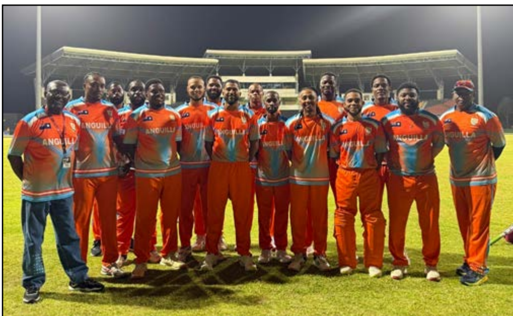
The Anguilla senior men's cricket team

After winning their first two matches, host Antigua and Barbuda suffered their first defeat in the inaugural Leeward Islands Cricket Board's (LICB) T20 Festival on Tuesday.