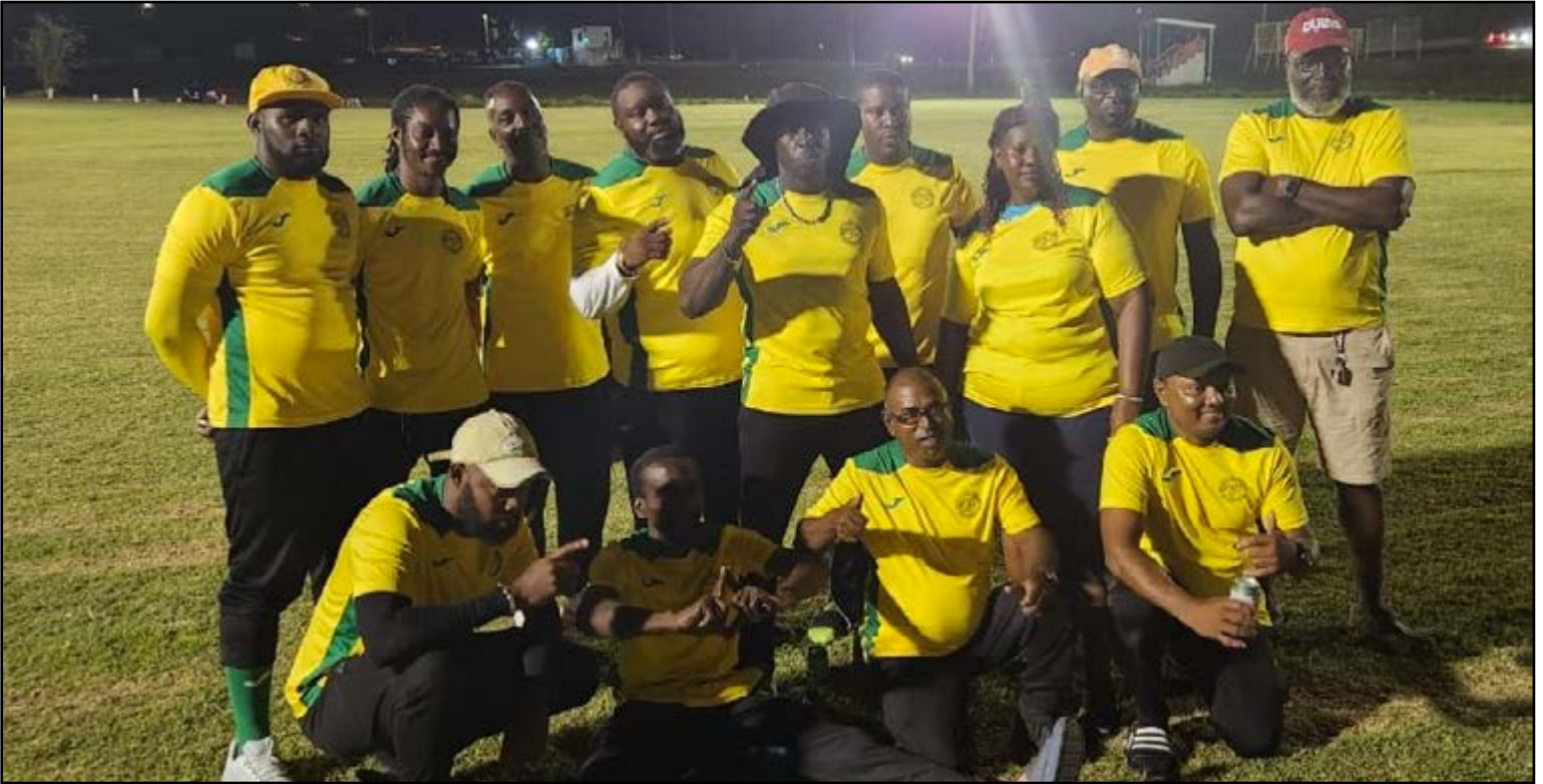
Marcko Inc. Buckley's 3Js men's softball cricket team

Marcko Inc. Buckley's 3Js won their final match in the preliminary stage to clinch the second-seed rankings in the semi-finals of the Antigua Barbuda Softball Cricket Association's (ABSCA) WTP 93.5 FM Men's 30-Over Championship on Sunday.