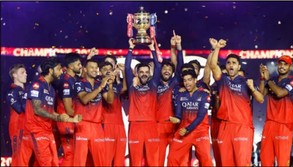
Royal Challengers Bengaluru's Virat Kohli lifts the IPL Trophy after beating Punjab Kings in the final in Ahmedabad, India, on Tuesday, June 3, 2025.

AHMEDABAD (Reuters) - Royal Challengers Bengaluru and their talisman Virat Kohli ended a 17-season drought by winning their maiden Indian Premier League (IPL) title, beating Punjab Kings by six runs in the final in Ahmedabad on Tuesday.