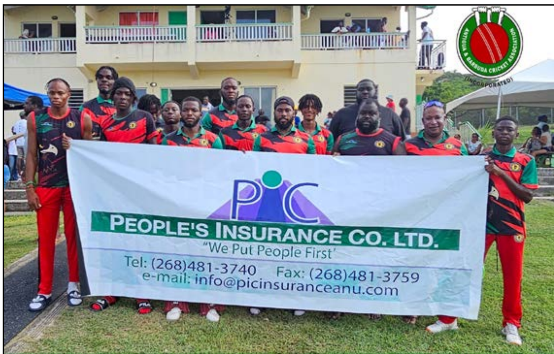
The PIC Insurance Liberta Blackhawks team pose with their sponsor's banner after retaining the Antigua and Barbuda Cricket Association's (ABCA) Super40 Cup at Ball Beef in Liberta on Sunday, May 19, 2024.

The Antigua and Barbuda Cricket Association (ABCA) has made changes to the preliminary stage and knockout format for this year's Super40 Cup limited overs competition, which will commence next weekend.