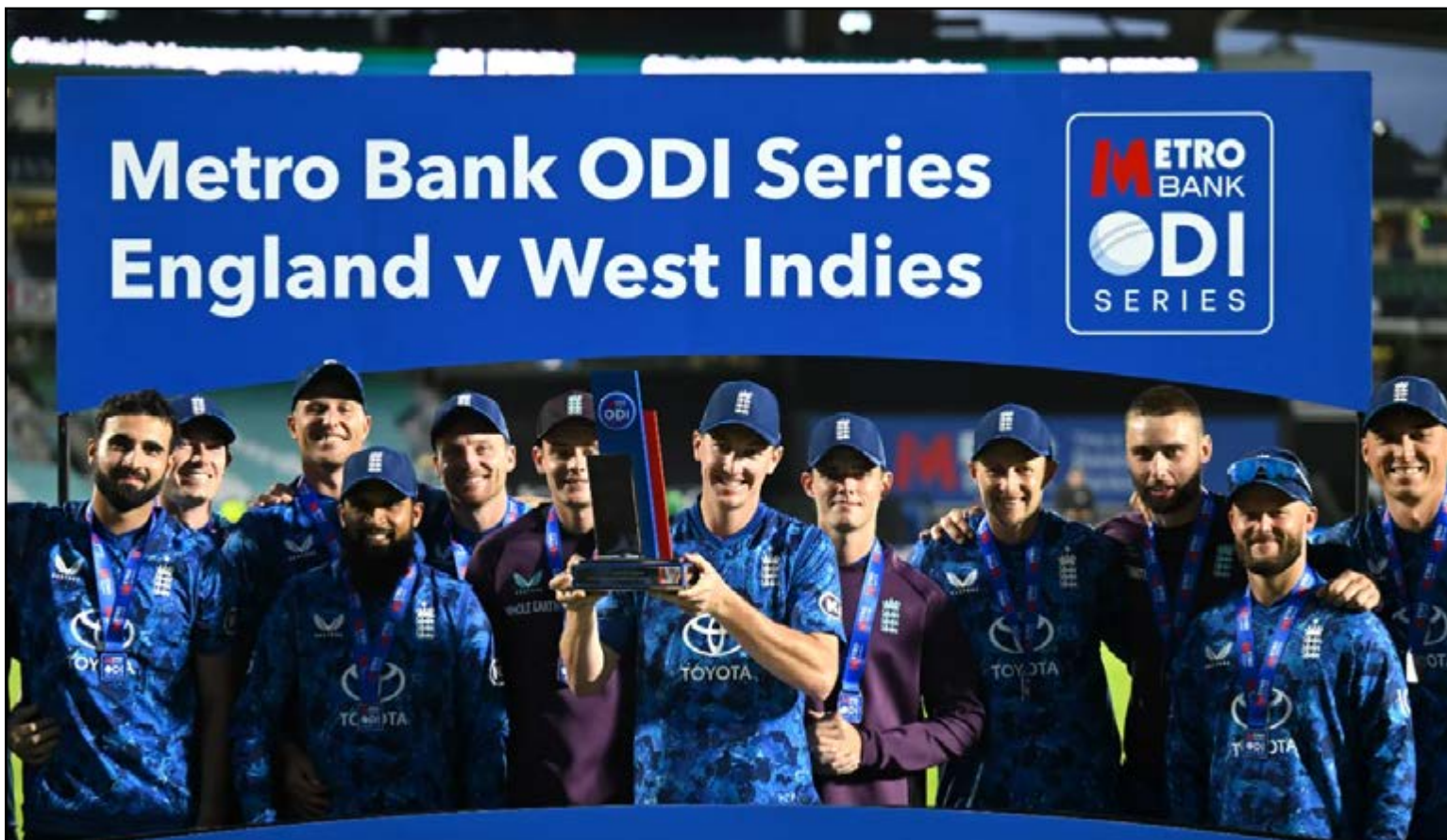
Captain Harry Brook holds the trophy as England's players celebrate after sweeping the ODI series against the West Indies by winning the third and final match at the Kia Oval in London, England, Tuesday, June 3, 2025.

Despite half-centuries from the returning Sherfane Rutherford and Gudakesh Motie, England handed the West Indies a comprehensive seven-wicket loss to complete a 3-0 sweep of their One-Day International Series at The Kia Oval in London on Tuesday.