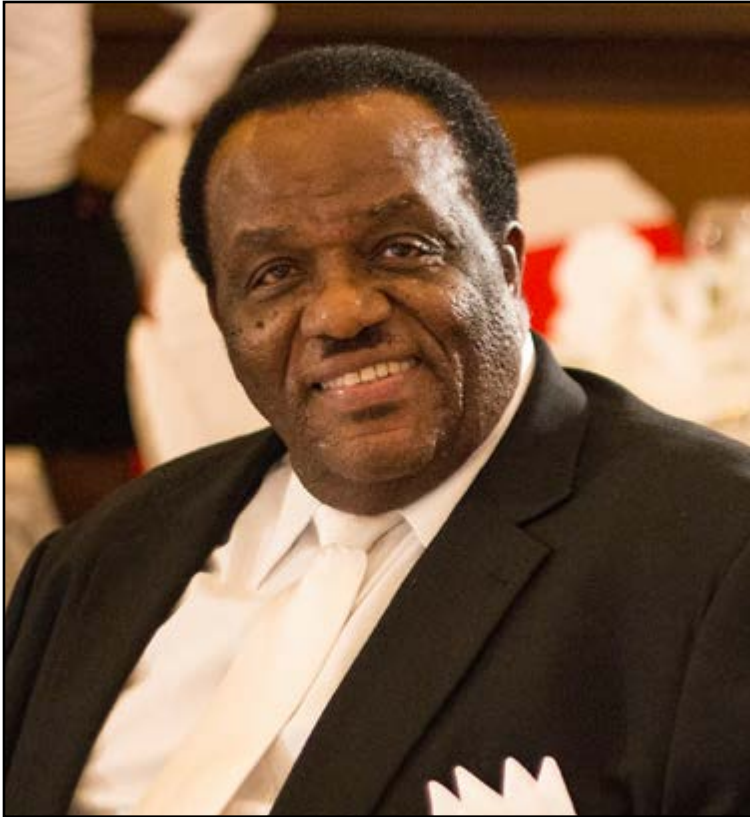
Labour Minister, Sir Steadroy Benjamin

Labour Minister, Sir Steadroy Benjamin, said the government is open to initiating discussion related to the