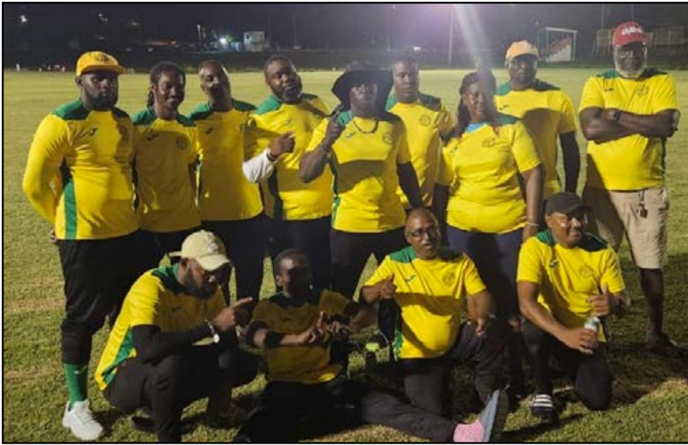
The Buckley's 3Js softball cricket team

Marcko Inc. Buckley's 3Js and Rackaman Construction Strictly Business claimed their second wins in three matches in the Antigua Barbuda Softball Cricket Association's (ABSCA) WTP 93.5 FM Men's 30-Over Championship at the Swetes playing field on Sunday.