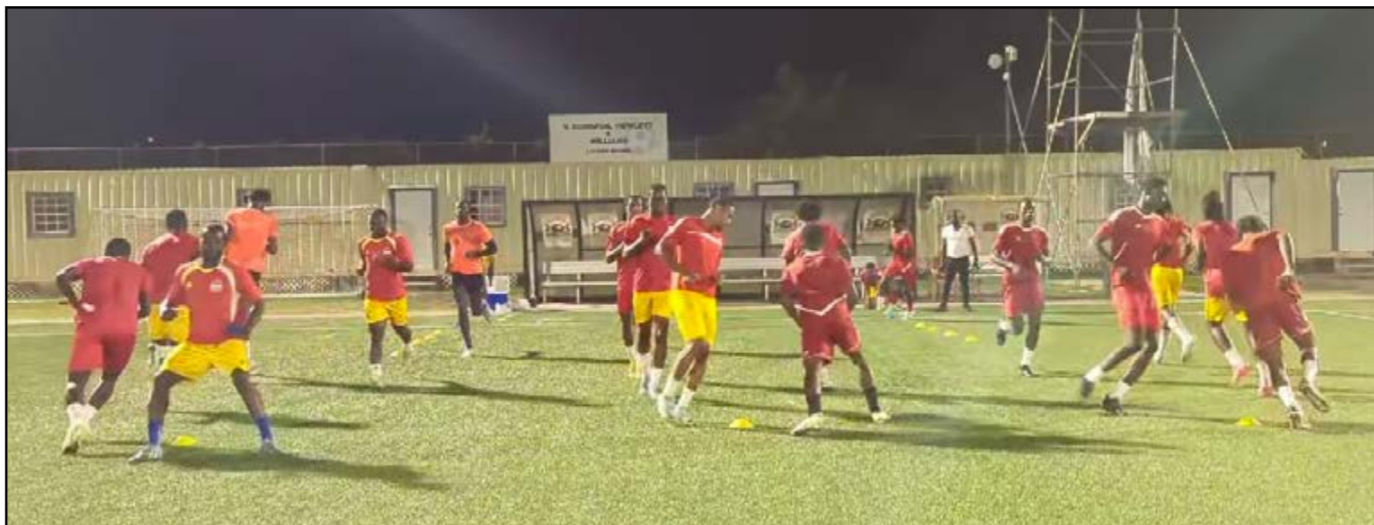
The Antigua Benna Boys training at the ABFA Technical Center.

Antigua and Barbuda will be among teams from the CONCACAF (Confederation of North, Central America, and Caribbean Association Football) Region that will be resuming their campaign in the second round of qualifying matches next week in an effort to reach the 2026 FIFA World Cup Finals.