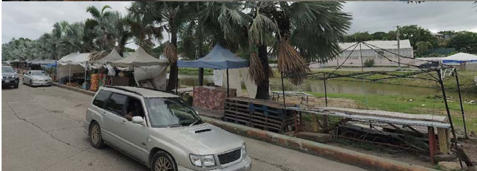
Vending area at Woods Centre