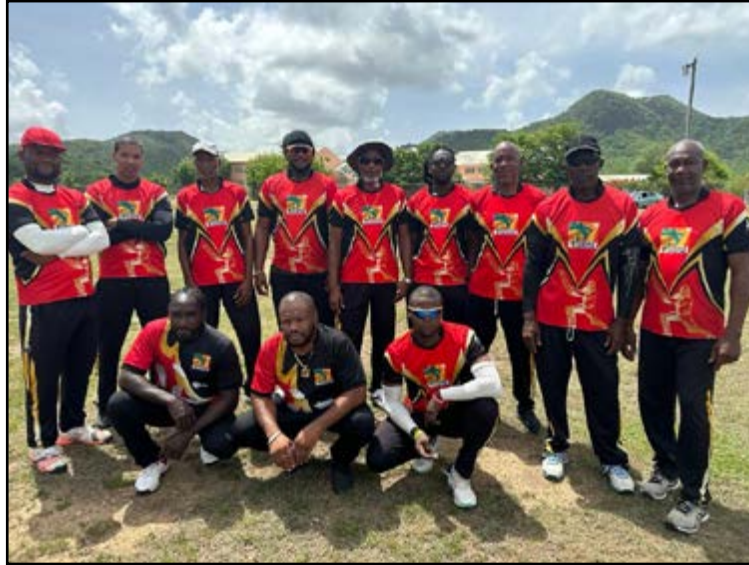
Rackaman Construction Strictly Business softball cricket team. (File photo)