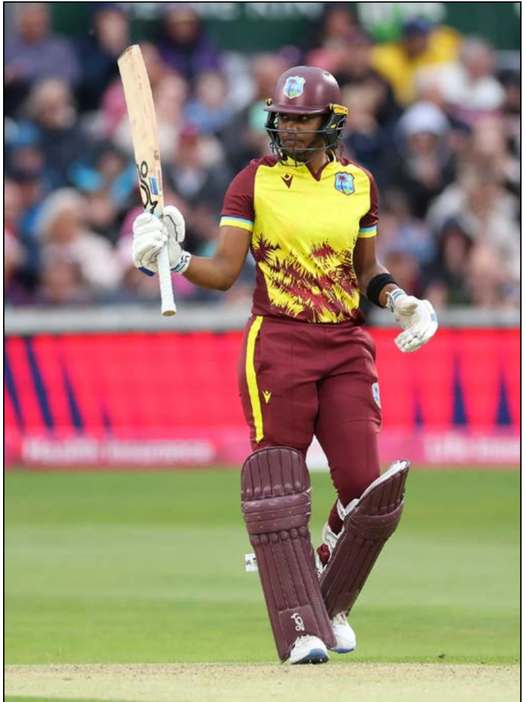
West Indies women's captain Hayley Matthews celebrates after reaching a half-century against England during the third T20 International at Chelmsford, Essex, England, on Monday, May 26, 2025.

October last year during the ICC Women's T20 World Cup in Dubai, when she had become the first from her country to grab the top spot.