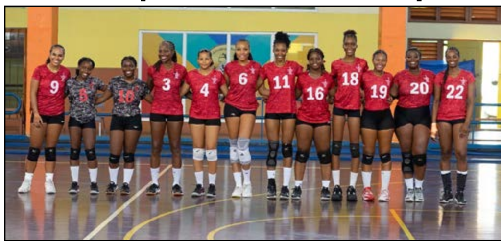
The University of the West Indies Mona Campus women's volleyball team

The Mona Campus of Jamaica made a clean sweep by winning all three division competitions during the University of the West Indies (UWI) Volleyball Games in Antigua over the weekend.