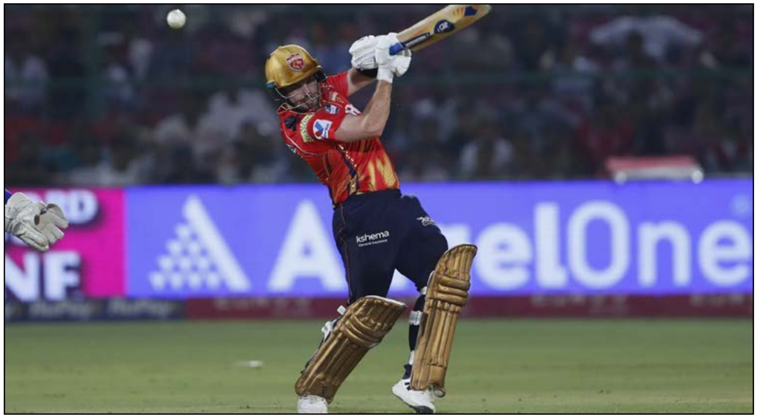
Punjab Kings' Josh Inglis plays a shot during the Indian Premier League cricket match between Punjab Kings and Mumbai Indians at Sawai Mansingh Stadium in Jaipur, India, Monday, May 26, 2025.

JAIPUR, India — Punjab Kings secured a top-two spot in the Indian Premier League playoffs after defeating five-time winners the Mumbai Indians by seven wickets on Monday.