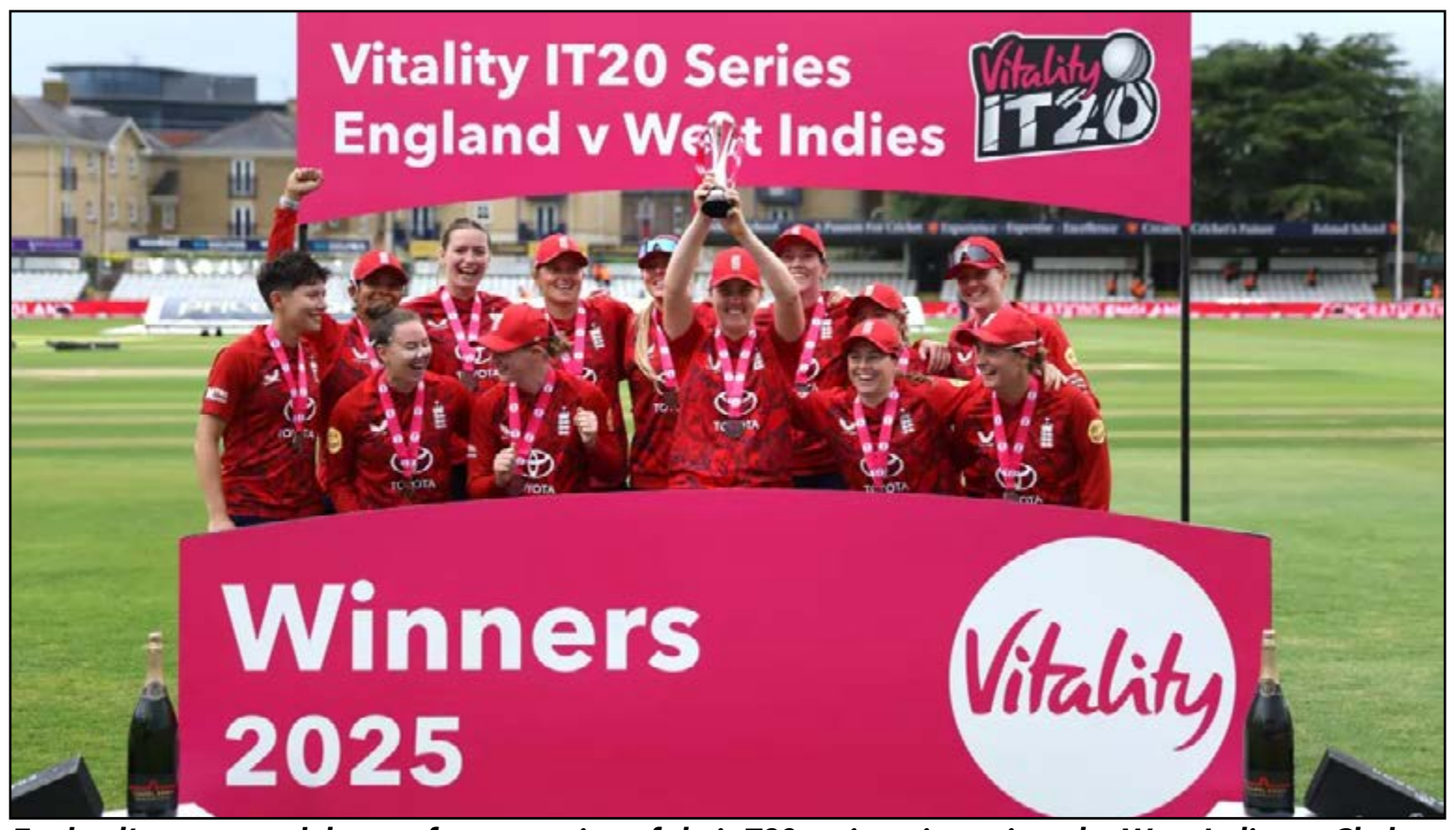
England's women celebrate after wrapping of their T20 series win against the West Indies at Chelmsford, Essex, England, on Monday, May 26, 2025.

Despite another strong performance with bat and ball from captain Hayley Matthews, the West Indies Women suffered a 17-run loss to England Women to close out their T20 International series at the County Ground in Chelmsford on Monday.