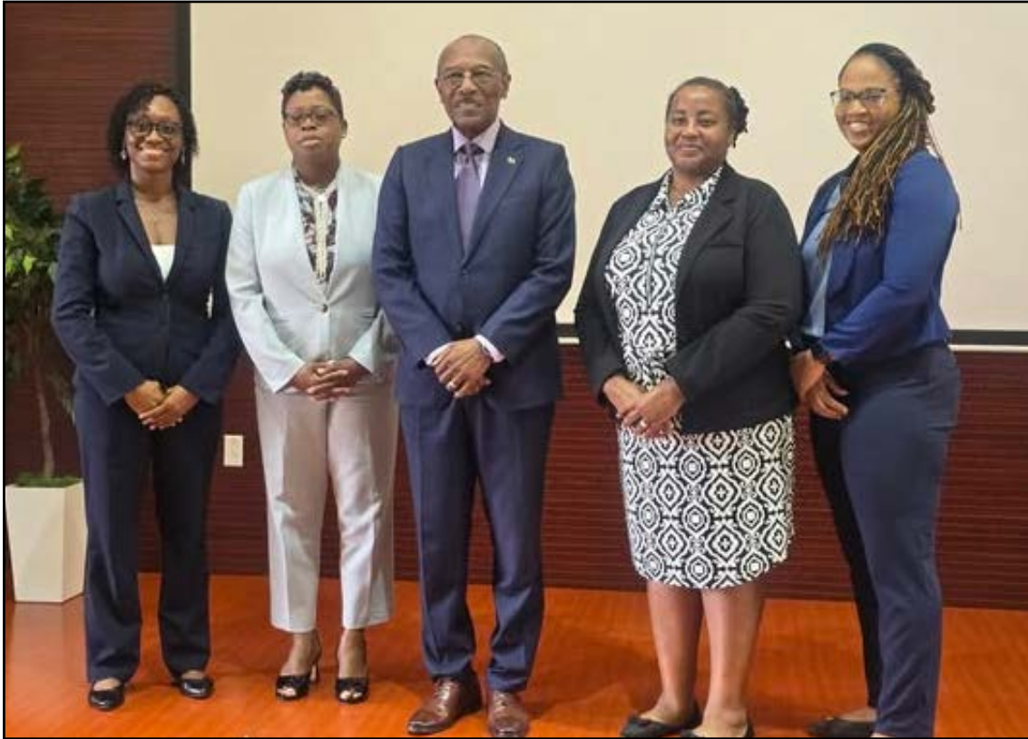
Health Minister, Sir Molwyn Joseph at CARPHA regional workshops

Minister of Health, Sir Molwyn Joseph, reaffirmed the government's commitment to improving preventative healthcare across the Caribbean during two major training initiatives hosted in collaboration with the Caribbean Public Health Agency (CARPHA) at the Villa Community Centre over the past two weeks.