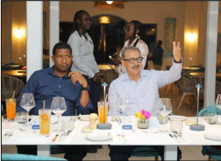
Minister Fernandez and Senator Guibion Ferdinand – Parliamentary Secretary Ministry of Tourism, St. Lucia

On the sidelines of the 43rd Caribbean Travel Marketplace (CTM) 2025, Antigua and Barbuda's Minister of Tourism, Civil Aviation, Transportation and Investment, the Hon. H. Charles Fernandez, hosted an intimate and elegant dinner at the world-renowned Jumby Bay Island. The evening brought together key regional tourism ministers and high-level industry stakeholders in celebration of the destination's successful hosting of the region's most prestigious tourism trade show and to foster deeper regional collaboration.