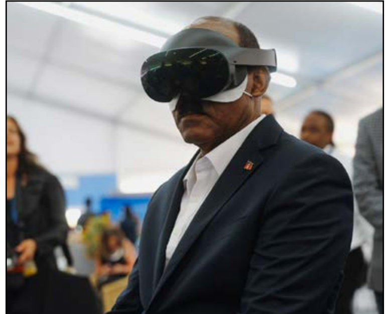
Prime Minister Gaston Browne experiences VR 360° Paradise" project

ST. Antigua and Barbuda continues to make waves in the global tourism industry, this time with an award-winning, cutting-edge marketing innovation that is positioning the destination at the forefront of immersive technology in travel.