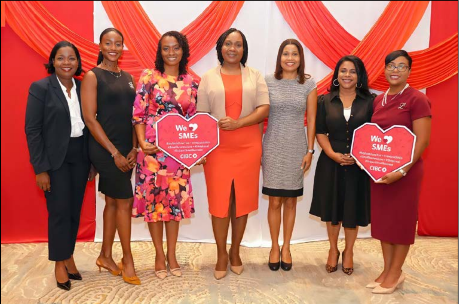
Group photo of Let's Talk growth women's business seminar