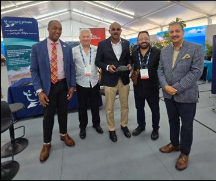
Prime Minister Gaston Browne along side Minister H. Charles Fernandez, Tourism Minister, President CHTA Sanovnik Destang and Winged Whale Media representatives