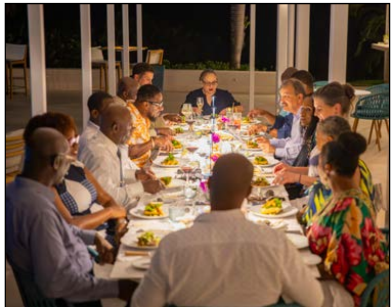
Minister Fernandez and Tourism Stakeholders

In a special moment during the evening, Minister Fernandez presented CHTA President Mr. Sanovnik Destang with a handcrafted mahogany boat replica, complete with sails fashioned from the national flag of Antigua and Barbuda, a symbolic token of appreciation from the Ministry of Tourism, celebrating both heritage and partnership.