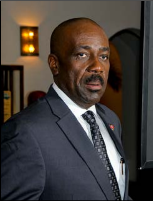
Minister of Foreign Affairs, E.P. Chet Greene

Antigua and Barbuda marked a significant milestone in its diplomatic history with the official opening of an Embassy in Abu Dhabi, United Arab Emirates (UAE) on 21 May 2025. The move represents a commitment by the twin-island state to strengthening bilateral ties with the UAE and expanding the nation's footprint in the Gulf region and beyond.