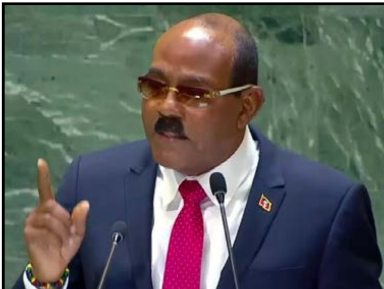
Prime Minister Gaston Brown

The government is still putting together all the documentation required ahead of finalizing the loan agreement for the massive road