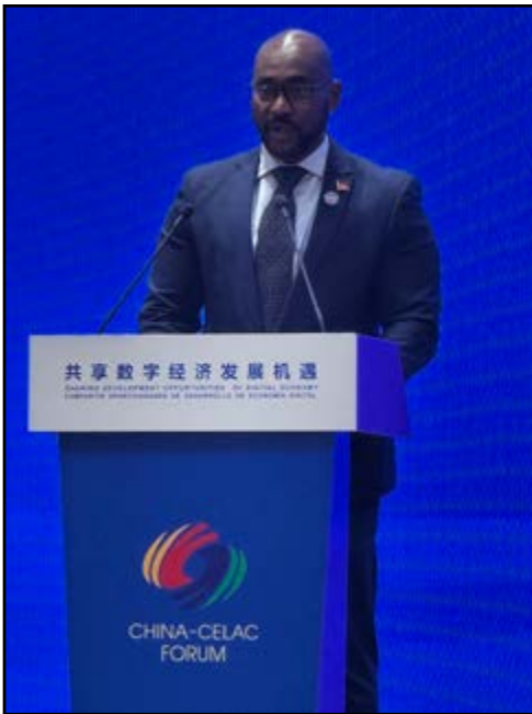
Chairman of the Free Trade and Processing Zone, Senator Lamin Newton,

Chairman of the Free Trade and Processing Zone, Senator Lamin Newton, has underscored the importance of technology as countries strive to achieve economic growth and social development.