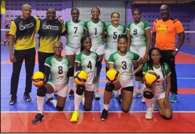
The Da Squad women's volleyball team

Reigning three-peat champions Cool and Smooth and JOMA Caribbean Da Squad maintained their unbeaten run in the Women's Division 1 competition in the Antigua and Barbuda Amateur Volleyball Association's (ABAVA) Local League on Wednesday evening.