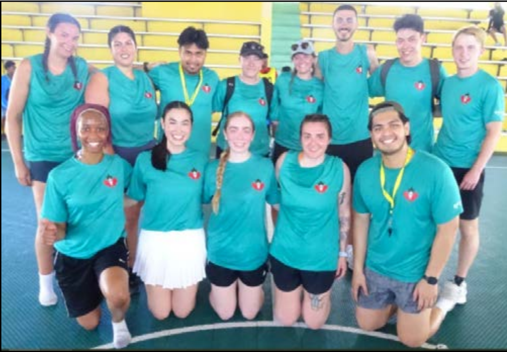
Some of the students from the University of Alberta at the JSC Sports Complex during the recent CPTSA Wings Youth Basketball Festival.

Several students from the University of Alberta in Edmonton, Canada, are currently visiting Antigua and Barbuda on a revived International Health Education and Research Experience (IHERE) programme.