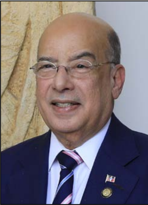
By Sir Ronald Sanders

“A nation without borders is not a nation”. That is the opening line of an advisory issued by the U.S. Department of State on May 15. It goes on to say, “Our government prioritizes the prosecution of offenses for illegal entry and illegal presence in the United States, as well as criminal offenses by foreign nationals.”