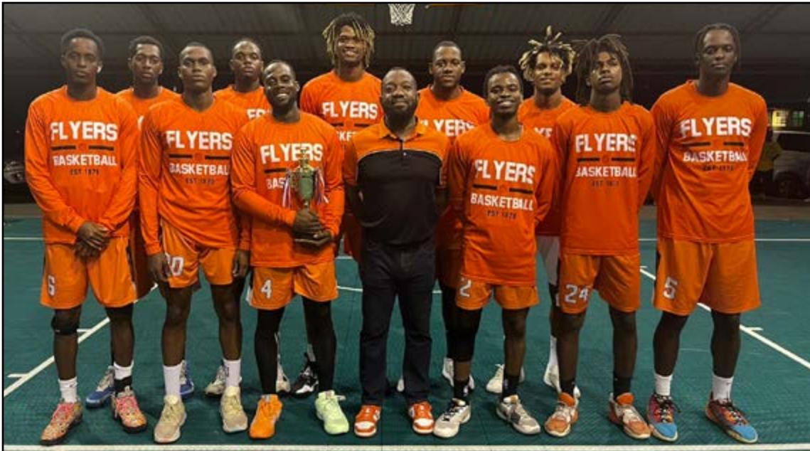
Top seed and defending ABBA Division 1 champions EZ Fit Flyers.

Top seed and defending champions EZ Fit Flyers have advanced to the finals of the Antigua and Barbuda Basketball Association's (ABBA) First Division playoff series.