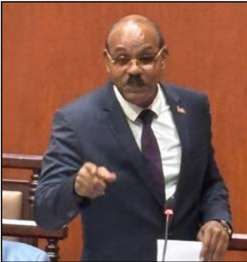
Prime Minister Gaston Browne

Prime Minister Gaston Browne has issued a stern warning to public servants in Antigua and Barbuda, 'shape up or ship out' as his government will no longer to 'putting up' with the lethargy and incompetence that have plagued