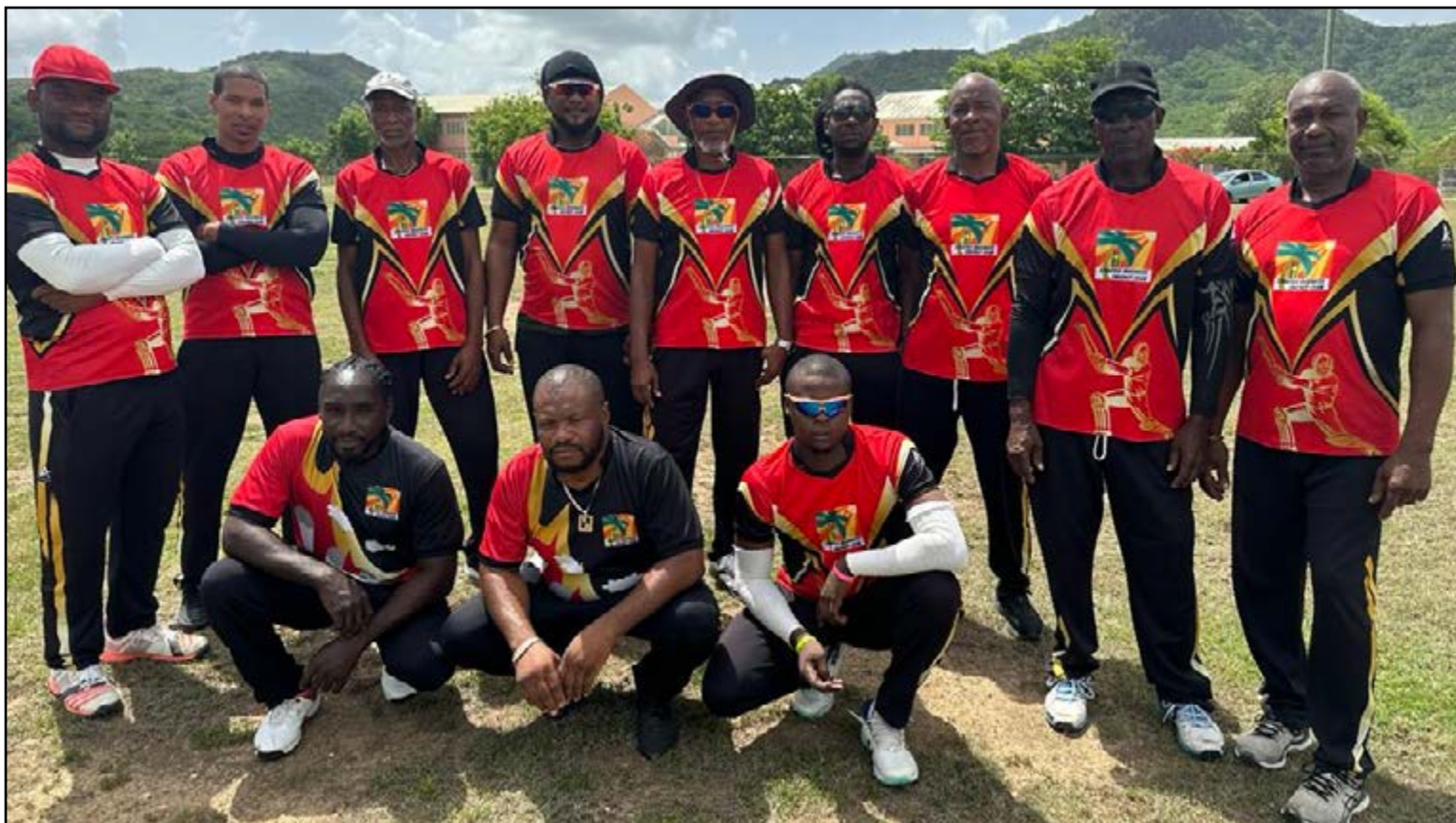
Rackaman Construction Strictly Business softball cricket team. (File photo)