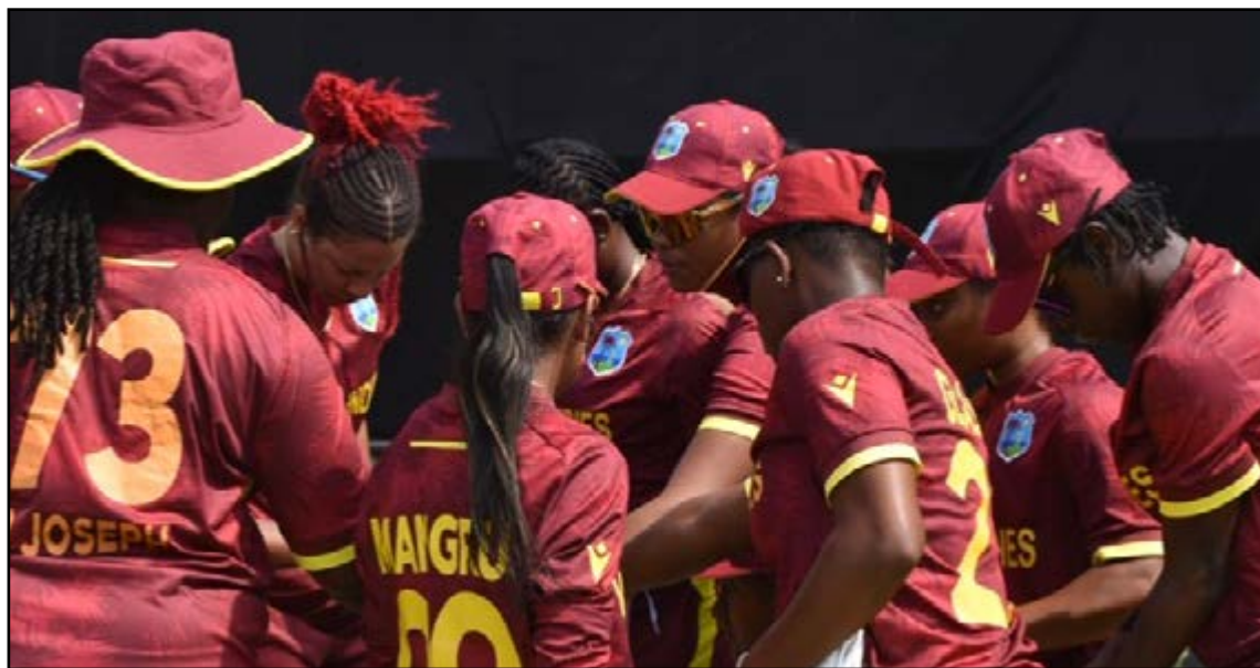
Players of the West Indies women's team

"The ongoing T20 Blaze competition has come at