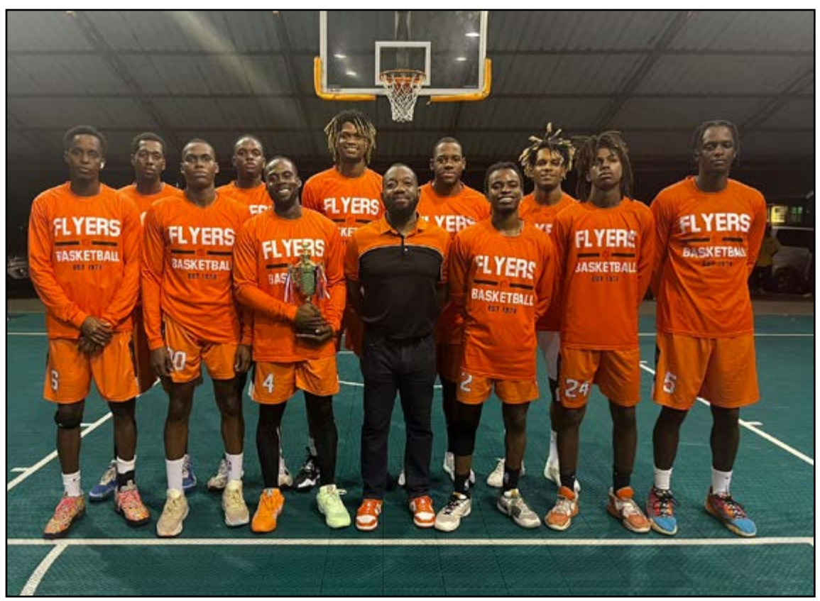
Top seed and defending ABBA Division 1 champions EZ Fit Flyers.

Top seed and defending champions EZ Fit Flyers have taken a one-nil lead in their best-of-three Antigua and Barbuda Basketball Association's (ABBA) First Division playoff series.