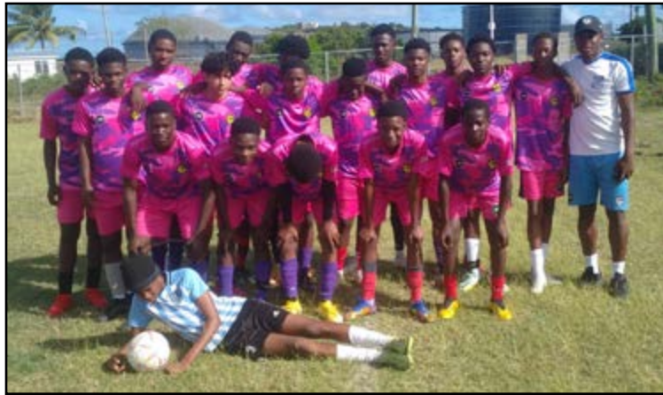
New Evolution won the under-17 division

both the under-17 and under-20 divisions. New Evolution FC won the under-17 division title, and Lions Soccer Academy took second place. The Villa Lions Soccer Academy captured the under-20 division, and Green City FC secured the runners-up spot.