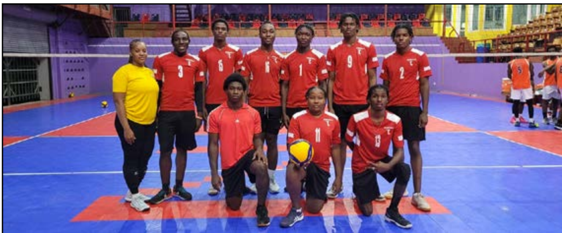
Stoneville 2 volleyball team

Stoneville 2 extended their unbeaten run to remain leaders of the Men's Second Division with a 2-0 victory against Chargers-Velocity in a top-of-the-table clash in the Antigua and Barbuda Amateur Volleyball Association's (ABAVA) Development League on Tuesday evening.