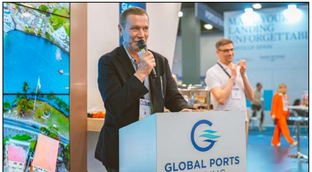
A Global Port representative addresses delegates at SeaTrade 2025