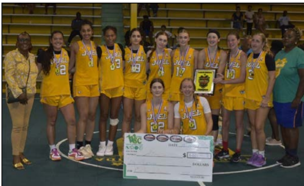
The Juel Stingers, one of three Canadians teams that contested the event, won the 19th Gillian Brazier Basketball Shoot-Out title at the JSC Sports Complex on Saturday, April 19, 2025.

The Juel Ravens missed out on reaching the final despite snatching