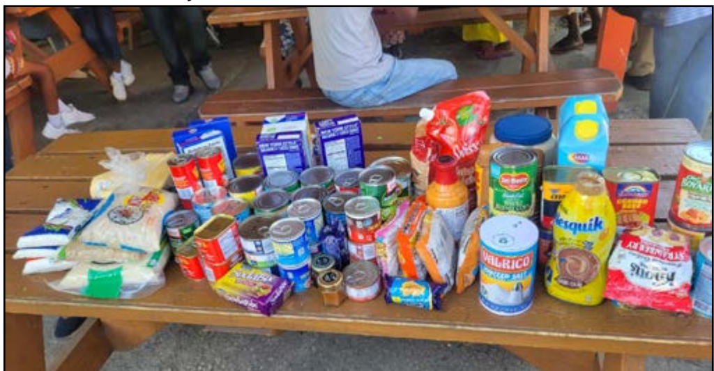
The donated food items are on display at the Soup Kitchen

“No one has ever become poor by giving,” he added quoting the WW1 heroine, Anne Frank.