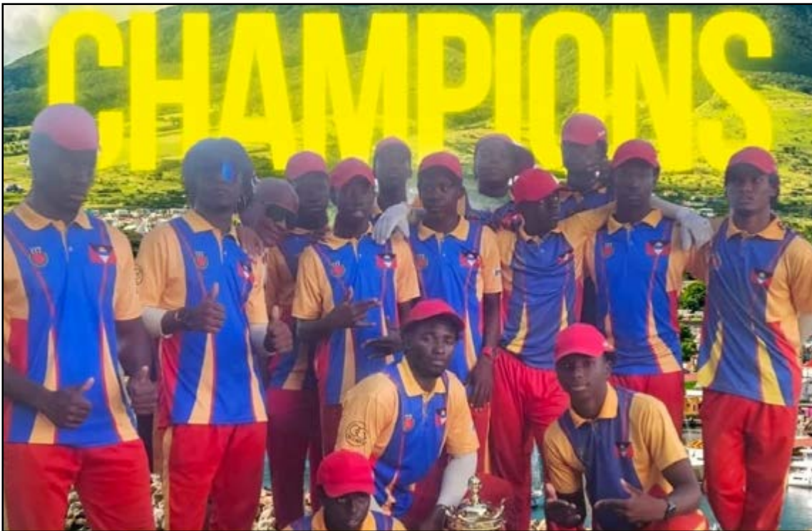
Antigua and Barbuda captured the Leeward Islands Cricket Board's (LICB) Under-19 Men's Championship at Warner Park in St. Kitts on Sunday, April 20, 2025.

Antigua and Barbuda have captured the Leeward Islands Cricket Board's (LICB) Under-19 Men's Championship. The Antiguan secured the title by pulling off a 33-run victory against St. Kitts in the final at Warner Park in St. Kitts on Sunday.