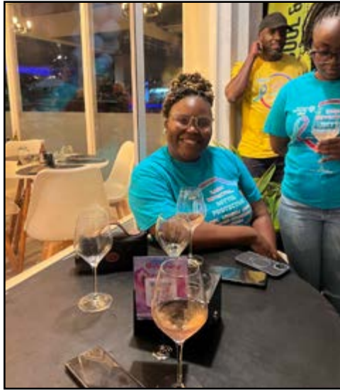
The launch event held at Sips and Tips

The Color Run traces its origins back to the early days of JCI Antigua's cancer awareness campaign, which began