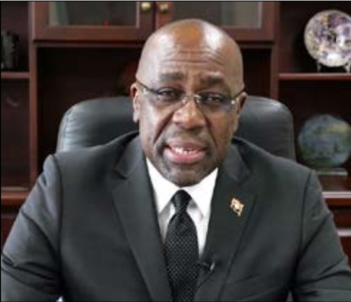
Foreign Affairs Minister, E.P. Chet Greene

Foreign Affairs Minister, E.P. Chet Greene has described the issues surrounding the sale of the Alfa Nero superyacht and the controversy surrounding the disbursement of the sale proceeds as ‘a red herring’ (or diversion) being used by the opposition UPP and that the country ‘has seen this script before’.