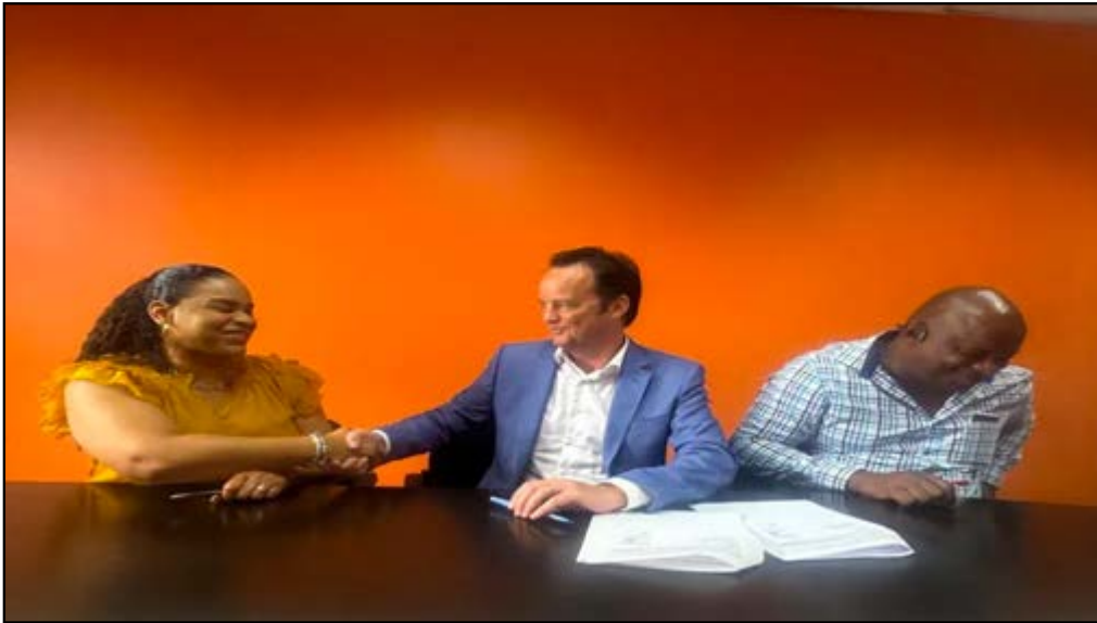
Regional Airline Winair And The Antigua And Barbuda Tourism Authority Have Announced A Strategic Partnership.

The Antigua and Barbuda Tourism Authority has announced a new partnership with intra-regional carrier, WinAir Airlines which has been in effect for more than a month.