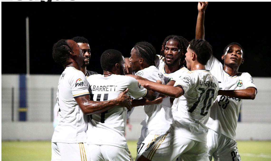
Players of the Jennings Grenades football team celebrate

Pigotts Bullets will remain in fifth place with 28 points after slumping to their seventh loss in 17