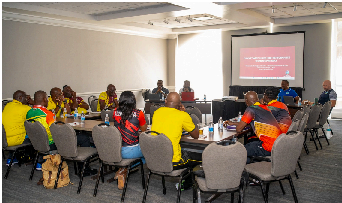
Participants at the CWI meeting in St. Kitts last weekend.

The players participated in several tutorial sessions focused on enhancing individual development, working with their territorial pathway coaches, and understanding the demands