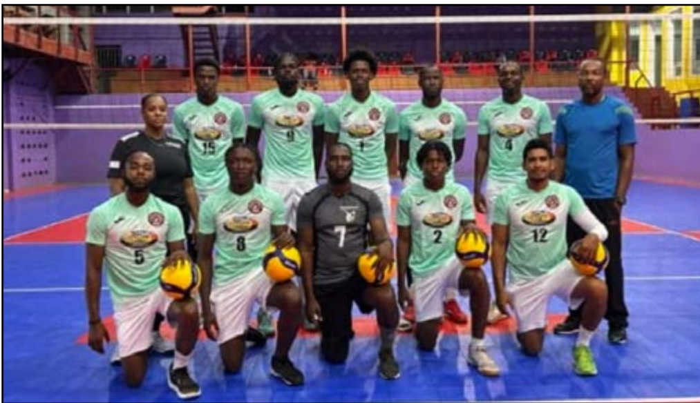
Stoneville men's volleyball team