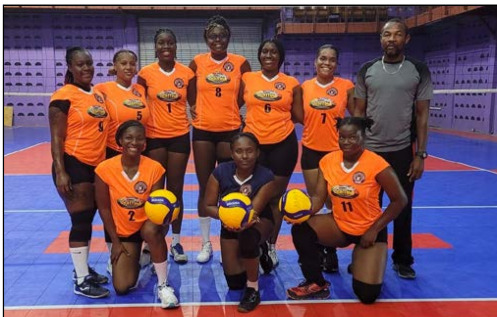
Theatric Lighting & Stage Effects and JOMA Caribbean Stoneville women's volleyball team.

ed victory by a 25-0, 25-0, and 25-0 scoreline against the Renegades, who were unable to field a team for the encounter.