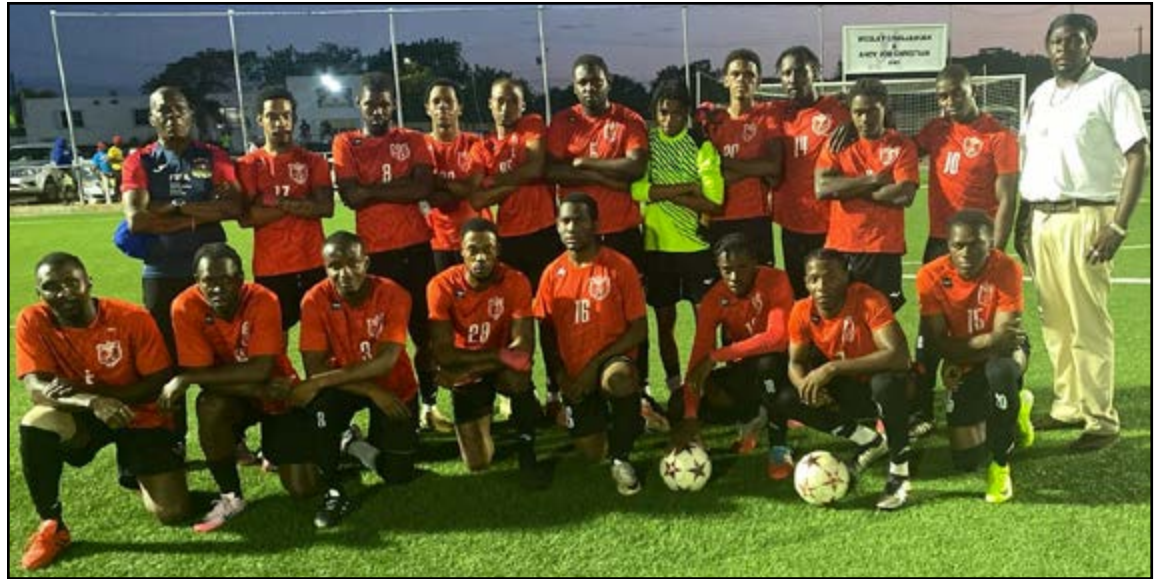
The Sir Molwyn Joseph Jennings United football team after one of their group stage matches at the ABFA Technical Center. (File photo)

The result allows Ottos Rangers to advance to 41 points, while Bendals FC