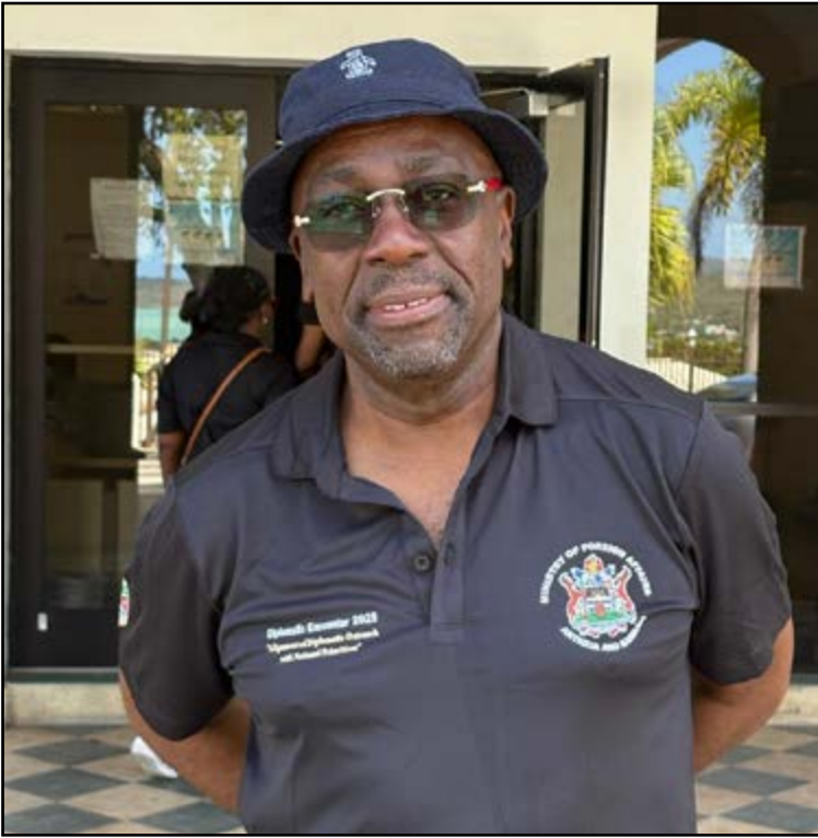
Foreign Affairs Minister E.P Chet Greene