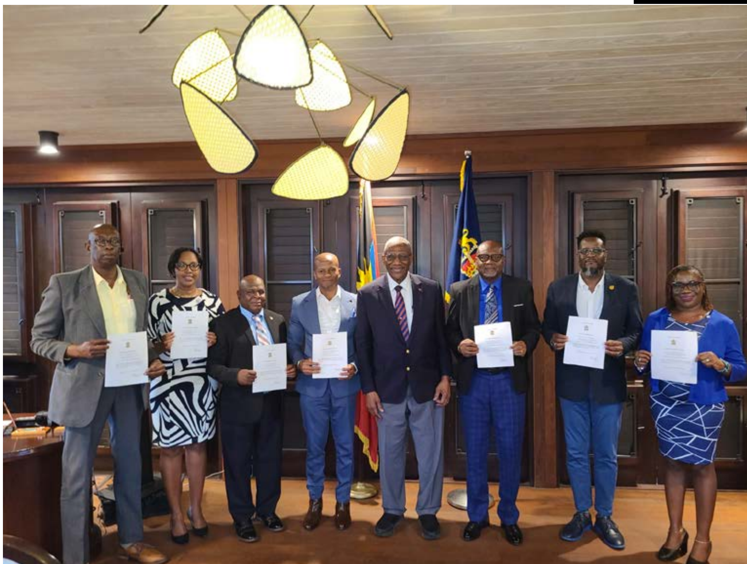
Members of the new Social Security board