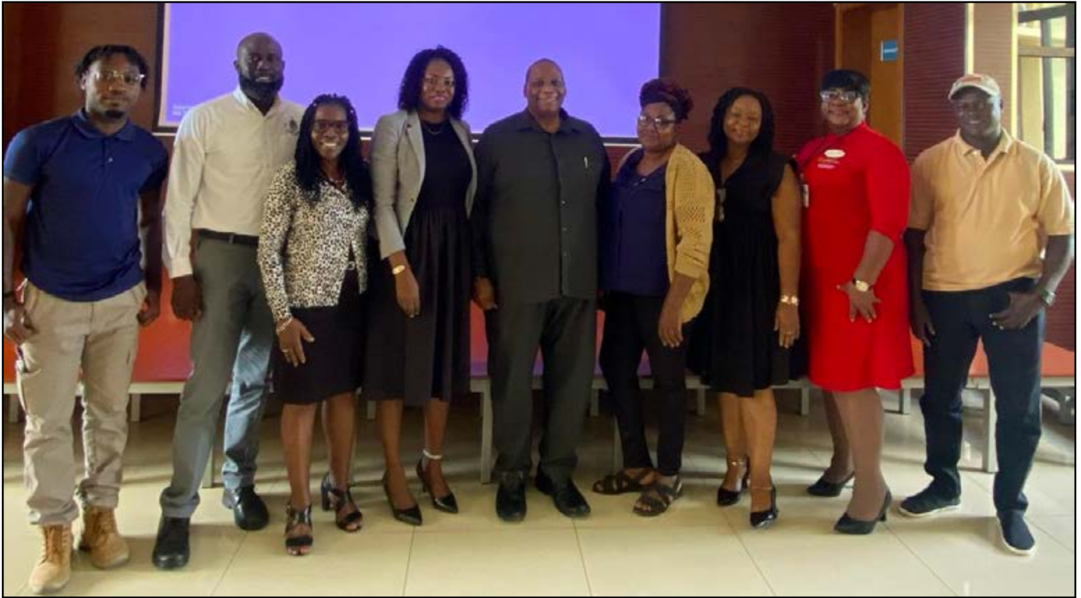
Bakers Association temporary board members with Ministry of Trade officials

Another round of consultation was held on Wednesday by the Ministry of Trade on the development of a National Bakeries Policy and the formation of Bakers' Association.