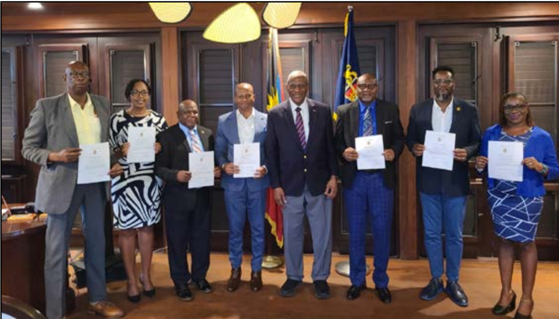
Members of the new Social Security board

The newly appointed members of the Antigua and Barbuda Social Security Board (ABSSB) were officially sworn on Wednesday at Government House. Sir Rodney Williams, Governor General of Antigua and Barbuda, administered the oaths of office and secrecy in the presence of the Board's leadership, government representatives, and guests.