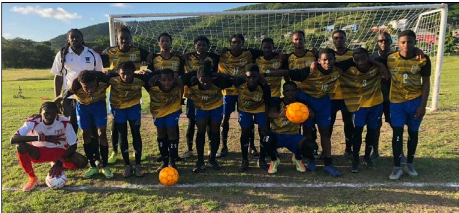
The Sir Molwyn Joseph Jennings United football team after one of their group stage matches

Sir Molwyn Joseph Jennings United has once again overtaken former leaders Ottos Rangers at the top of the Antigua and Barbuda Football Association's (ABFA) First Division League.