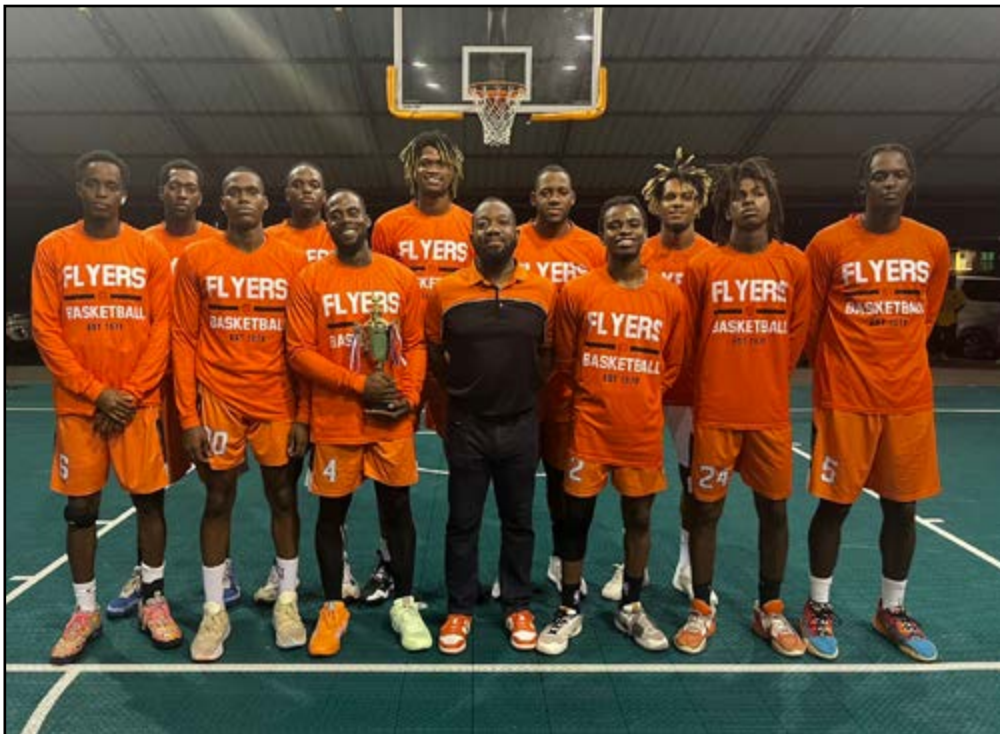
The EZ Fit Flyers basketball team

Reigning league and playoff champions, the EZ Fit Flyers, consolidated their position in second place in the Antigua and Barbuda Basketball Association's (ABBA) First Division League on Sunday evening.