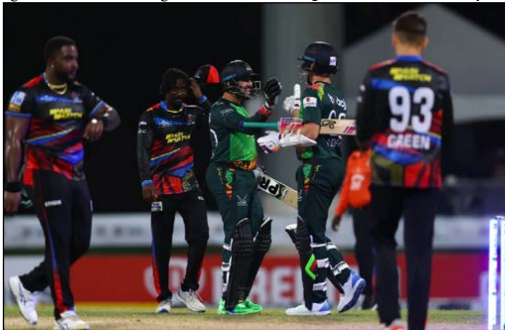
Players of the St Kitts & Nevis Patriots (green uniform) and Antigua & Barbuda Falcons get ready to leave the field at the end of one of their matches in the 2024 CPL.

The competition will conclude with the start of the playoffs at the Guyana National Stadium in Providence on Tuesday, September 16, and the final at the same venue on Sunday, September 21.