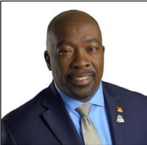
Technology Minister, Melford Nicholas

The testing of the paperless or electronic ED cards for entry or departure from Antigua and Barbuda is continuing as officials seek to 'iron-out' any remaining kinks in the system ahead of full introduction expected by the end of the month.