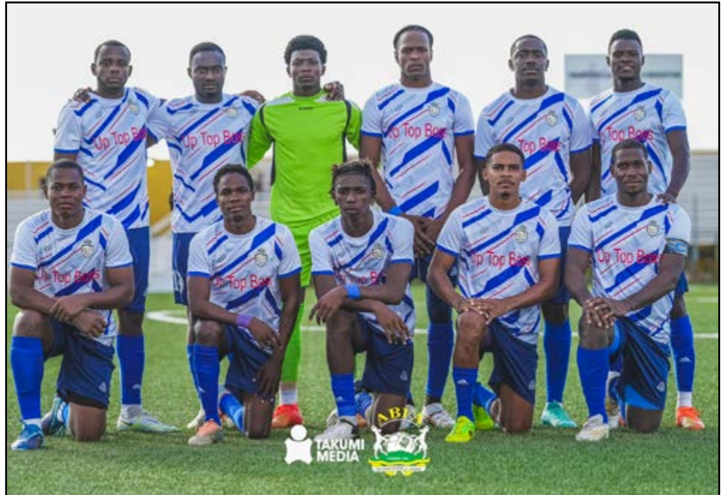
Players of the Old Road football team

The result allows Old Road to leapfrog Garden Stars into third place on goal difference, as both teams are now level on 37 points. However, Garden Stars have one