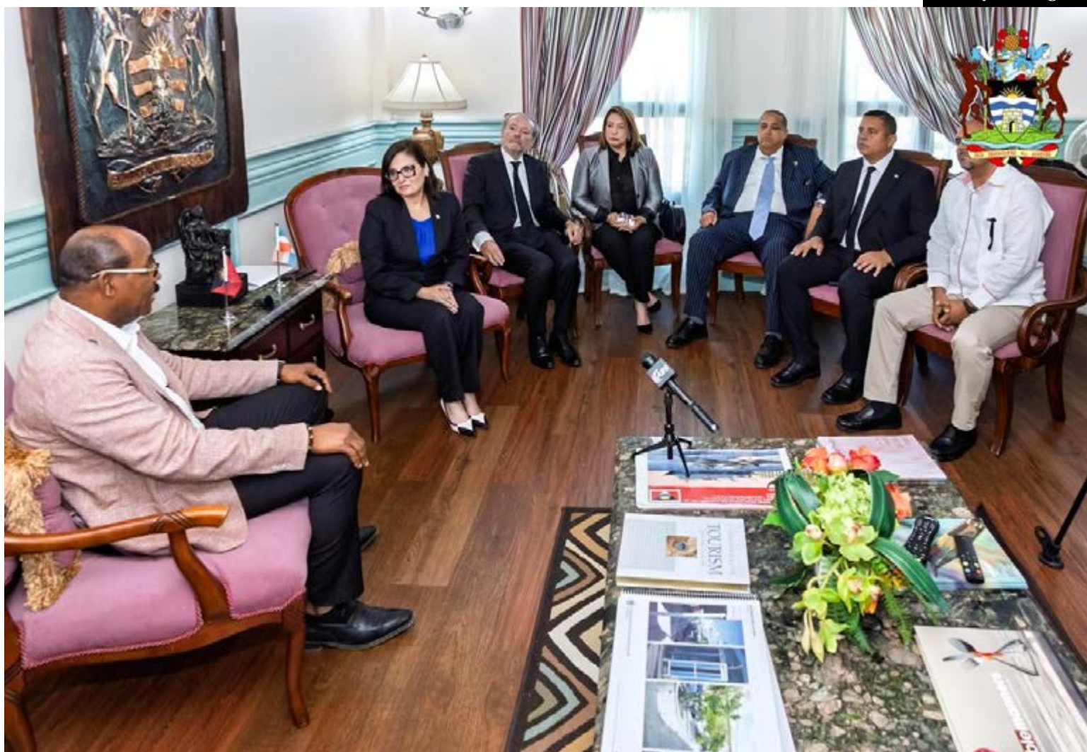
Prime Minister Gaston Browne and new resident Ambassador for the Dominican Republic Yolanda Victoria (on his left) during courtesy visit to the Office of the Prime Minister