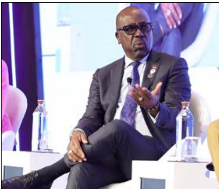
Foreign Affairs Minister, E. P Chet Greene

Foreign Affairs Minister, E. P Chet Greene has been speaking of the particular challenge that navigating relations with the United States and China poses for small states such as Antigua and Barbuda.