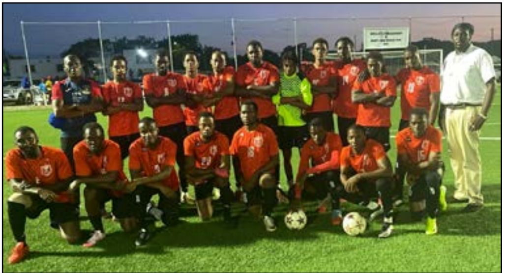
The Sir Molwyn Joseph Jennings United football team after one of their group stage matches at the ABFA Technical Center.

The Freemans Village Scorpions moved into third place and three points adrift of Ottos Rangers after recording their 10th win in 15 matches by snatching a one-nil win against FC Master Ballerz at the Freemans Vil-