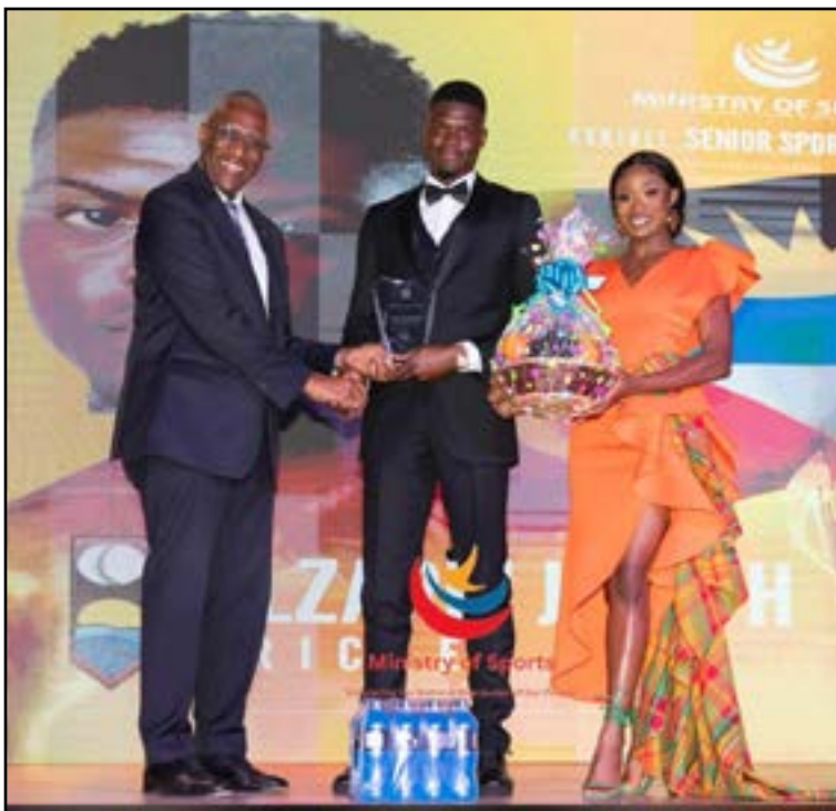
Awards 1. Alzarri Joseph, center, accepts his award from Governor General of Antigua and Barbuda Sir Rodney Williams.