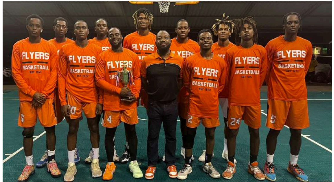
Players of the EZ Fit Flyers basketball team (File photo) Division 1 League.

But Lava Smoke Shop Warriors, which gained promotion to the first division after winning last season's second division league, won for the first time after losing their opening game during their debut campaign in the