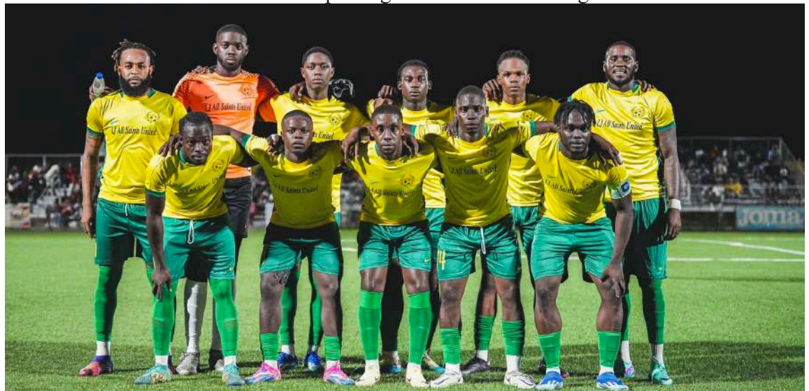
Players of the All Saints United football team

Points achieved in the first phase are brought forward and added to the points gained in the group stage.