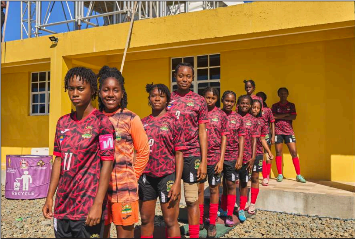
The starting XI of the Antigua and Barbuda Benna Girls during their second match against Guyana in Group A of the 2025 CONCACAF Under-20 Women's Qualifiers at the ABFA Technical Center on Sunday, February 23, 2025.

Antigua and Barbuda's Benna Girls will seek to salvage some lost pride in their final match in the 2025 CONCACAF Under-20 Women's Qualifiers, which is taking place across six four-team groups in four host countries from February 21 to 25.