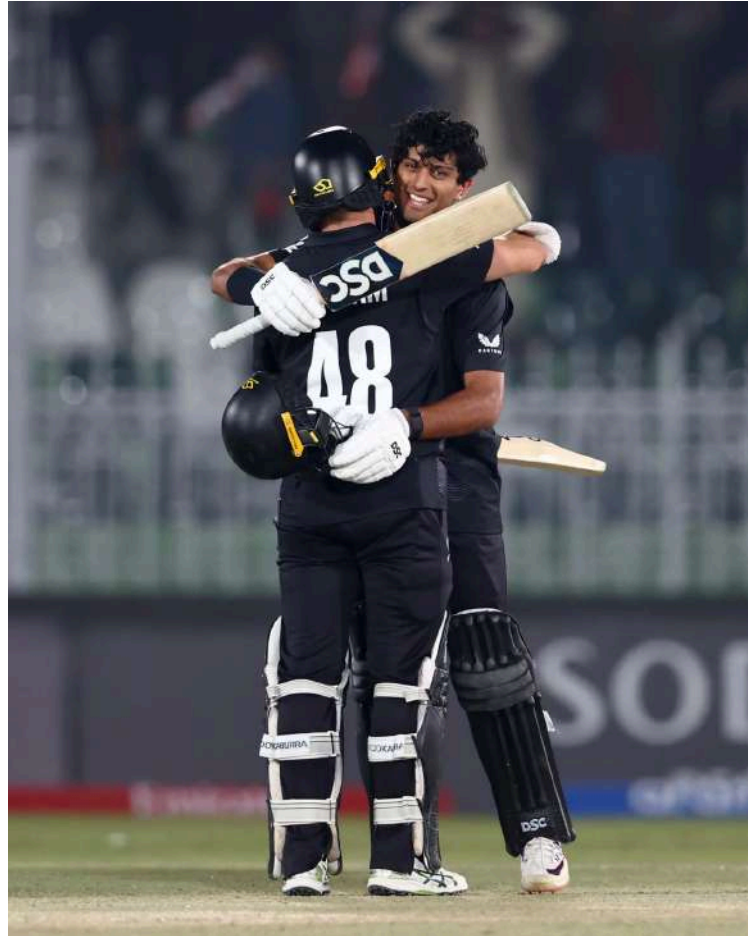
Rachin Ravindra embraces Tom Latham (#48) after beating Bangladesh in their match in the Champions Trophy in Rawalpindi, Pakistan, on Monday, February 24, 2025.

"The way we were able to pull it back in the middle with the ball was pleasing. It's probably the hardest thing to do in one-day cricket, take wickets in the