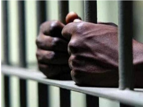
Detectives assigned to the Clarendon