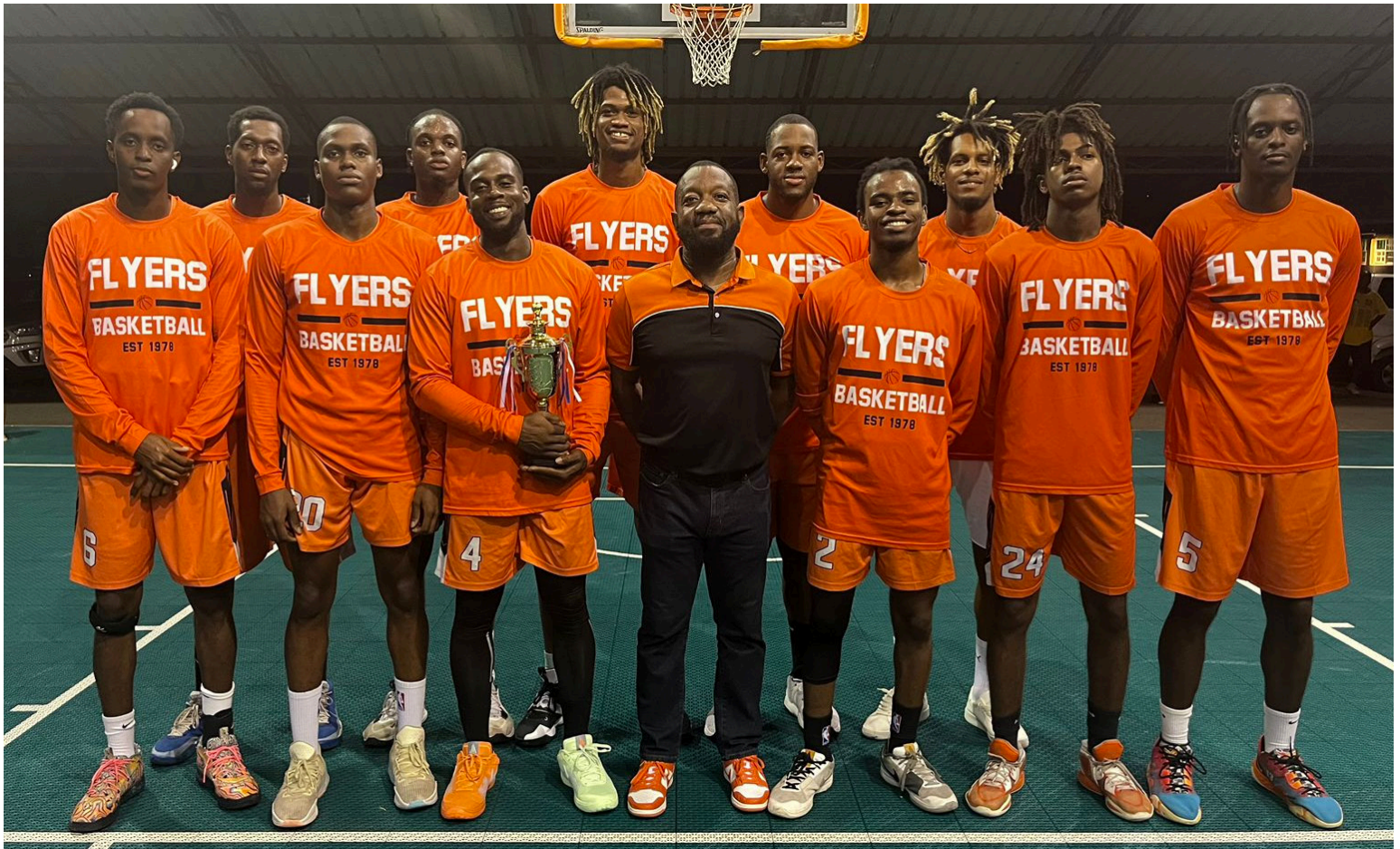
Players of the EZ Fit Flyers basketball team

Reigning Division 1 league and playoff champions, the EZ Fit Flyers, made it three wins in a row as they continued their impressive start to their campaign in the 2025 Antigua and Barbuda Basketball Association's (ABBA) domestic season on Sunday evening.