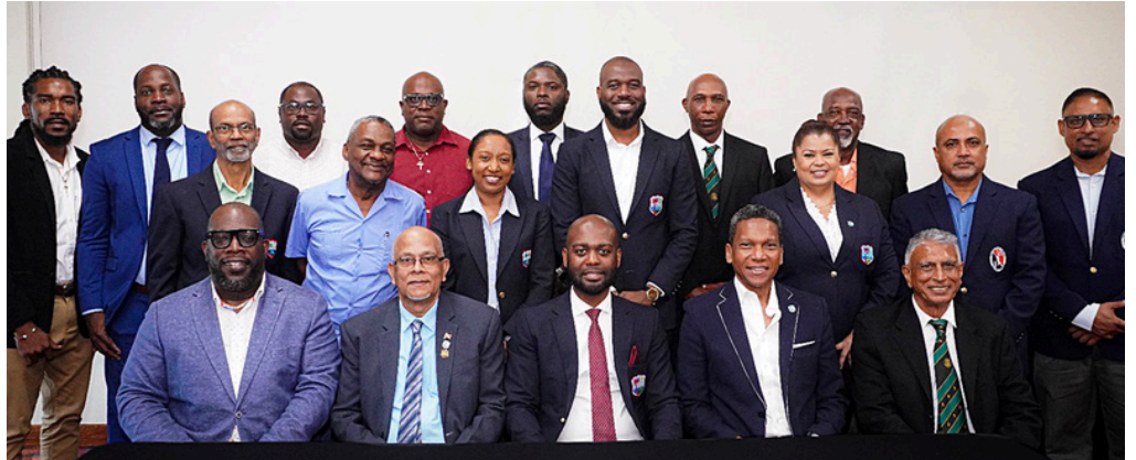
Representatives who participated in a special meeting of members of Cricket West Indies Inc. in Trinidad on Sunday, February 9, 2025.

"Today marks a defining moment for Cricket West Indies. With the implementation of long-overdue term limits and critical governance reforms, we are taking a bold and uncompromis-