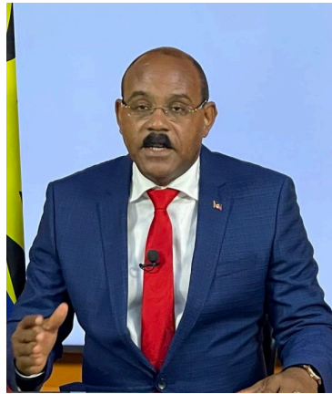
Prime Minister Gaston Browne Airlines 737 aircraft land on the sister isle within two years.

Meanwhile, PM Browne announced that the plans include adding a further 2000 linear feet to the runway in Barbuda as the government wants to have the American