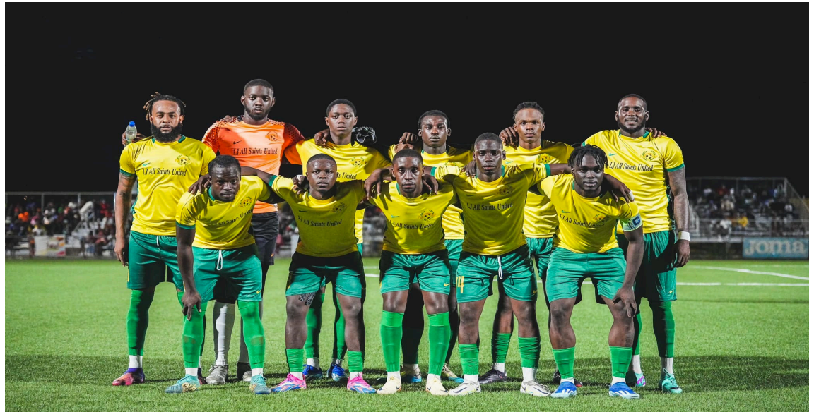
Players of the All Saints United football team

It was the first game in the group stage for the Potters Tigers, who will remain in 11th place in the overall