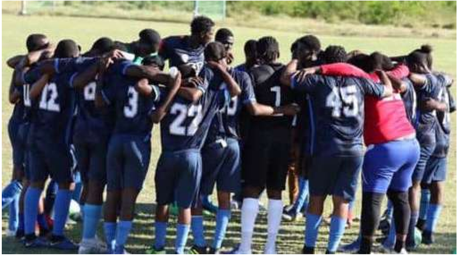
Players of the Cedar Grove Blue Jays