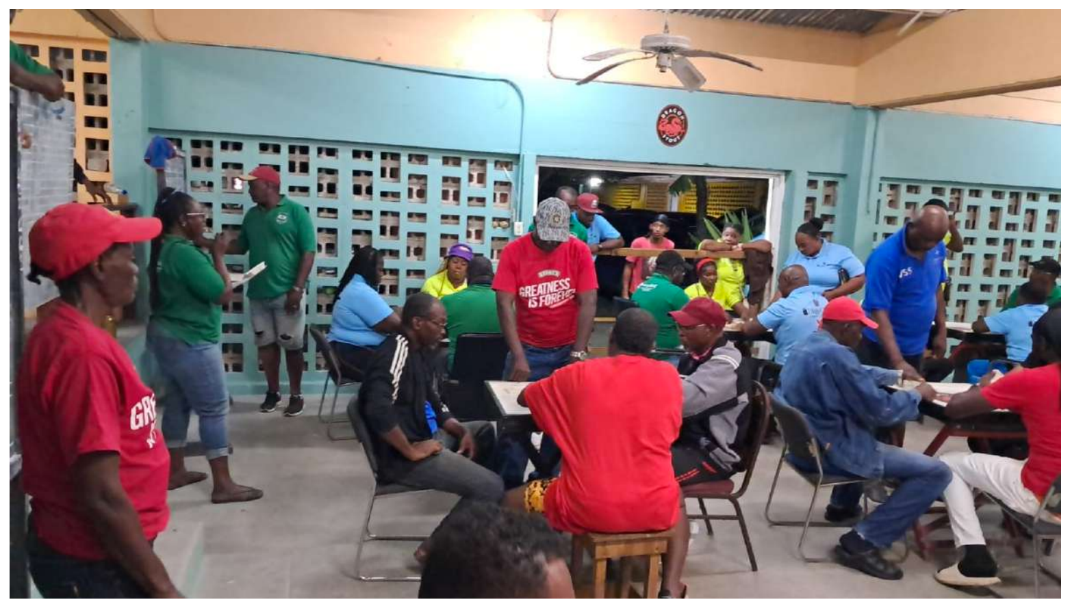
Players compete in the opening three-hand competition of the 2025 Antigua and Barbuda National Domino Association's domestic season at the ABNDA's headquarters in Lower Ottos.

The Willikies Super Stars B team and Double Six Ice are current joint leaders of the opening three-hand competition of the 2025 Antigua and Barbuda National Domino Association (ABNDA) domestic season.