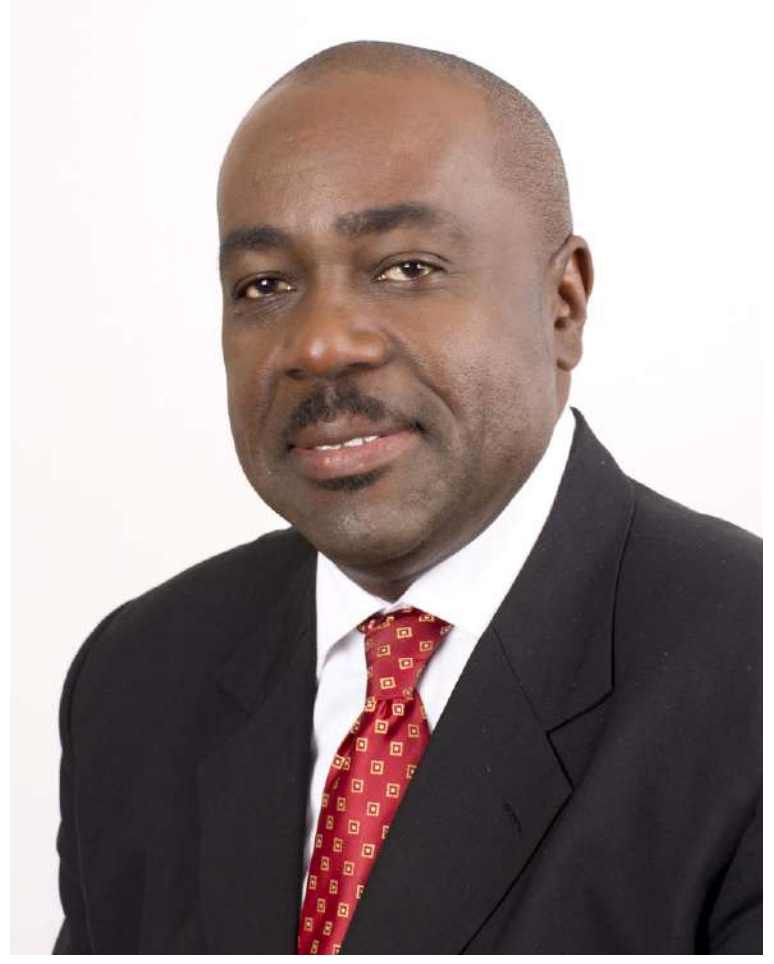
By Hon. E. P. Chet Greene Minister of Foreign Affairs, Trade and Barbuda Affairs

Politics is often portrayed as an unprincipled, chaotic engagement. But at its core. politics is the science of life; governed by rules and the decisions made within it that impact people's lives in profound ways. Social and economic progress or stagnation, are the results of political decisions, frequently referred to as "policy interventions'. If we acknowledge this truism, we must also accept that honesty and decency are fundamental to national success. As a