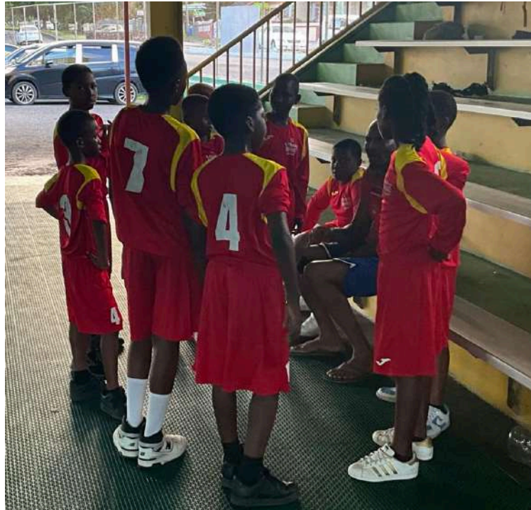
The players of the Buckley's Primary Miniboy's Primary Division team listen to their coach prior to the start of their game against Cedar Grove Primary in the Cool and Smooth Inter-School Basketball League at the JSC Sports Complex on Tuesday.