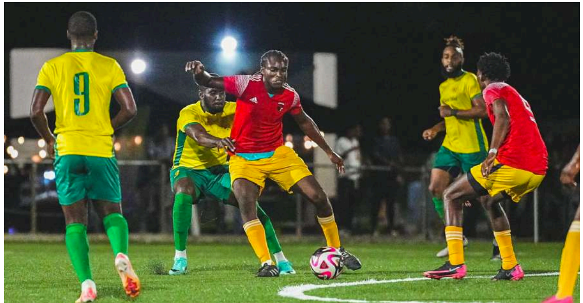
Players of All Saints United and Five Islands (red and yellow uniform) compete in the Premier Division League at the ABFA Technical Center in October 2024.

The team with the highest amount of points at the end of the group stage or second round will be declared champions of the 2024/25 ABFA's Premier