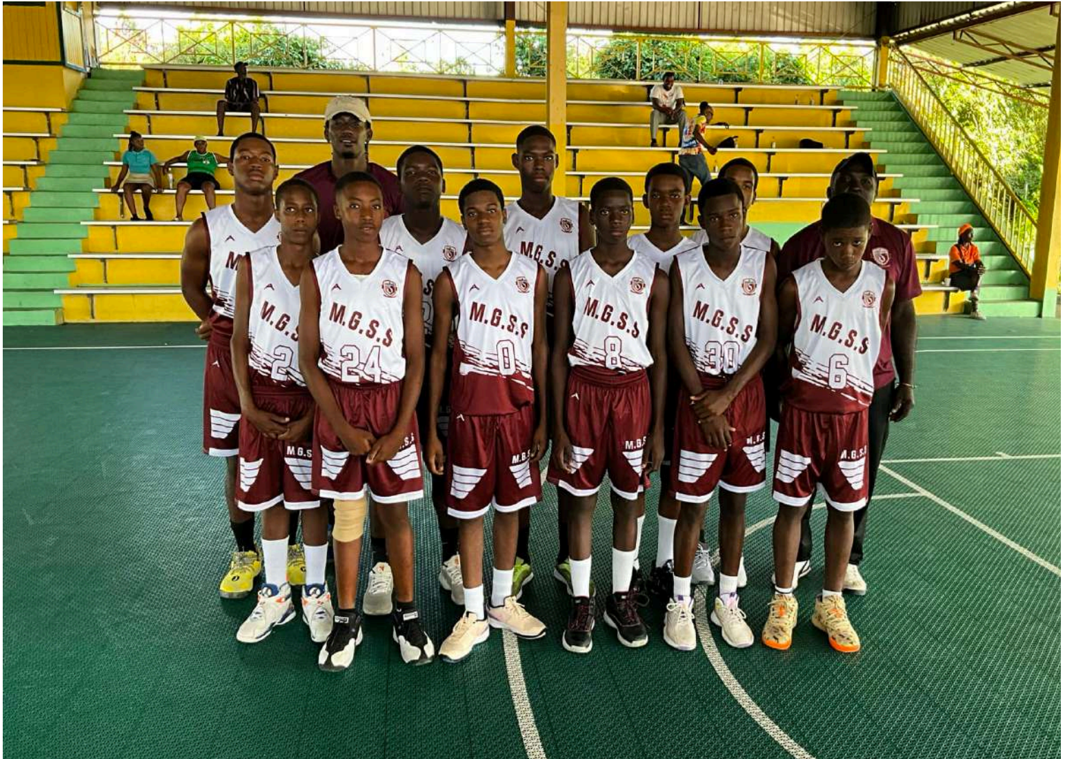
The Sir McChesney George Secondary team that is contesting the junior boys division in the Cool and Smooth Inter-School Basketball League.

The Sir McChesney George Secondary on the sister isle, Barbuda, was among the winners in the Cool and Smooth Inter-School Basketball League on Monday.