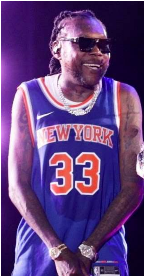
Dancehall superstar, Adidja "Vybz Kartel" Palmer

Dancehall superstar, Adidja "Vybz Kartel" Palmer will know by Friday, whether he will receive the green light to enter the United States of America (US) again for the first time in more than 20 years.