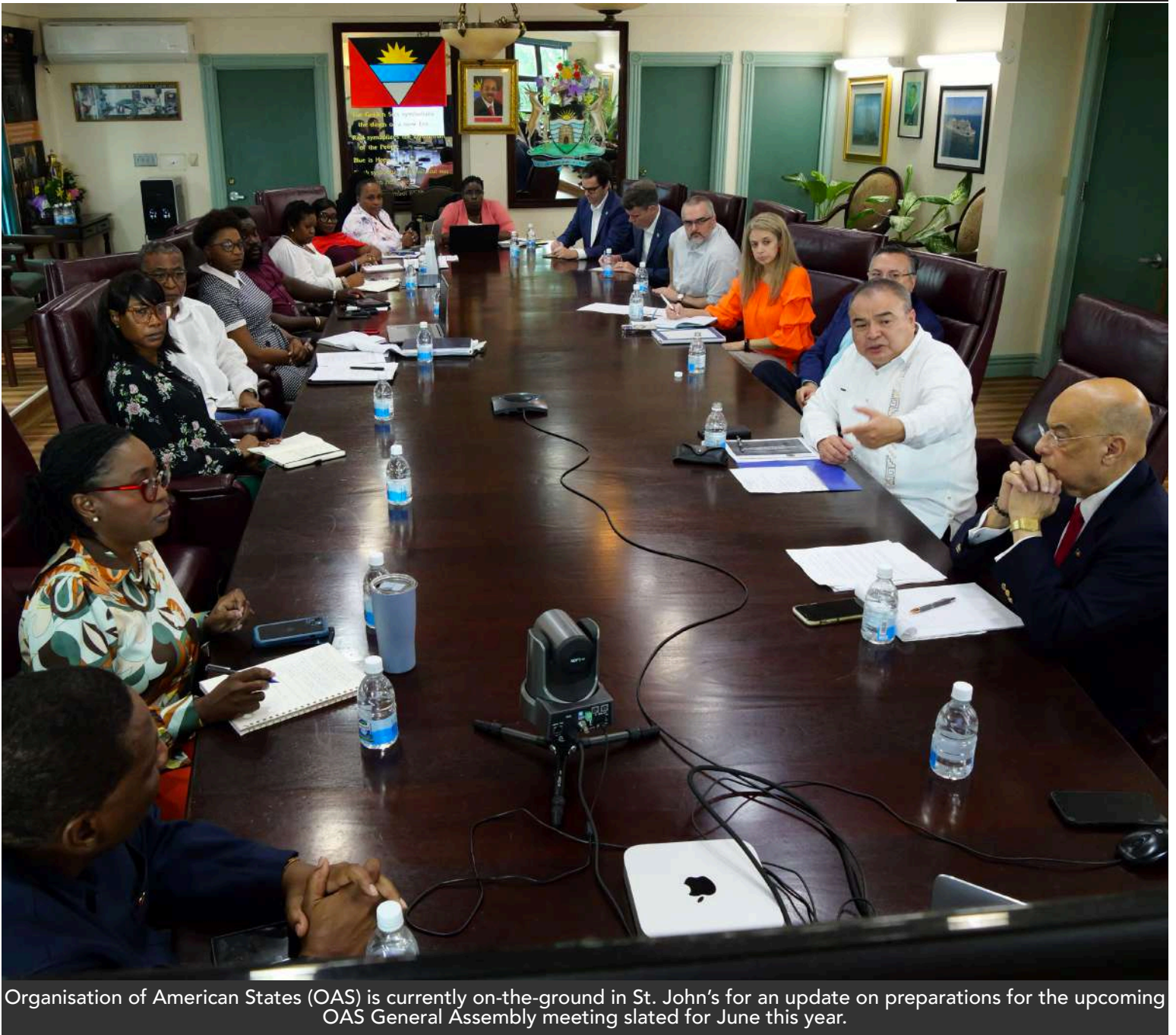
Organisation of American States (OAS) is currently on-the-ground in St. John's for an update on preparations for the upcoming OAS General Assembly meeting slated for June this year.