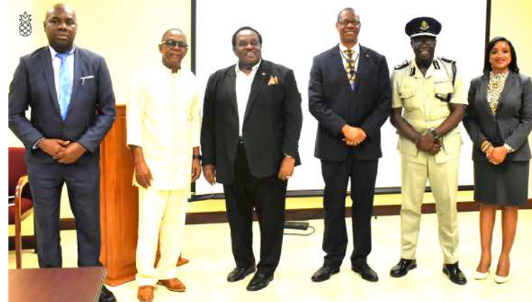
NATIONAL OVERSIGHT COMMITTEE ON FINANCIAL ACTION (NOCFCA)

Operating under the Prime Minister's Ministry, the National Oversight Committee on Financial Action (NOCFCA) provides strategic oversight and leadership to combat financial crimes and uphold international standards, ensuring the security and resilience of Antigua and Barbuda's financial system.