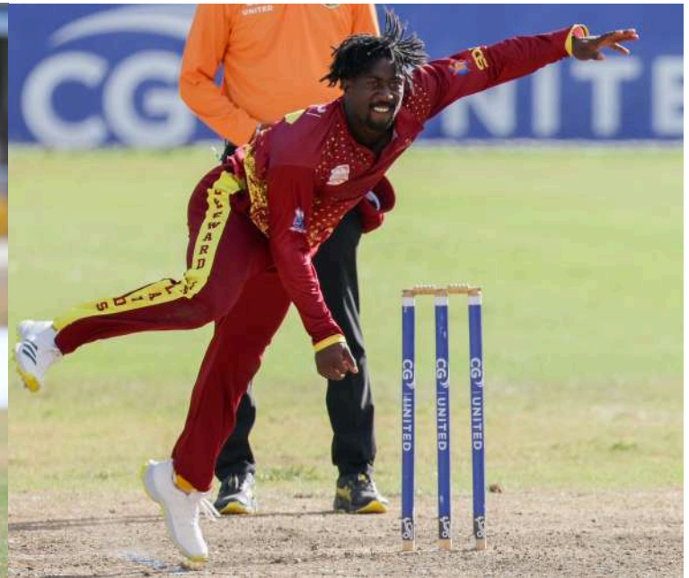
Leg-spinner Hayden Walsh Jr.

The Trinidad & Tobago Red Force and the Combined Campuses & Colleges (CCC) will clash in a day/night pink ball encounter at the Brian Lara Cricket Academy in Trinidad, and the Windward Islands Volcanoes will face the Jamai-