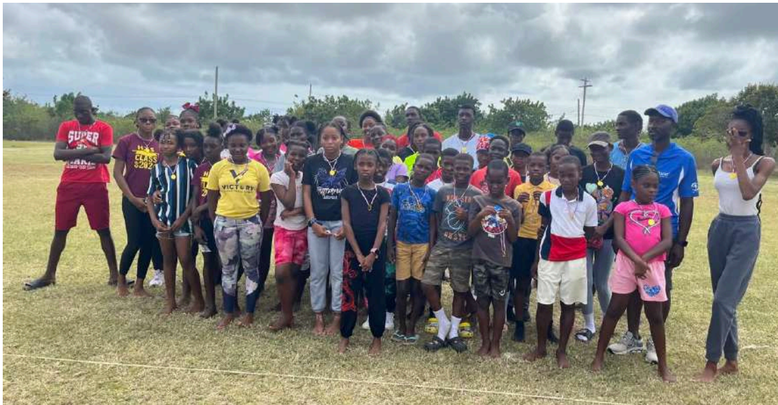
Athletics Association’s team visiting Barbuda

The Antigua and Barbuda Athletics Association has launched an initiative to train and develop athletes from the sister isle, Barbuda.