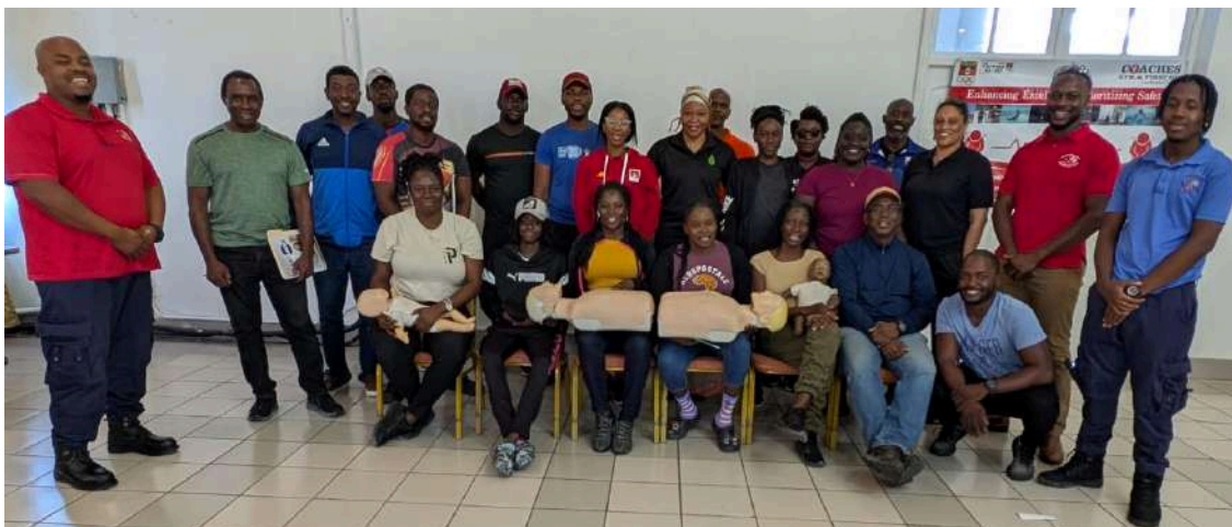
Antigua and Barbuda National Olympic Committee (ABNOC) hosted its highly anticipated Coaches CPR and First Aid Certification Course

Safety in sports took center stage as the Antigua and Barbuda National Olympic Committee (ABNOC) hosted its highly anticipated Coaches CPR and First Aid Certification Course. The event, held on Saturday, January 25, 2025, at the Mini Conference Room, Multipurpose Culture Centre, empowered national sports leaders with critical life-saving skills to enhance safety across Antigua and Barbuda's sports community.