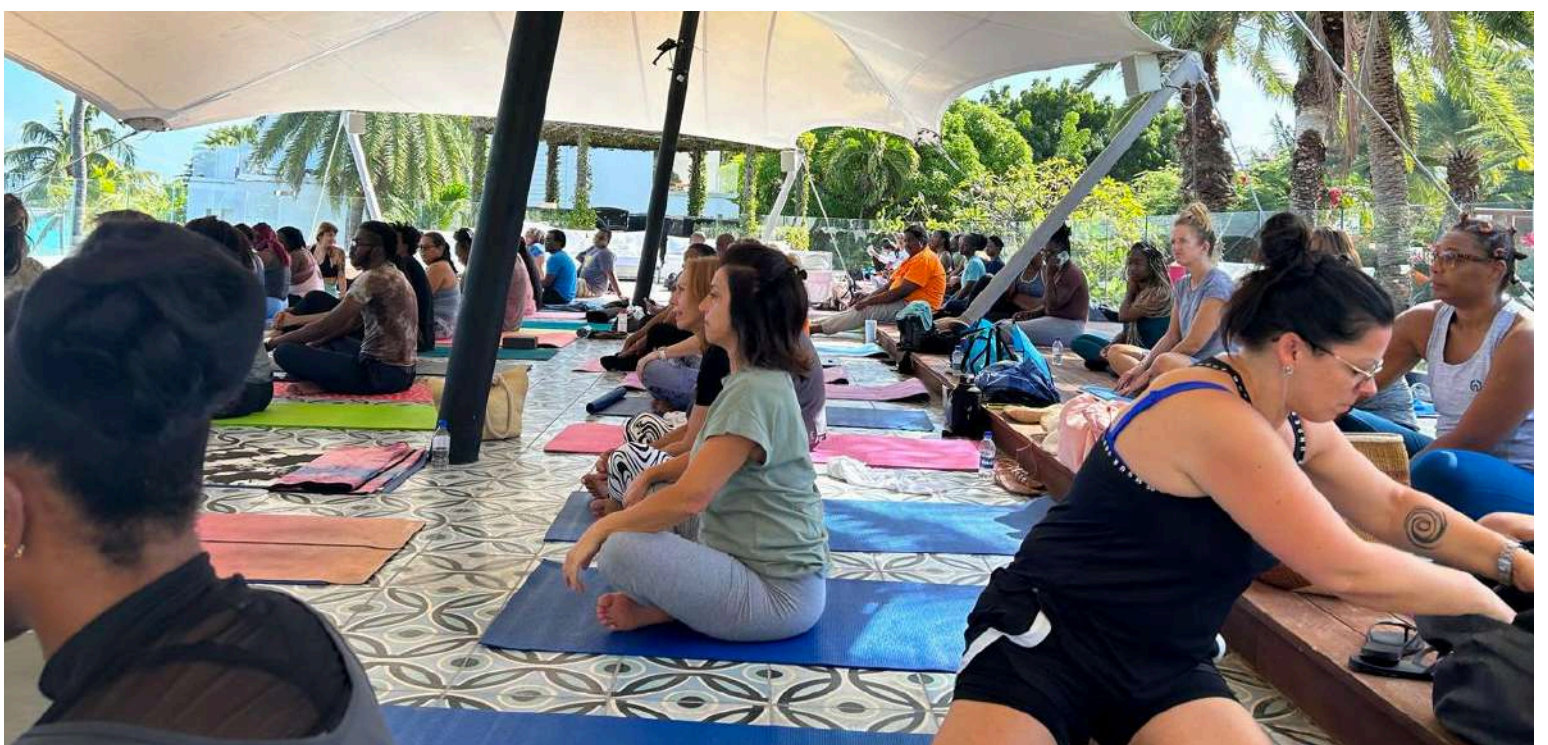
Attendees at yoga session planned as part of India Day