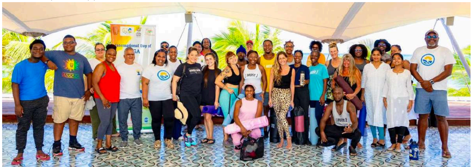
Celebrating India Day

"We are grateful for the strong friendship and support between India and Antigua and Barbuda," the honorary consul remarked.