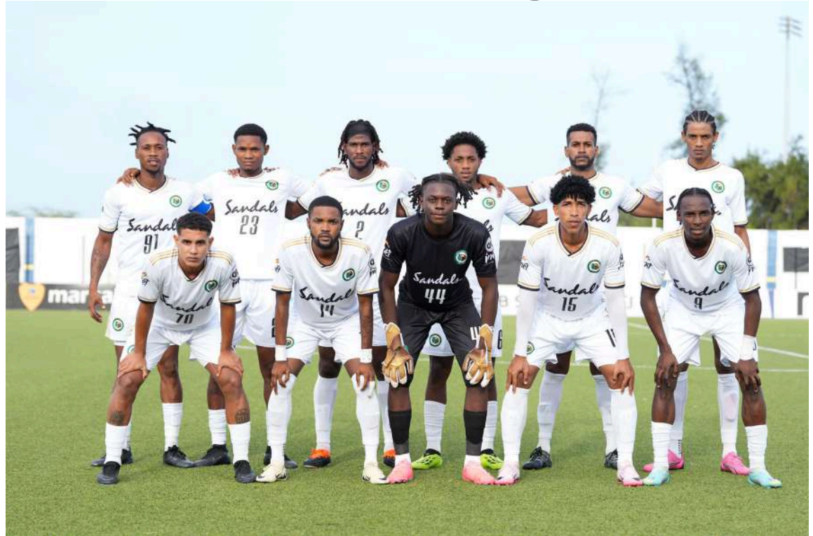
Players of the Sandals and Inet Jennings Grenades football team

the first stage in third place with 28 points after suffering their third loss in their quota of 13 matches.