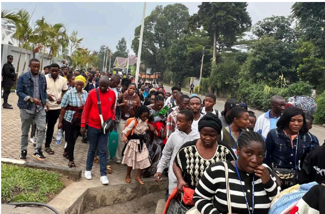
Residents in eastern Congo's largest city, Goma, were fleeing on Monday

Rwanda's state television also showed several Congolese soldiers surrendering in the Rwandan town of Rubavu after crossing the border from Goma.