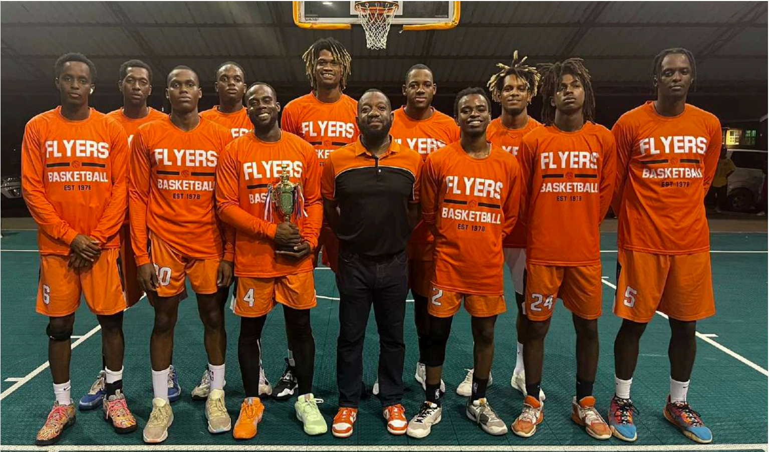
Players of the EZ Fit Flyers basketball team (File photo)

Reigning Division 1 league and playoff champions, the EZ Fit Flyers, made an impressive start to their campaign in the 2025 Antigua and Barbuda Basketball Association's (ABBA) domestic season on Sunday evening.