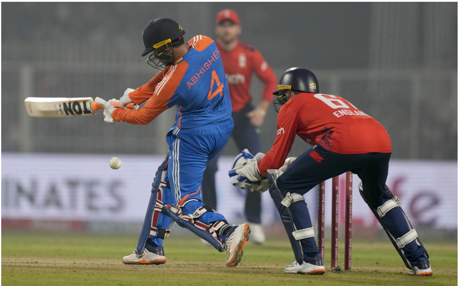
India's Abhishek Sharma, left, plays a shot during the first T20 International against England at Eden Gardens in Calcutta, India, January 22, 2025.

KOLKATA (Reuters) - Opener Abhishek Sharma's sensational power-hitting secured India's comprehensive seven-wicket victory against England in the opening T20 International at the Eden Gardens on Wednesday.