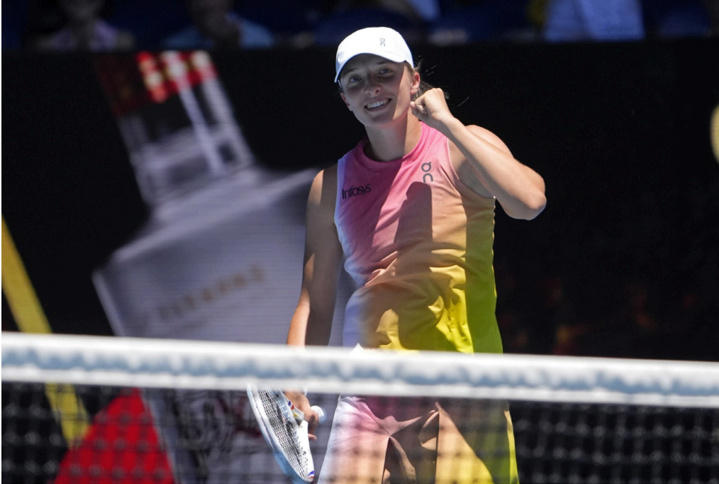
Iga Swiatek celebrates after beating Emma Navarro in her Australian Open women's singles quarter-final at the Rod Laver Arena in Melbourne, Australia, on Wednesday, January 22, 2025.

MELBOURNE (Reuters) - Iga Swiatek booked her second Australian Open semi-final with another spectacular display on Wednesday, while Americans reached the last four of the men's and women's singles at Melbourne Park for the first time in 16 years.