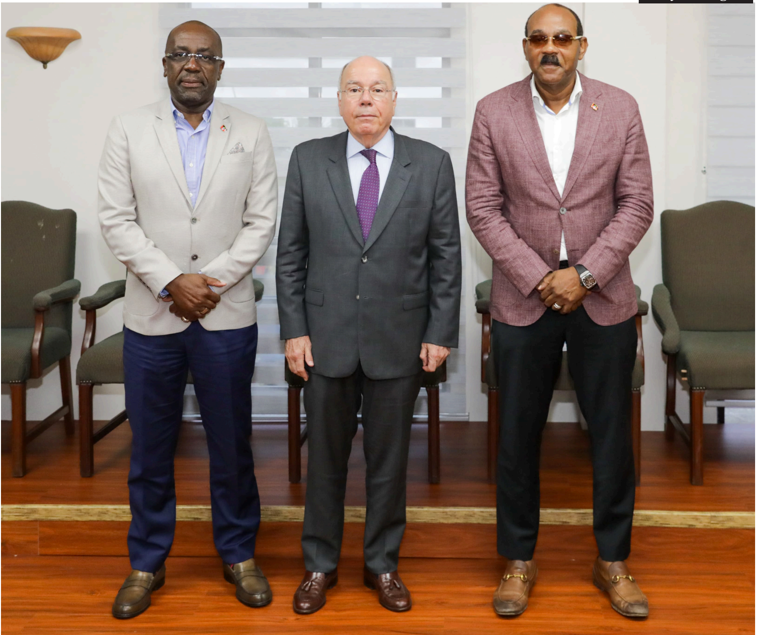
Foreign Affairs Minister E.P Chet Greene, his Brazilian counterpart Luiz Vieira and Prime Minister Gaston Browne