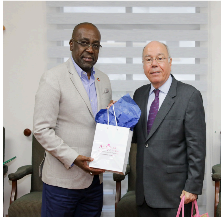
Foreign Affairs Minister, E.P. Chet and Minister Mauro Luiz Vieira.

Antigua and Barbuda Prime Minister Gaston Browne says the country is ‘happy to be fully aligned’ with Brazil on many issues as both countries expressed a desire to strengthen the existing relations they now enjoy.