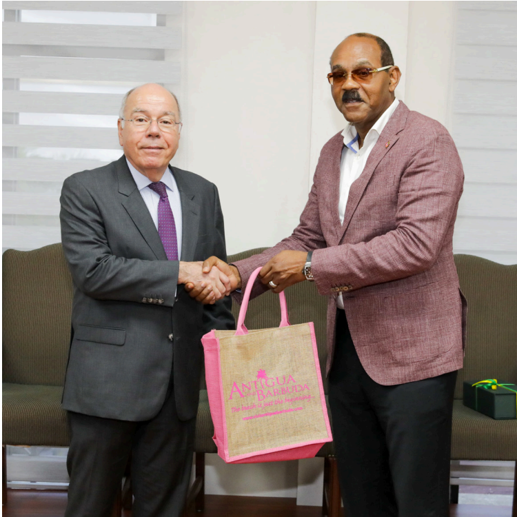
Prime Minister Gaston Browne and Minister Mauro Luiz Vieira.