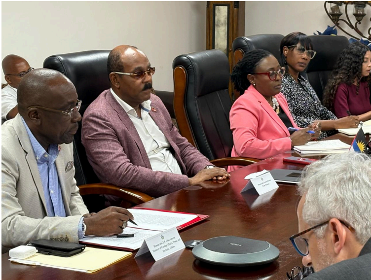
Prime Minister Gaston Browne and Foreign Minister, E.P. Chet Greene

As consumers in Antigua and Barbuda grapple with inflation most of which is imported, the government is looking to Brazil as a source for quality products at prices cheaper than from other sources.