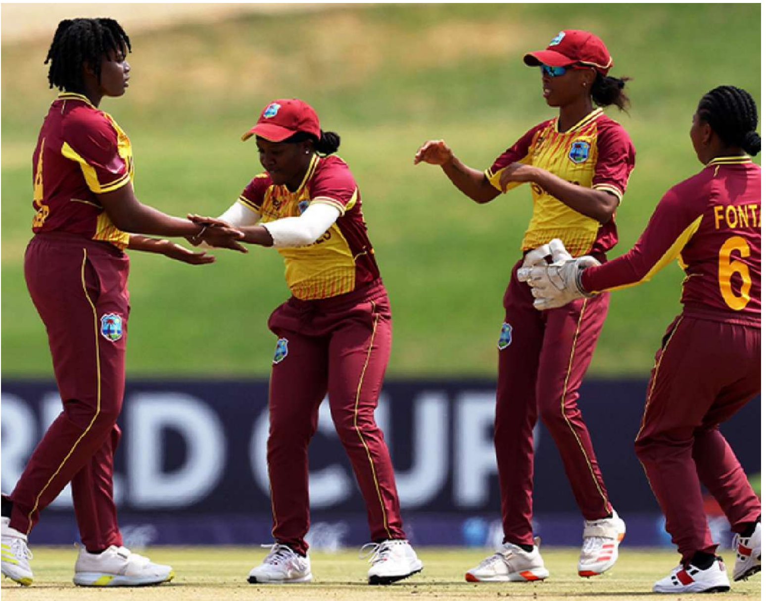
Players of the West Indies Under-19 team