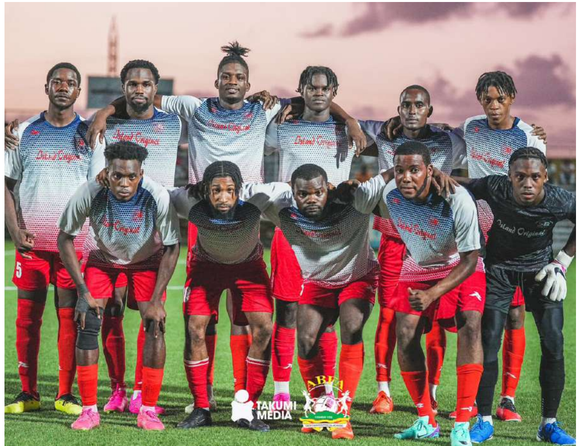
Players of the John Hughes starting XI.

up their eighth win in 11 matches with a 4-0 drubbing of the CPTSA Wings at the St. Johnstone's Village Stadium on Monday.