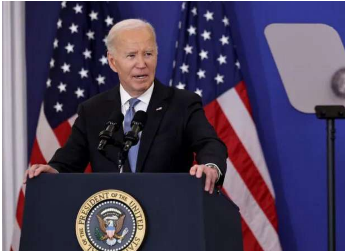
US President Joe Biden gave his final foreign policy address earlier this week.

ers have not been announced - it was hoped the deal would prompt the release of some protesters imprisoned after large anti-government protests in Cuba over the nation’s economic decline in 2021.