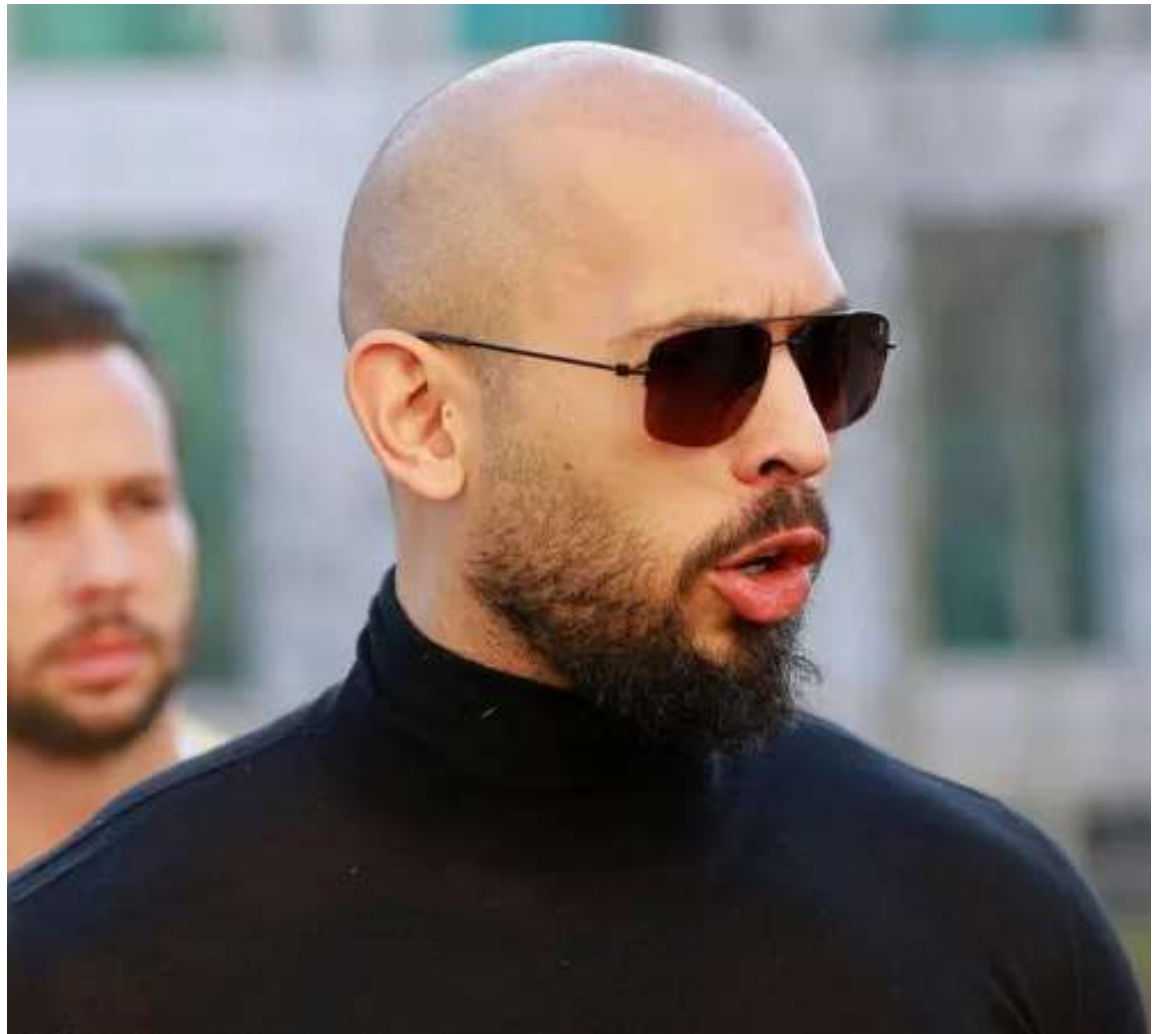
Andrew Tate is accused of human trafficking and sexually exploiting women alongside his brother Tristan.

A first, separate case against the brothers was sent back to prosecutors by the Court of Appeals in Bucharest in December for the second time, saying it could not proceed in its current