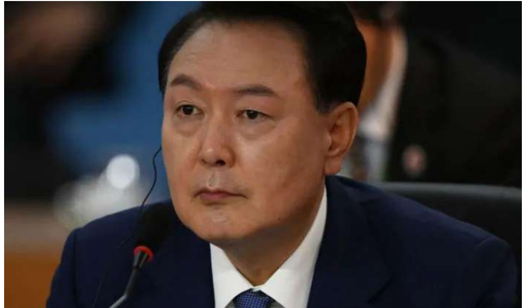
Yoon is South Korea's first sitting president to face arrest.

since parliament voted to impeach him on 14 December and has been speaking primarily through his lawyers.