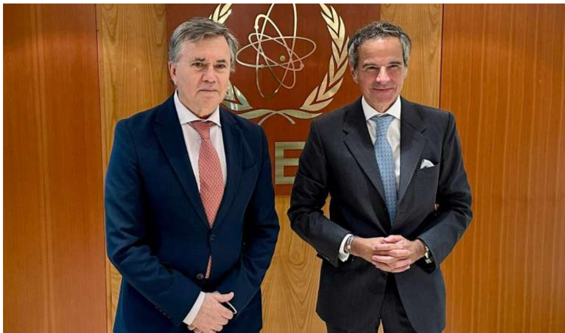
Manuel Otero, Director General of IICA and Rafael Grossi, Director General of the IAEA.

"We signed an agreement that will strengthen the cooperation we already have to disseminate nuclear technologies that have a positive impact on agriculture and the welfare of rural communities," Grossi said shar-