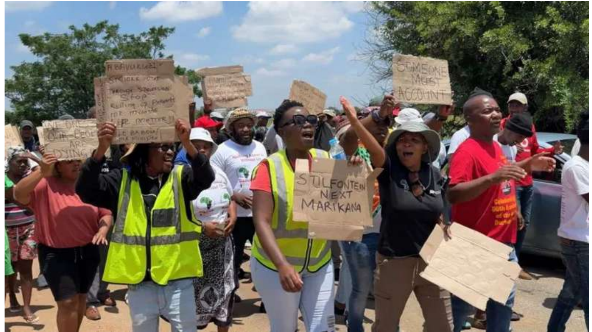
Relatives, union staff and members of the local community have been protesting outside the mine.

The authorities however, have not confirmed this figure as it is yet to be “verified by an official source”, a spokesperson told the BBC.