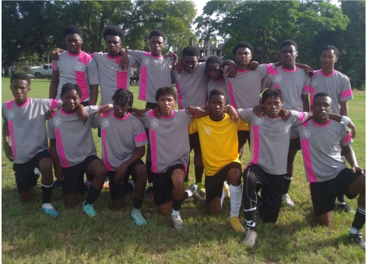
The PMS Under-20 Boys football team

Karique Knight struck a hat trick to lead ABICE, the 2022 champions, to a