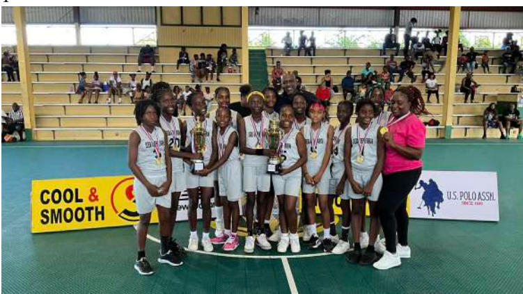
Sea View Farm Primary pose with their trophies after capturing the league and playoff titles in the Minigirls Primary Division.