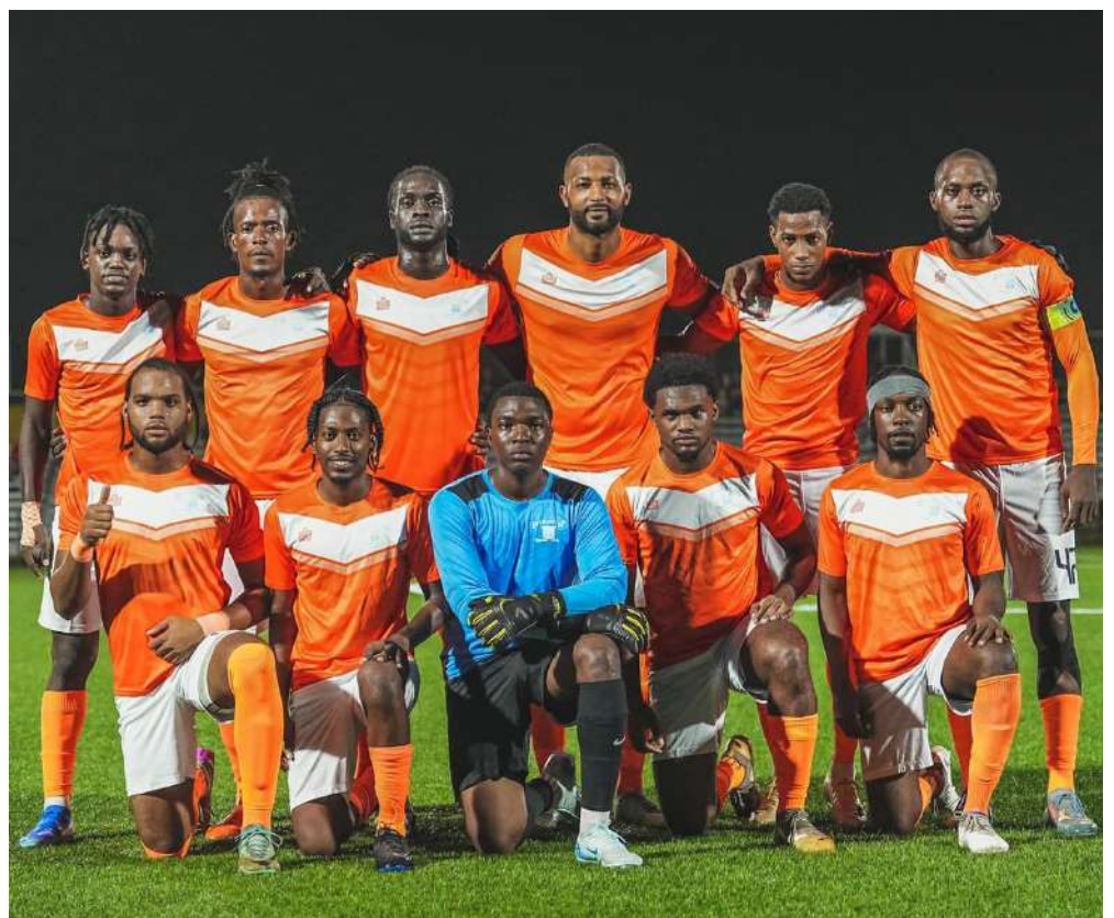
Players of the Pigotts Bullets football team

The result ended a dismal run of seven consecutive defeats for the Willikies Warriors, who finished their first round campaign with 10 points after recording their first draw in 13 matches.