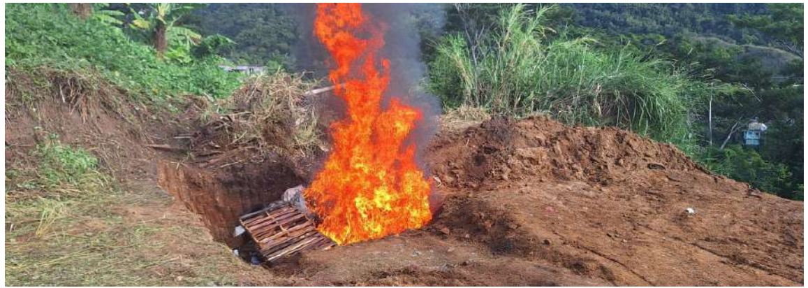
Dominica police destroy over EC$36m in illicit drugs.