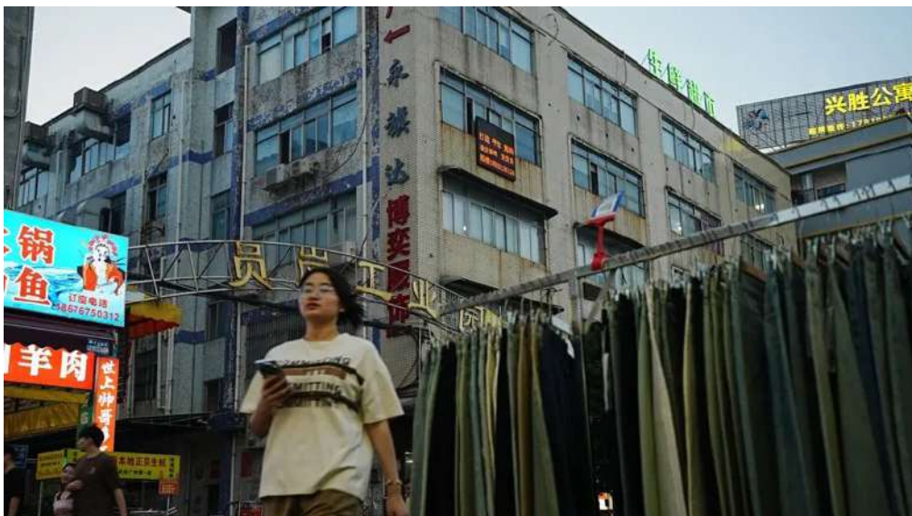
Many factories remain open well into the night, with some people working until midnight.