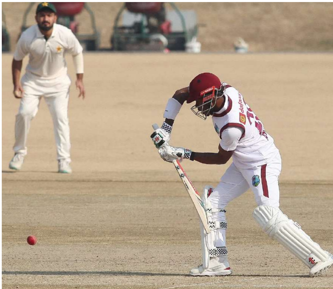
West Indies player Alick Athanaze bats during the three-day tour match against the Pakistan Shaheens in Islamabad.

Tevin Imlach also impressed with a fluent 57 off 65 balls, including nine boundaries to keep the mo-