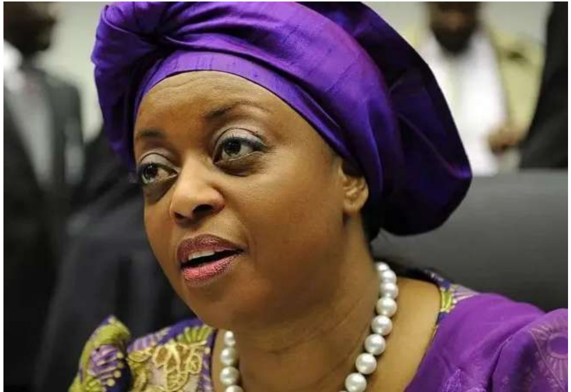
Diezani Alison-Madueke has been dogged by corruption allegations since leaving office, which she denies.

Her time as Nigeria's minister of petroleum resources began in 2010 and