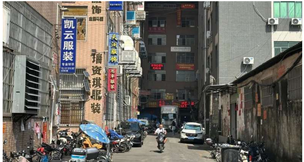
The den of factories in Panyu is integral to China's supply chain supremacy.

This is Shein's supply chain. The factories are contracted to make clothes