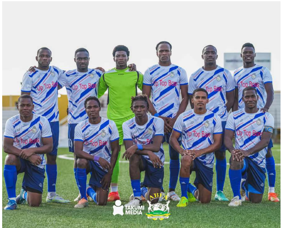
Players of the Old Road football team.

The result allows Old Road to advance to 28 points from 12 matches, while the Attacking Saints will remain on 14 points af-