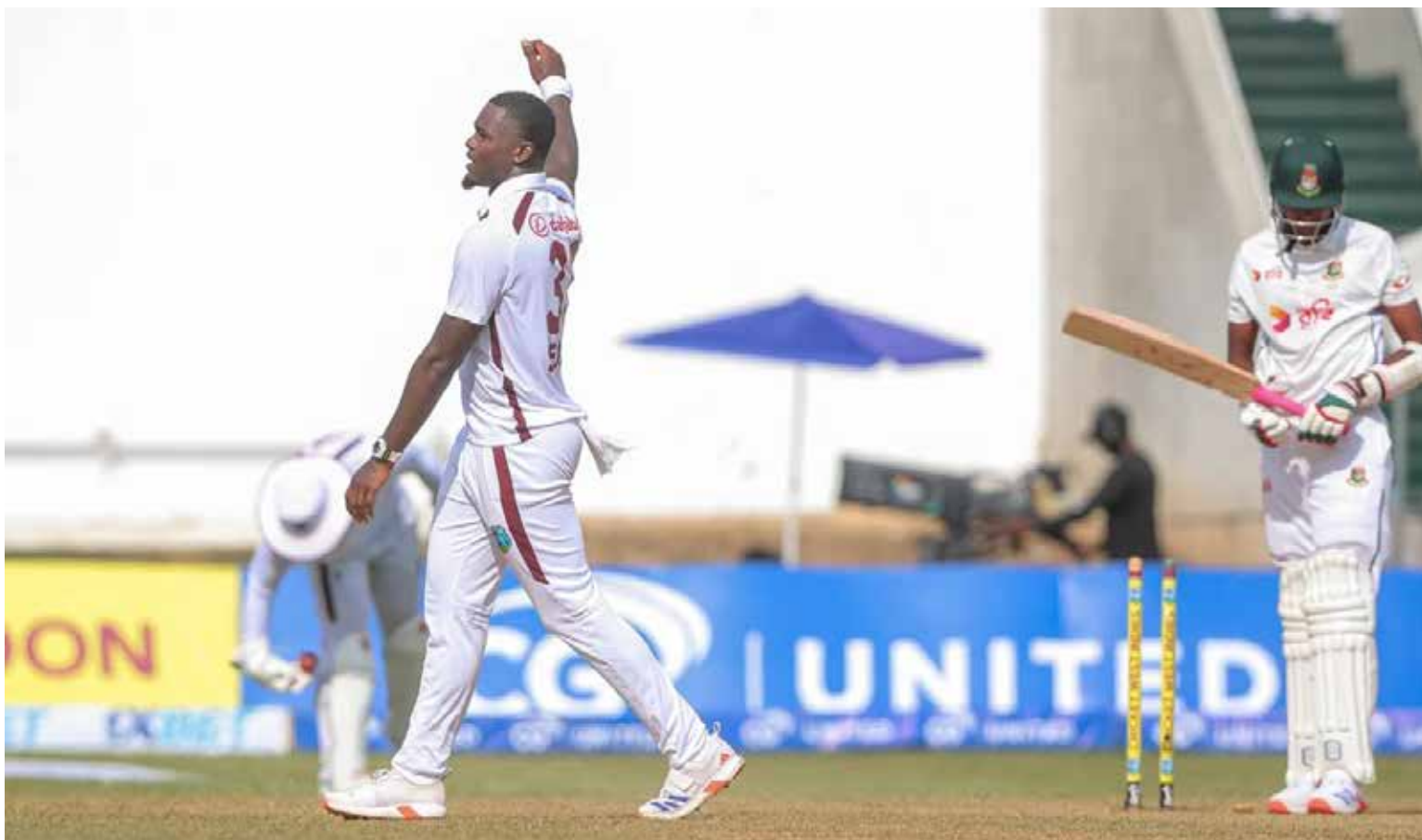
West Indies pacer Jayden Seales, celebrates after dismissing Bangladesh batsman Nahid Rana, right, on the second day of the second cricket Test at Sabina Park in Jamaica on Sunday, December 1, 2024.