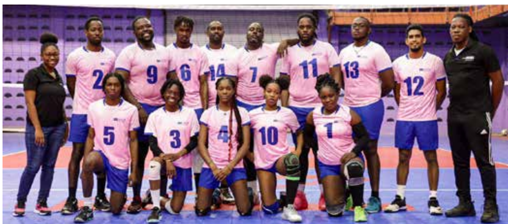
Nate's Photography volleyball team

The winners of the semi-finals will advance to the finals, which will be a best-of-three series, from which the 2024 champions of the business volleyball league will be crowned.