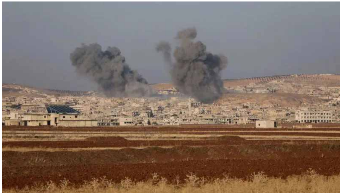
Smoke rises from the town of Suran, between Aleppo and Hama, on Tuesday.

Before the start of the rebel offensive, the government had regained control