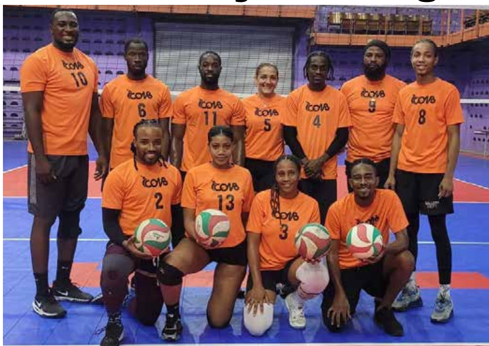
ICONS volleyball team

qualifiers into the semi-finals by virtue of finishing as the top two teams in Group A. The ICONS ended ECAB's perfect run by prevailing 2-0 when both teams met in their top-of-the-table Group B clash.