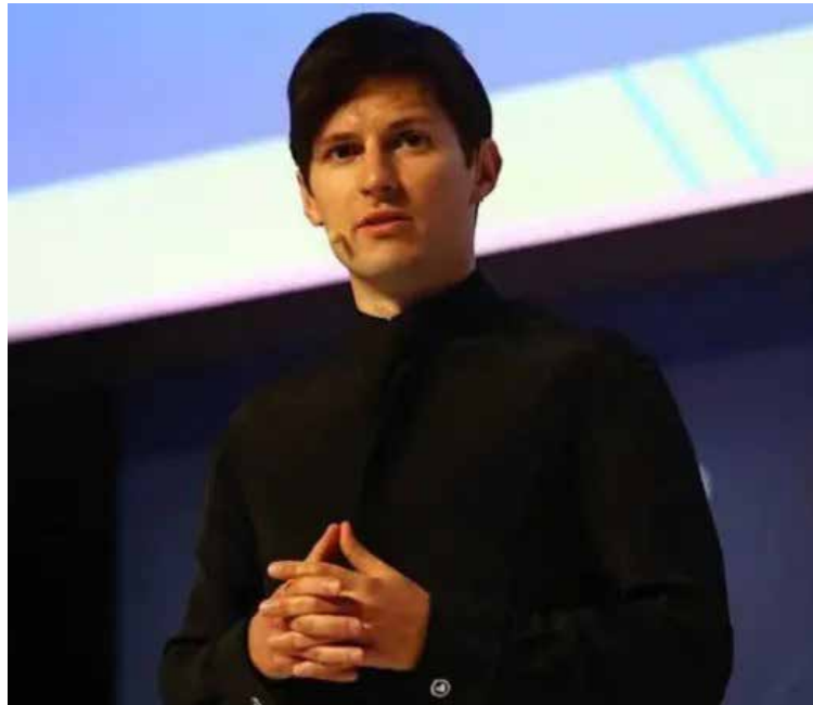
Telegram founder Pavel Durov, pictured in 2016.

Telegram is used by around 950 million people worldwide and has previously positioned itself as an app focussed on its users' privacy rather than the