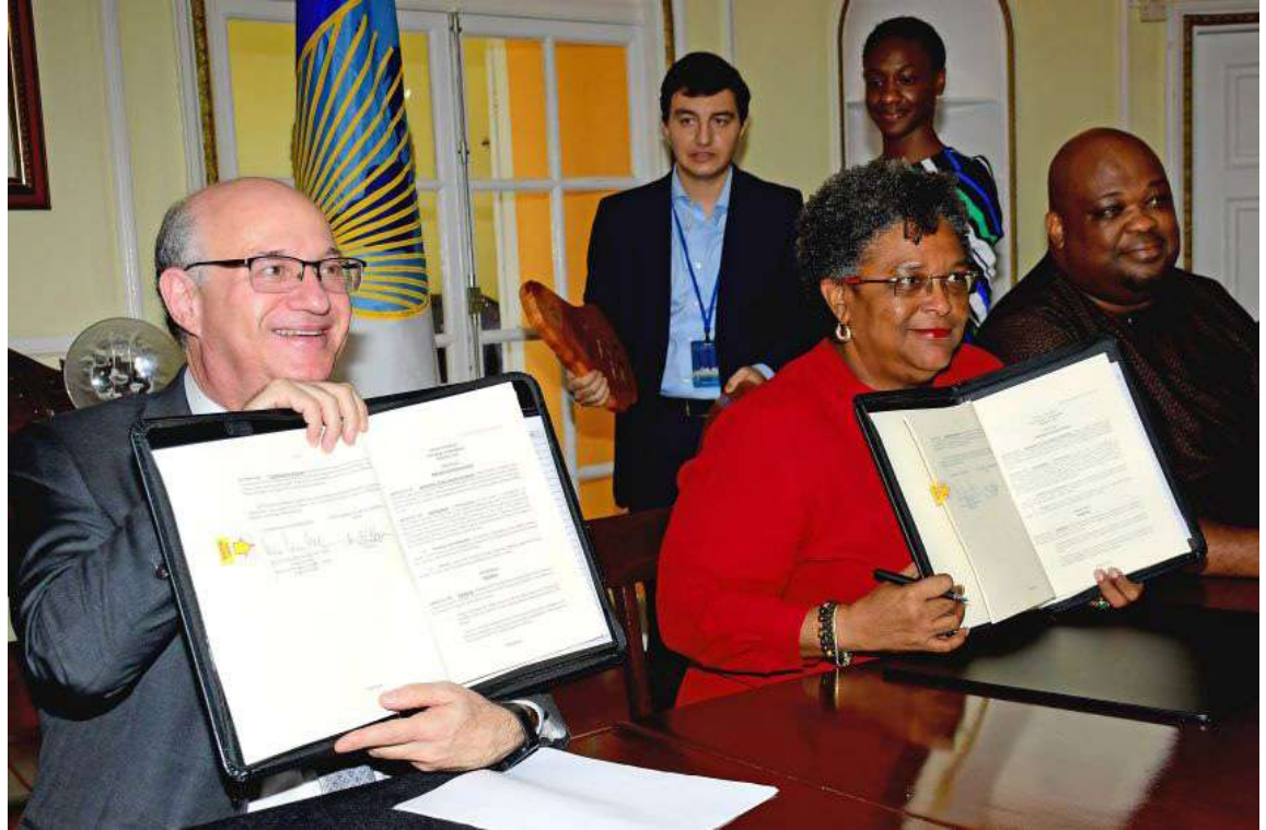
President of the Inter-American Development Bank (IDB), Ilan Goldfajn and Prime Minister Mia Amor Mottley display the signed documents for the $40 million loan aimed at driving climate resiliency and water security in Barbados, as officials look on.

The Prime Minister said that flooding, drought-like conditions, climate change,