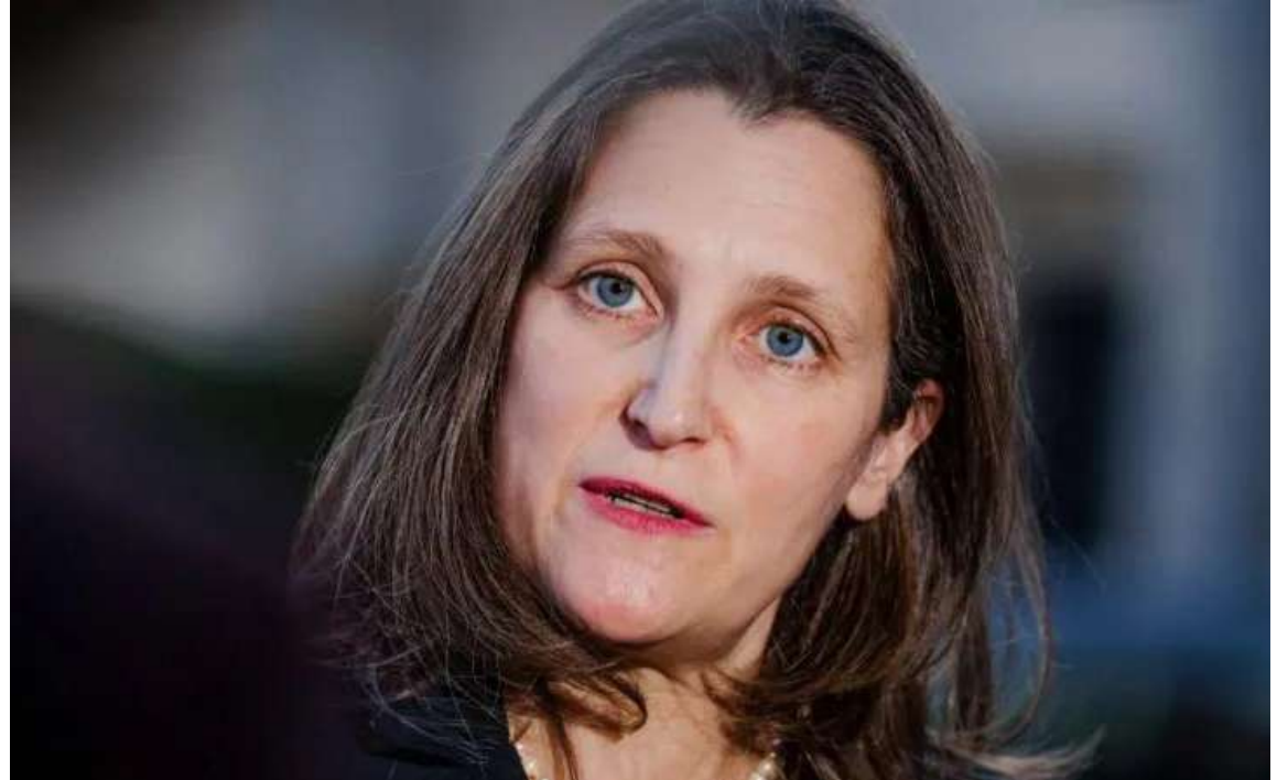
Chrystia Freeland resigned from her post as finance minister Monday.

departure on Monday, five sitting Liberal MP publicly called on Trudeau to step down.