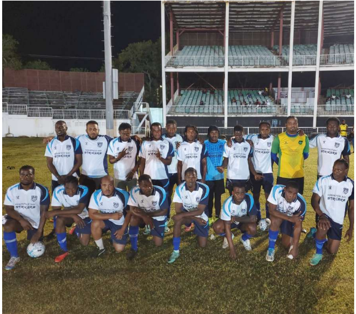
Players of the Hermitage Hotel football team after winning the 2024 JOMA Caribbean Ministry of Sports Business Football League Championship at the Antigua Recreation Grounds (ARG) on Saturday, December 14.

Hermitage won Zone 1, the Ministry of Agriculture came out on top in Zone 2, and the Antigua Port Au-