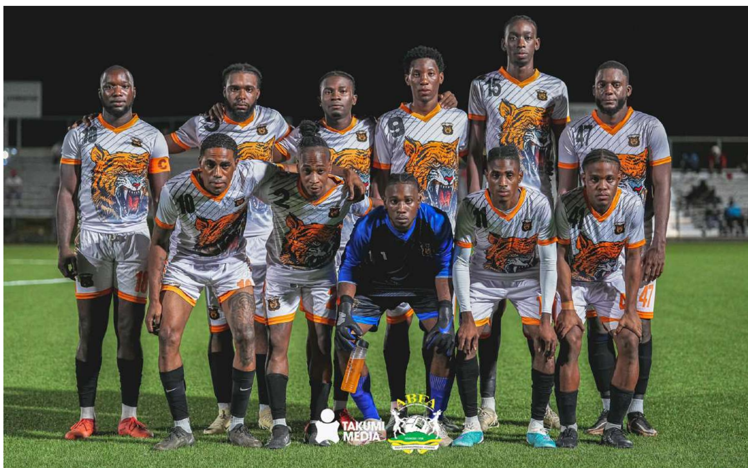
Players of the Potters Tigers football team