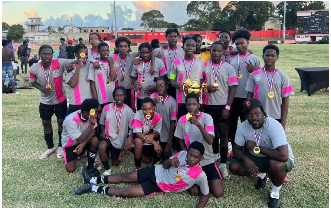
The Princess Margaret School team with their medals and trophy after winning the Under-16 Boys Division league title in the Ministry of Sports, Cool and Smooth, and Joma Patrick C. Whyte Cup Secondary Schools' Football Competition at the Antigua Recreation Grounds (ARG) on Thursday, December 12, 2024.

It was the only defeat for Ottos Comprehensive School, which won all pre-