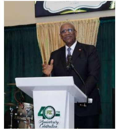
Governor General, Sir Rodney Williams.

“The Finance and Development Company, has demonstrated its love and concern for the ordinary man and woman in this state in a completely different way...And, especially in its dealings with the young people; the poor, the down-trodden, the oppressed and those persons who were and are unable to obtain financing from those other finan-