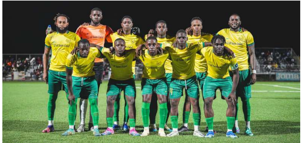
Players of the All Saints United Starting XI ing their seventh loss in eight matches.

The result also allows the Greenbay Hoppers to stay second from the bottom of the standings on goal difference by remaining on three points after suffer-