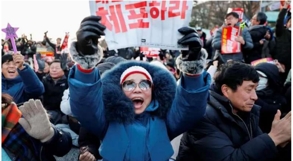
The joy was palpable after the result was announced, with many erupting in cheers and singing in jubilation.

On Saturday, the impeachment motion reached the two thirds threshold needed to pass after 12 members