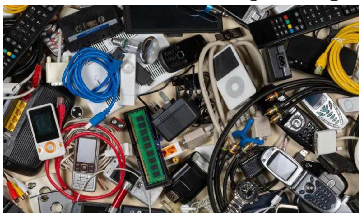
The UK government hope its plan will ensure fairness for UK businesses by making major online marketplaces pay more for the recycling of old technology.

"Under these new plans, online marketplaces – Amazon, eBay and others – will face much tougher obligations to ensure that overseas sellers who use their platforms contribute to that cost of collection and recycling," Creagh told PA News.