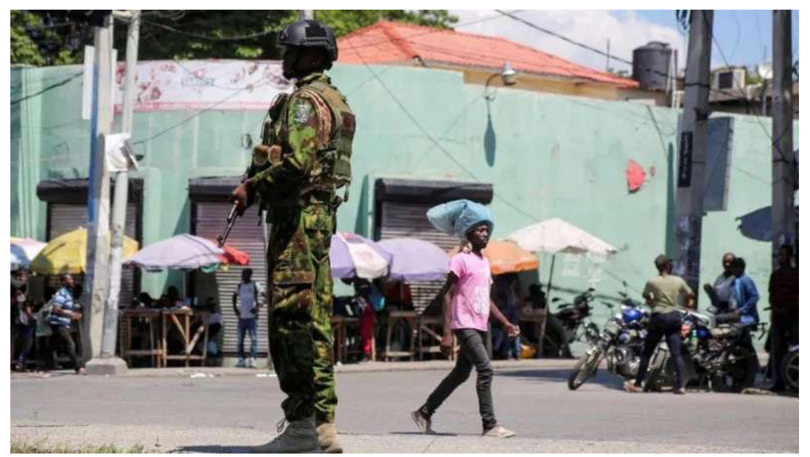
Haiti has been gripped by bloody gang violence in recent years.

According to reports, gang members seized scores of residents aged over 60 from their homes in the Wharf Jérémie area, rounded them up and then shot or stabbed them to death with knives and machetes.