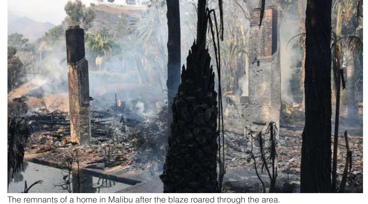
remains of homes.

California is a state that is prone to wildfires. The cont'd on pg 17