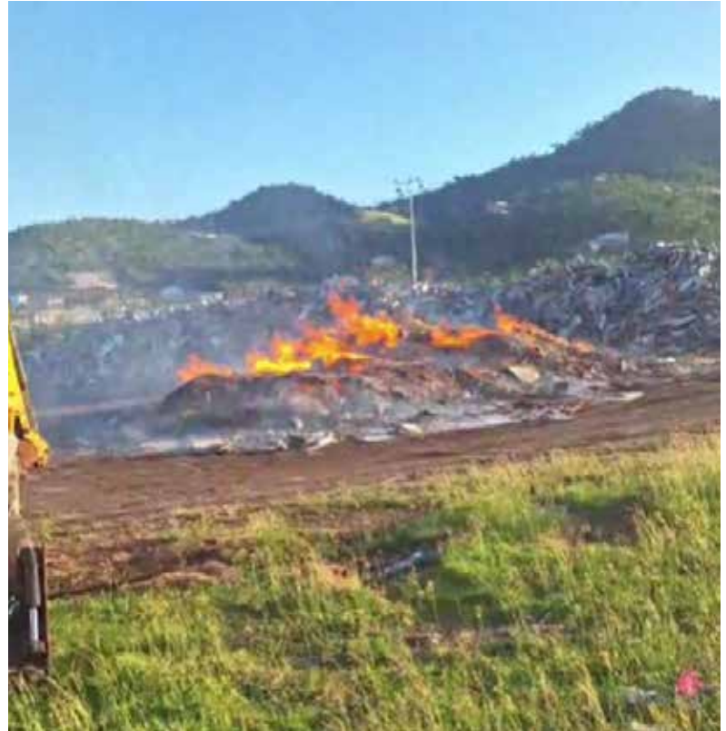
Harvey Vale playing field