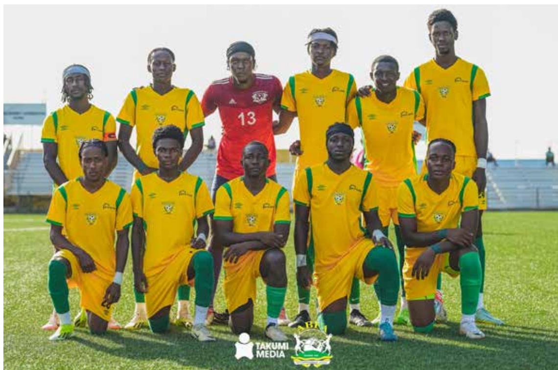
The starting XI for the Garden Stars FC.

Meanwhile, English Harbour continued their perfect start to their campaign in the ABFA's Second Division on Monday.