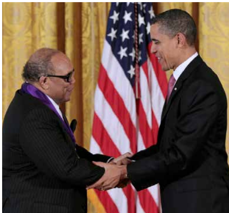
President Barack Obama presents a 2010 National Medal of Arts to musician and record producer Quincy Jones, Wednesday, March 2, 2011, during a ceremony in the East Room of the White House in Washington. Quincy Jones has died at age 91.

Jones rose from running with gangs on the South Side of Chicago to the very heights of show business, becoming one of the first Black executives to thrive in Hollywood and leaving behind a vast musical catalogue that includes some of the richest moments of American song and rhythm. Over the past half-century, it was hard to find a music lover who did not own at least one record with Jones' name on it or someone in the music, television or movie industries who did not have some connection