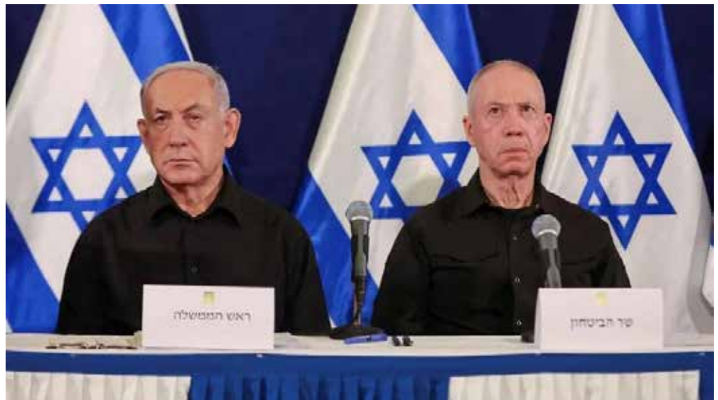
A photo from October last year shows Netanyahu, left, next to Gallant during a press conference.

The Hostages and Missing Families Forum called on the incoming minister Katz to "express an explicit commitment to the end of the war and to carry out a comprehensive deal for the immediate return of all the abduct-