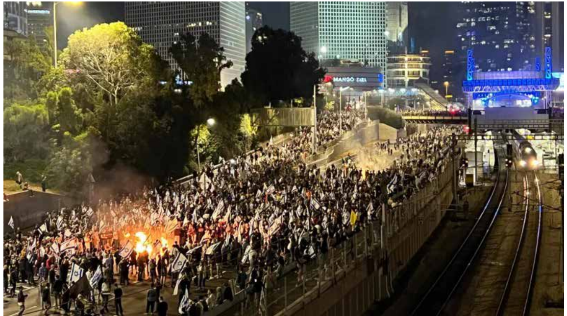
Hundreds took to the Ayalon Highway in Tel Aviv on Tuesday night protesting against Gallant's dismissal.

Months before the start of the war in Gaza in October 2023, Netanyahu had fired Gallant over political differences, before reinstating him following major public outcry.