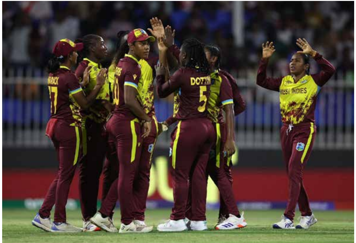
Players of the senior West Indies women's team.

Following their semifinal appearance at the ICC