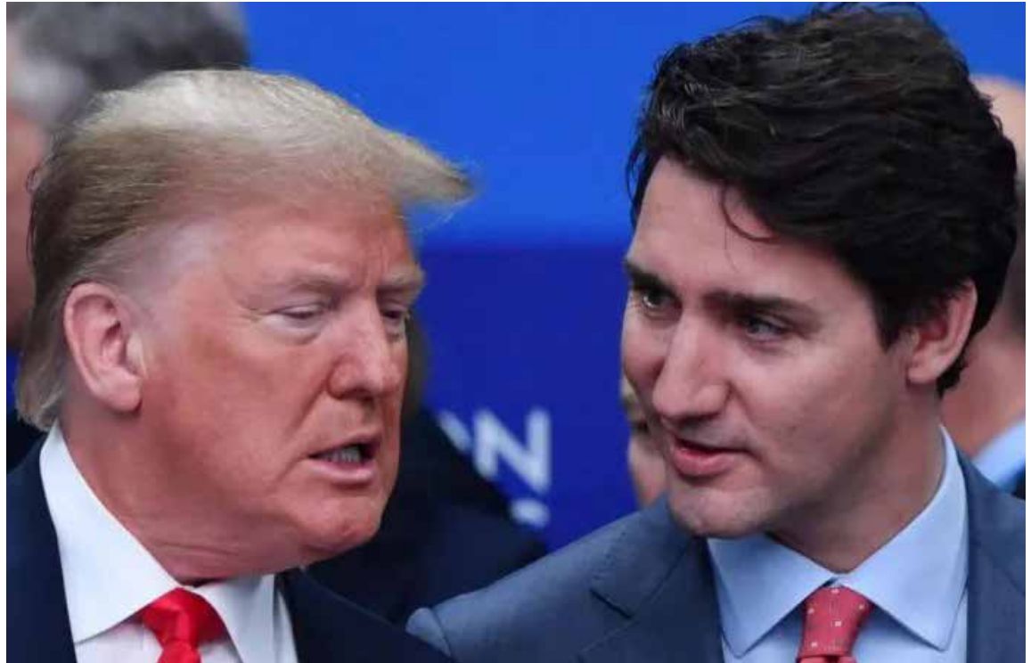
US President-elect Donald Trump, left, shares a few words with Canada's Prime Minister Justin Trudeau.