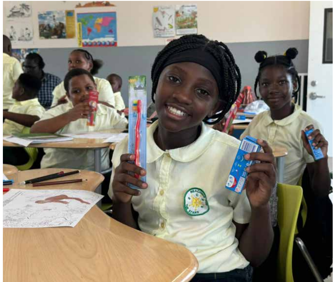
Students from the Enid Capron Primary School in Five Cays share bright smiles and the gifts that they received from the Great Shape Inc! 1000 Smiles Dental volunteers.