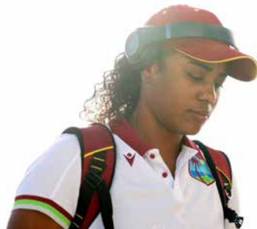
West Indies women's team skipper Hayley Matthews

The squad, under the leadership of captain Hayley Matthews, presents a balanced combination of established players and emerging talent. Stafanie Taylor is currently rehabilitating from an injury sustained and will be absent from this tour.