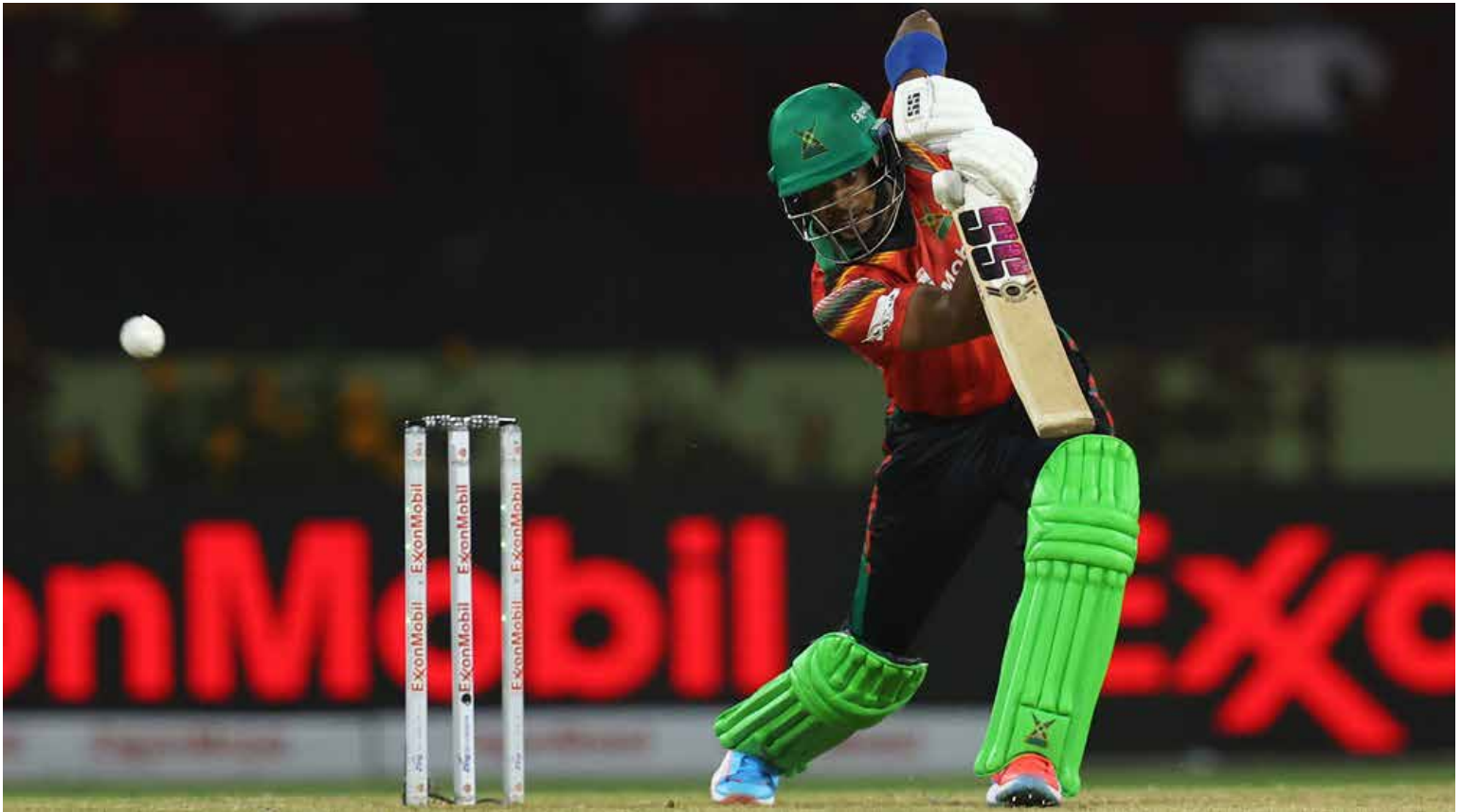
Shai Hope hits 45 from 43 balls for the Guyana Amazon Warriors against the Lahore Qalandars in the opening match of the inaugural Global Super League at the National Stadium in Providence, Guyana, on Tuesday, November 26, 2024.