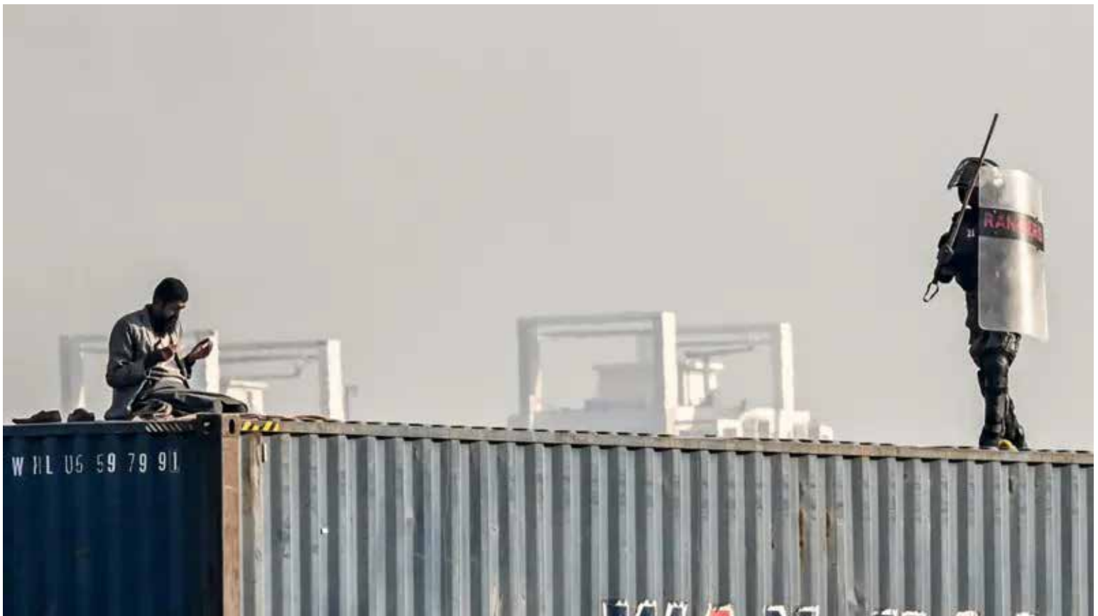
The man is seen offering prayers on top of a shipping container, moments before soldiers approach him.