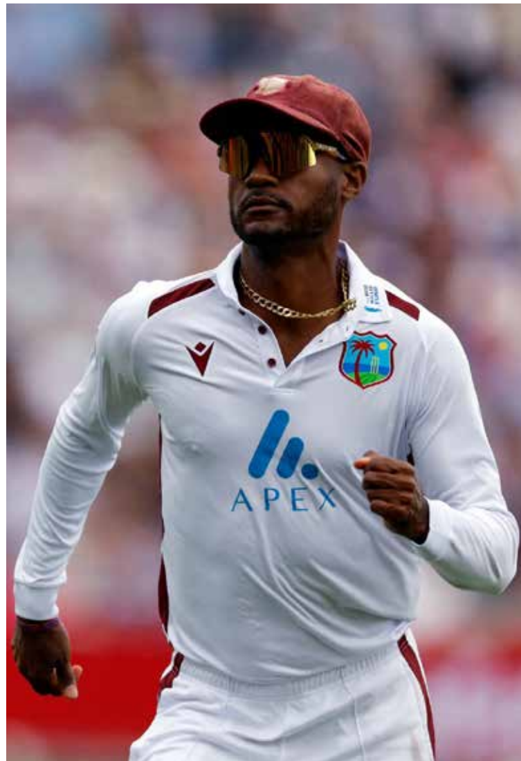
West Indies captain Kraigg Brathwaite

"I Think we bowled really well. Taskin got six wickets but they had a