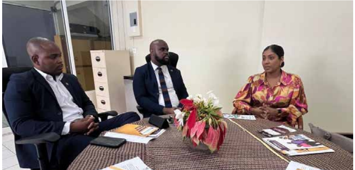
SARC Open House

en and girls (VAWG) remains the most prevalent and pervasive human rights violation in the world. Globally, an estimated 736 million women — nearly one in three — have experienced physical and/or sexual violence by an intimate partner, non-partner sexual violence, or both at least once in their lives.